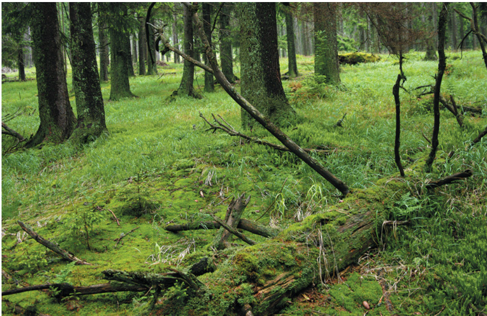
Fig. 4. Natural montane Calamagrostis spruce forest in summit area (BP10d) of Mt. Boubín.