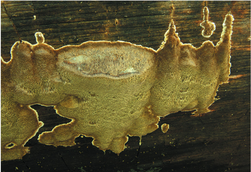
Fig. 22. Phellinus pouzarii , BP4a, 3 October 2013, PRM 923087.