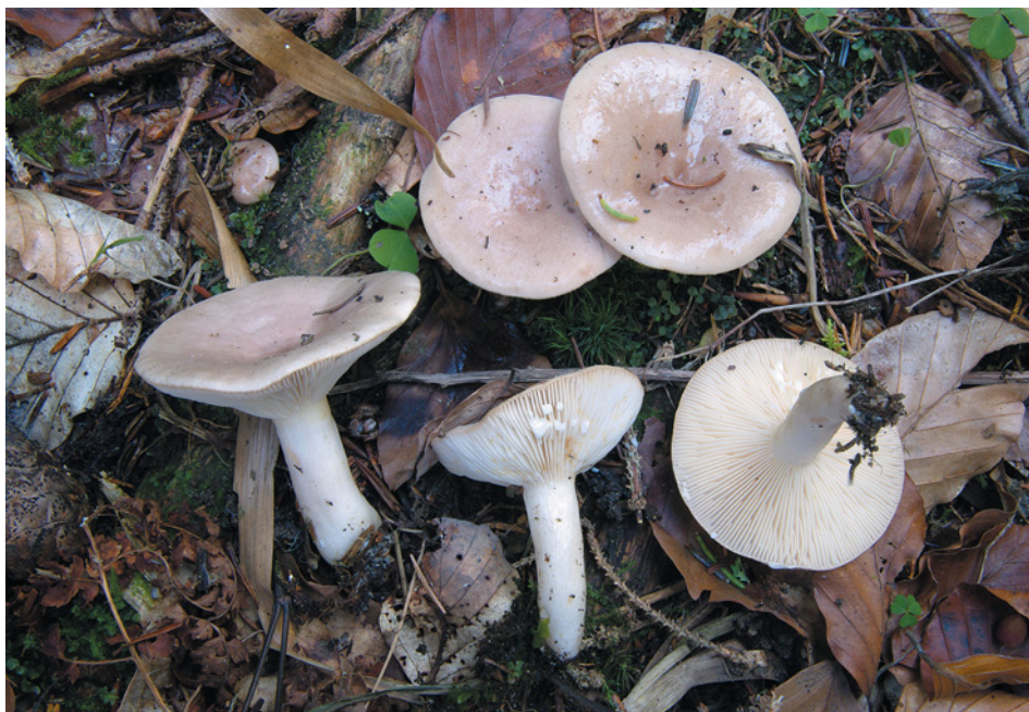
Fig. 23. Lactarius albocarneus , BP1c, 3 October 2013, PRM 923072.