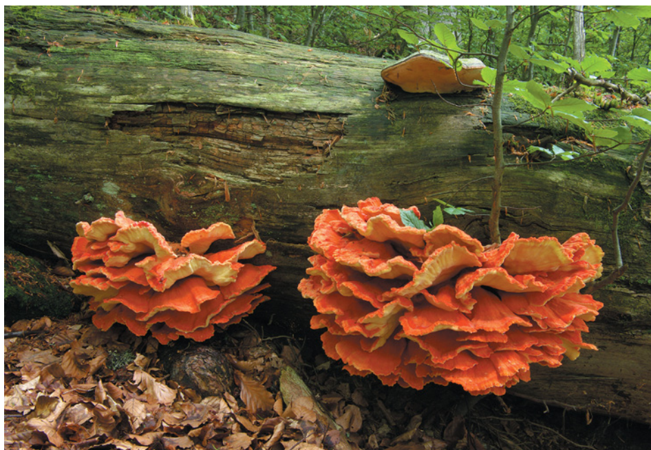
Fig. 10. Laetiporus montanus , BP8b, 2 July 2014, PRM 932964. Photo J. Holec.