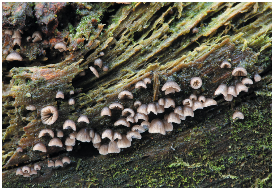
Fig. 16. Resupinatus striatulus , BP4b, 11 September 2013, PRM 922981. Photo M. Kříž.