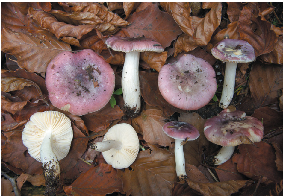
Fig. 24. Russula cavipes , BP1b, 23 October 2013, PRM 923180.