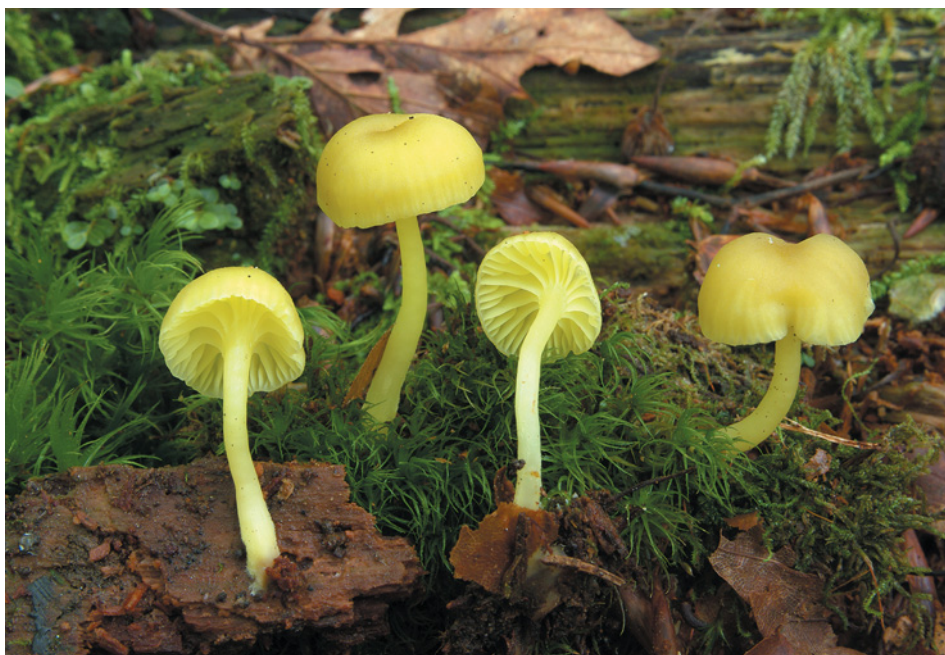
Fig. 18. Chrysomphalina grossula , BP1d, 11 September 2014, PRM 924973.