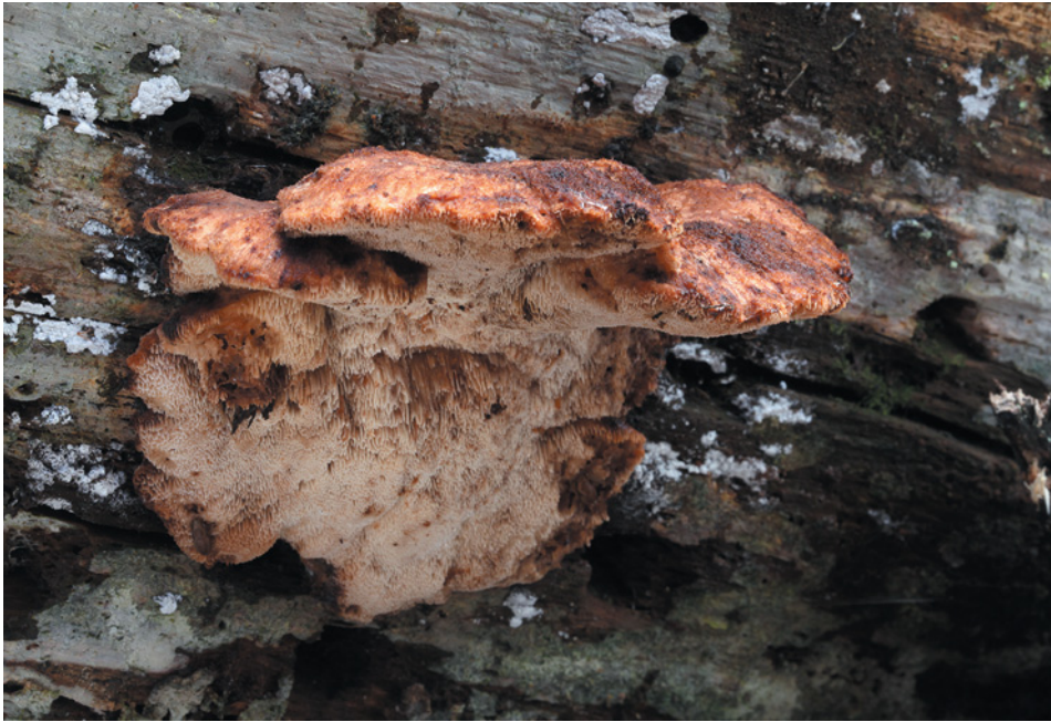
Fig. 5. Amylocystis lapponica , BP1e, 24 October 2013, not documented by voucher.