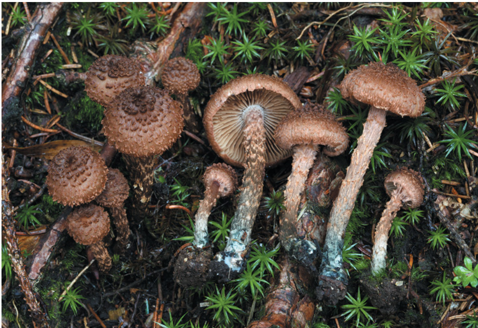
Fig. 26. Inocybe calamistrata , BP10b, 12 September 2013, PRM 922987.