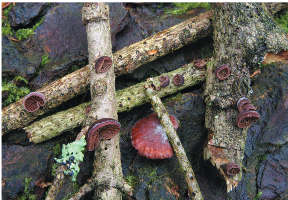
Fig. 20. Panellus violaceofulvus , BP2a, 20 November 2013, PRM 923372.