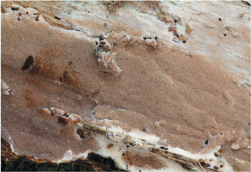
Fig. 13. Junghuhnia collabens , BP2a, 19 July 2013, PRM 922608.