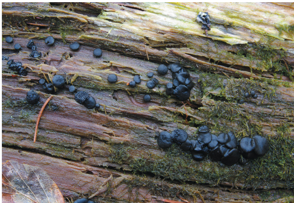
Fig. 11. Bulgariella pulla , BP1d, 19 November 2013, PRM 922869.