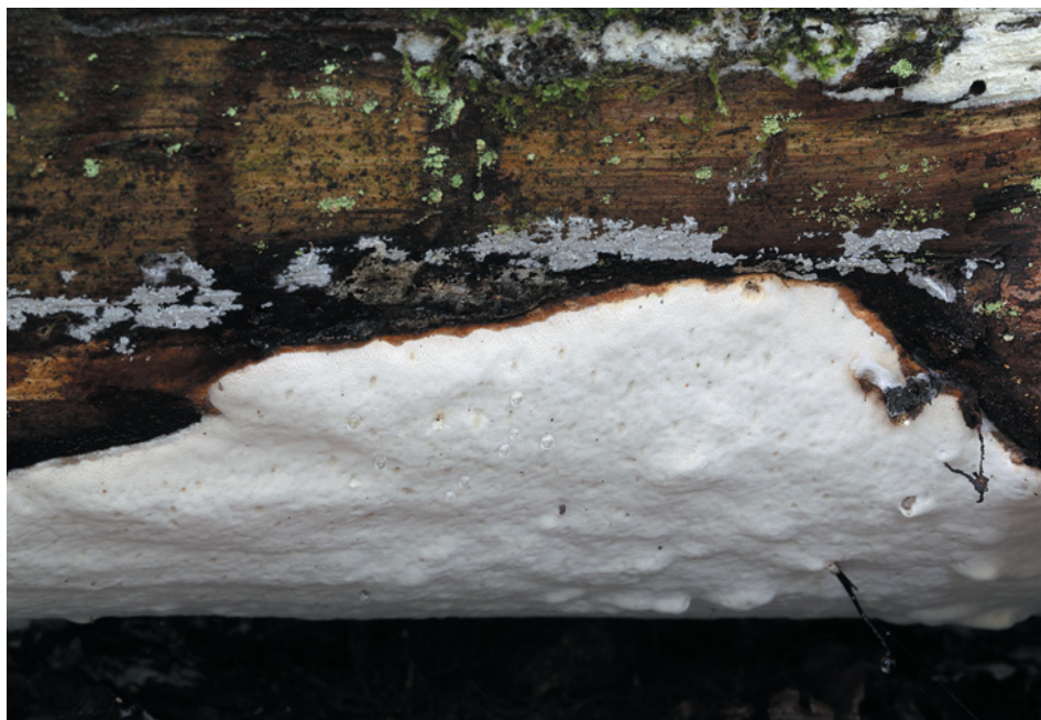
Fig. 7. Antrodia sitchensis , BP2c, 12 September 2013, PRM 923234.