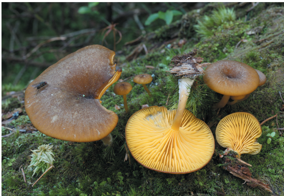
Fig. 17. Chrysomphalina chrysophylla , BP1a, 18 July 2013, PRM 922457.