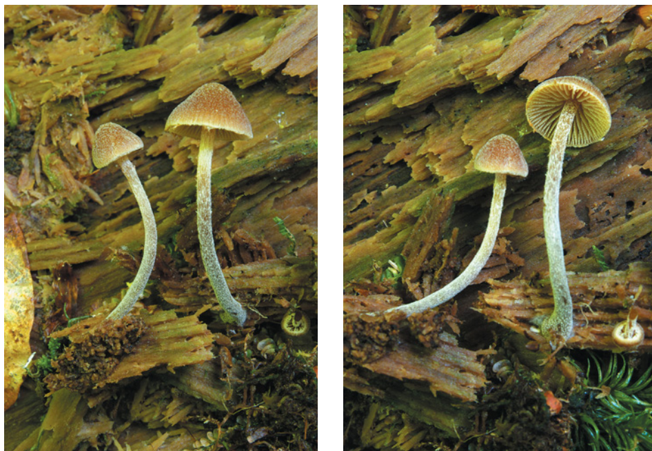
Fig. 15. Galerina pruinatipes , BP1d, 5 September 2013, PRM 922948.