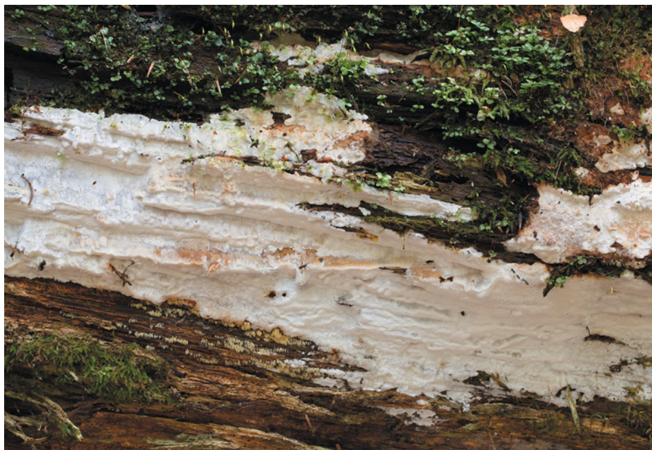
Fig. 9. Skeletocutis stellae , BP2a, 9 October 2013, PRM 923239.