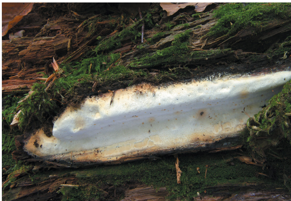
Fig. 8. Antrodia crassa , BP1d, 9 October 2013, PRM 923105.