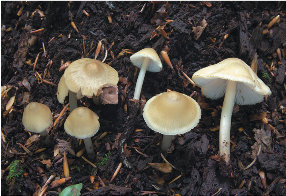
Fig. 25. Mycena romagnesiana , BP8d, 24 August 2013, PRM 922866. Photo J. Holec.