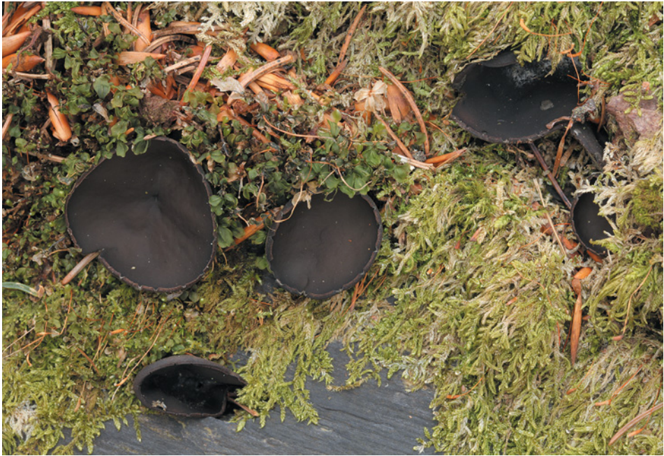
Fig. 21. Pseudoplectania melaena , BP2a, 25 April 2013, not documented by voucher.