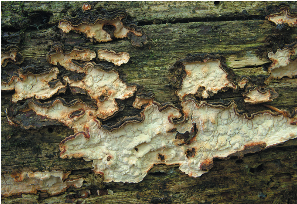
Fig. 6. Laurilia sulcata , BP8d, 24 August 2013, PRM 922868.