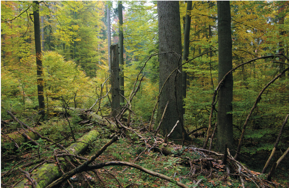
Fig. 3. Virgin forest in core area (BP1d) composed of Picea abies , Fagus sylvatica and Abies alba .