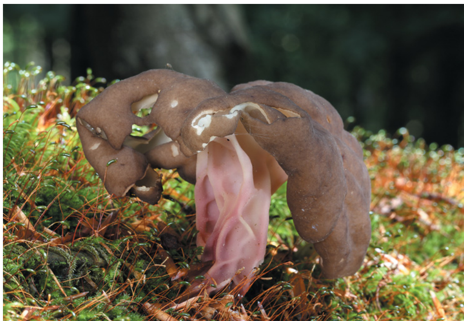
Fig. 12. Pseudorhizina sphaerospora , BP8b, 11 June 2013, not documented by voucher.