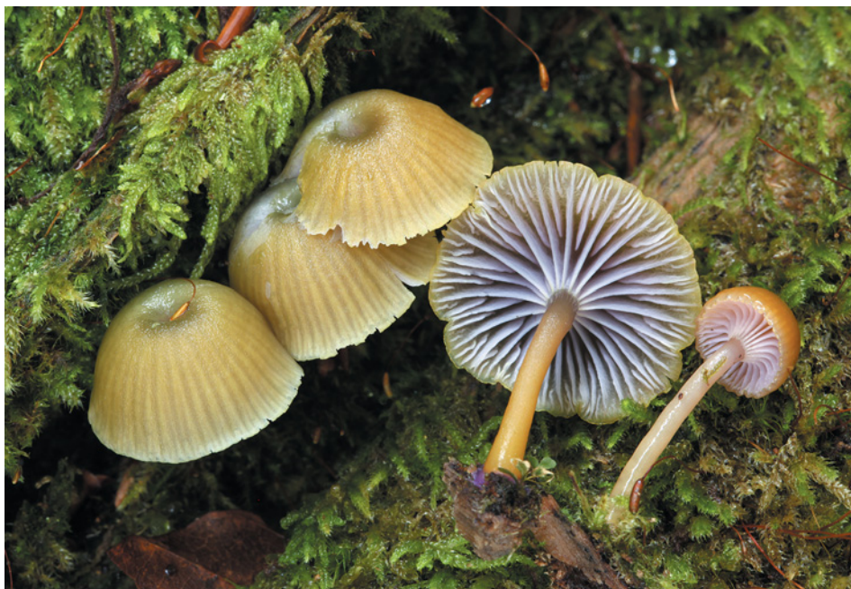
Fig. 19. Chromosera cyanophylla , BP1d, 26 August 2013, not documented by voucher.