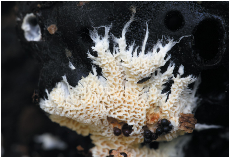
Fig. 14. Junghuhnia fimbriatella , BP2c, 9 October 2013, PRM 923240.