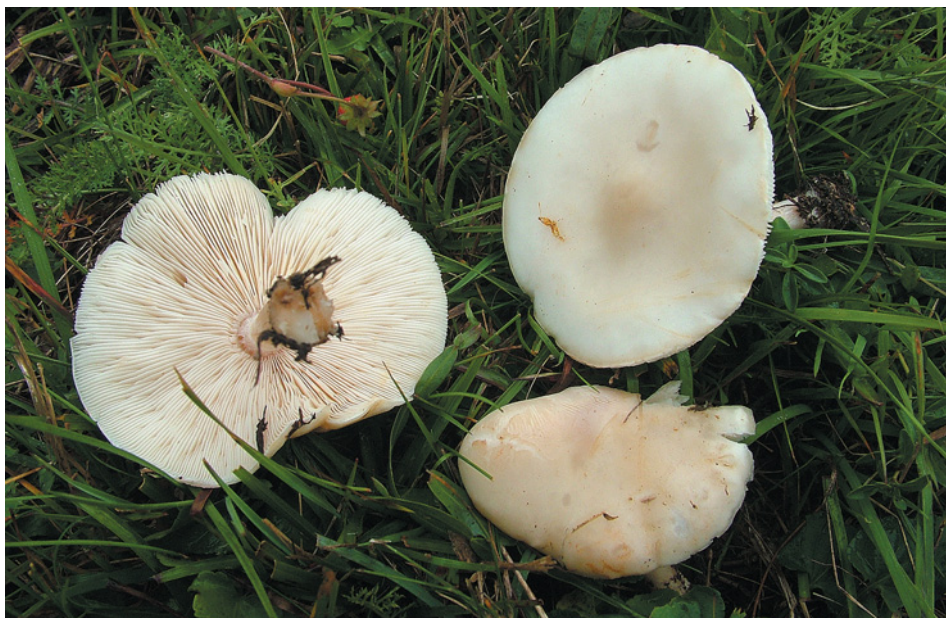
Fig. 3. Melanoleuca strictipes , Someșu Rece, Gilăului Mts., Romania, 4 Oct. 2014 (SLO 1661).