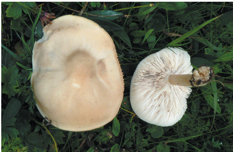
Fig. 5. Melanoleuca strictipes , Pianalunga near Alagna Valsesia, Monterosa, Italy, 27 Aug. 2014 (BRNM 781383).