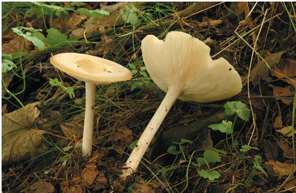
Fig. 2. Melanoleuca strictipes , Staré Hamry – Jamník, Moravskoslezské Beskydy Mts., Czech Republic, 24 July 2011 (BRNM 737301).