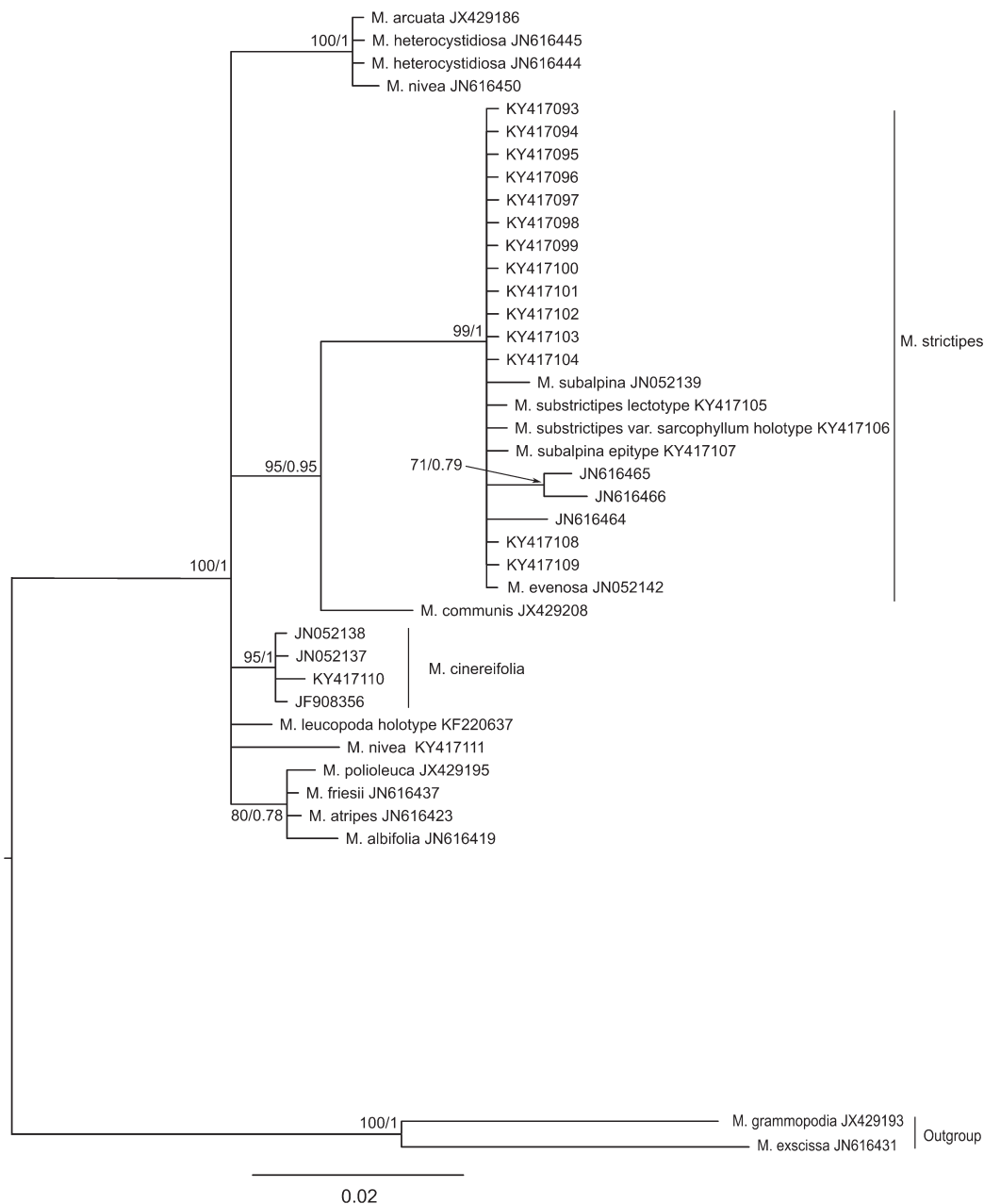
Fig. 1. Phylogenetic tree of Melanoleuca strictipes inferred from Bayesian analysis of ITS sequences. For legends to newly generated sequences, see Tab. 1. Support values (ML bootstrap support/Bayesian posterior probabilities) are given at the branches. The bar indicates the number of expected substitutions per position.