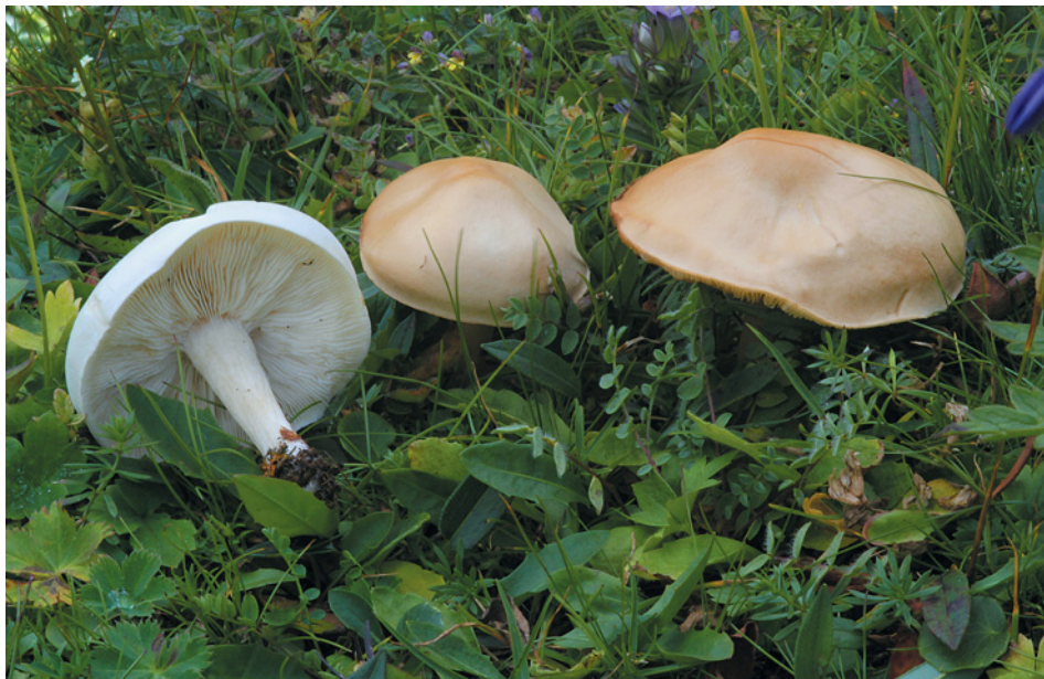
Fig. 4. Melanoleuca strictipes , Pianalunga near Alagna Valsesia, Monterosa, Italy, 27 Aug. 2014 (BRNM 781383).