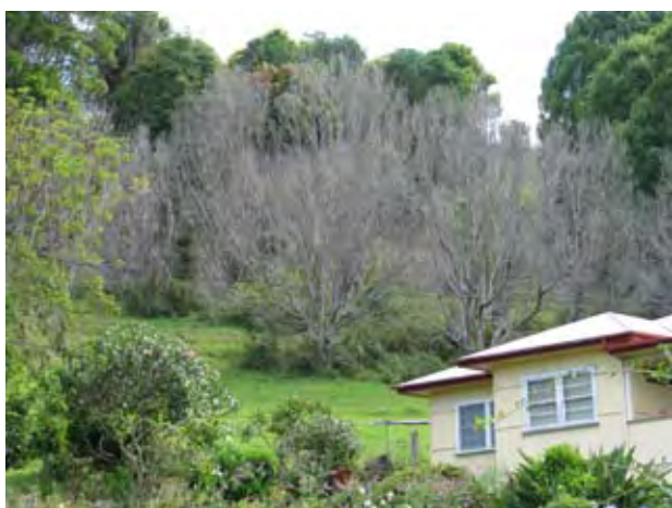
Figure 7. Mature camphor laurel trees following death from stem injection with herbicide. Trees can be removed (or left in place where there is no safety risk) and the area replanted with native species. Rod Ensby.

Chemical control is an effective way of controlling existing infestations. Herbicides can control trees without the need to disturb soil or other vegetation.