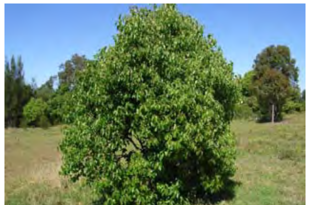
Figure 2. Young camphor laurel tree. George Wisemantel.

Camphor laurel is an evergreen tree which grows up to 20 m in height (see Figure 1 and 2). It has a large, spreading canopy and a short, stout bole or trunk up to 1.5 m in diameter.