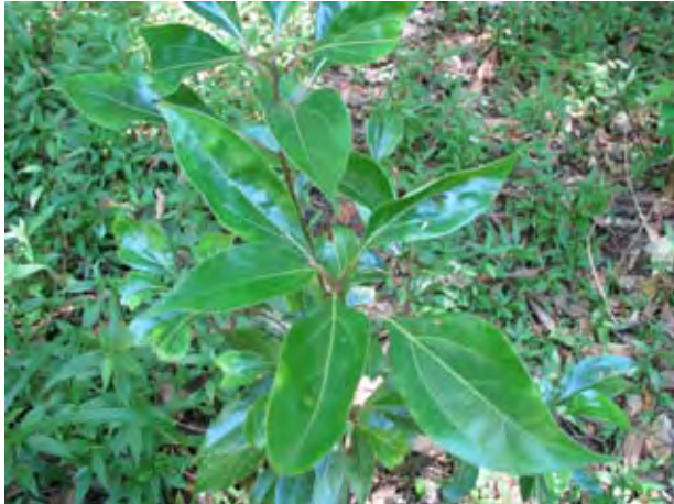
Figure 5. Camphor laurel seedling. Rod Ensbey.

Camphor laurel starts flowering after approximately seven years, depending on location (see Figure 6). Flowering occurs in spring.