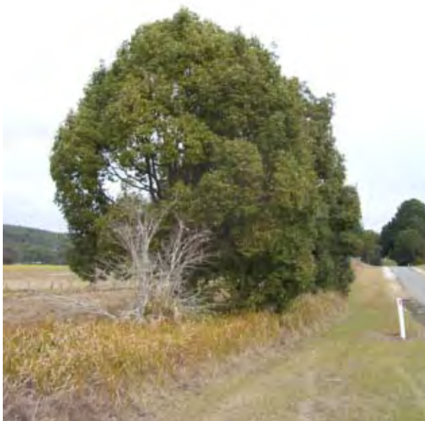
Figure 1. Camphor laurel invading roadsides. Reece Luxton.

Since the seventeenth century, camphor laurel has been used commercially for its timber and essential oils in China and Japan. It is still used in South-East Asia for interior softwood timber. There is a small camphor laurel timber industry on the north coast, although good specimen trees are not common.