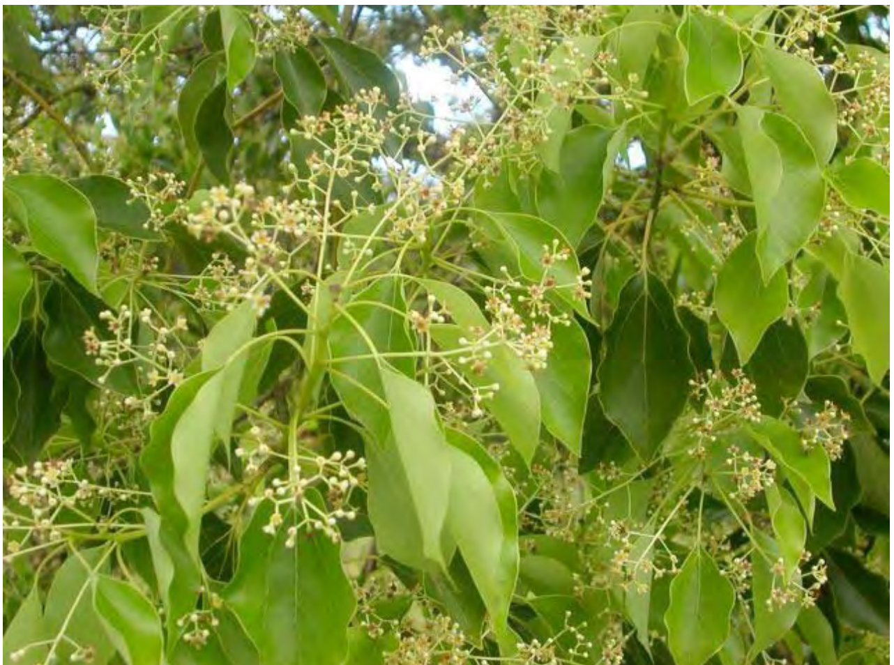
Figure 6. Camphor laurel tree in flower. George Wisemantel.

A number of techniques are available to control camphor laurel. The technique used will depend on the situation, landscape, number of trees to control and resources available. It is important to plan your control program and take a long-term approach