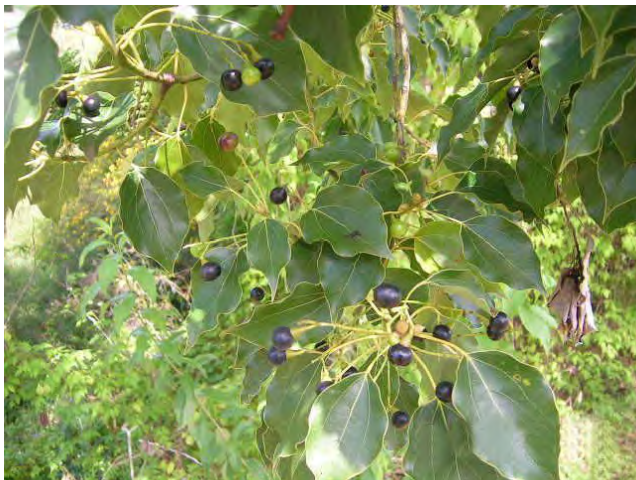
Figure 3. Camphor laurel fruit and leaf structure. George Wisemantel.

Camphor laurels are spreading further up catchments and hillsides, and westward into drier areas with poorer soils.