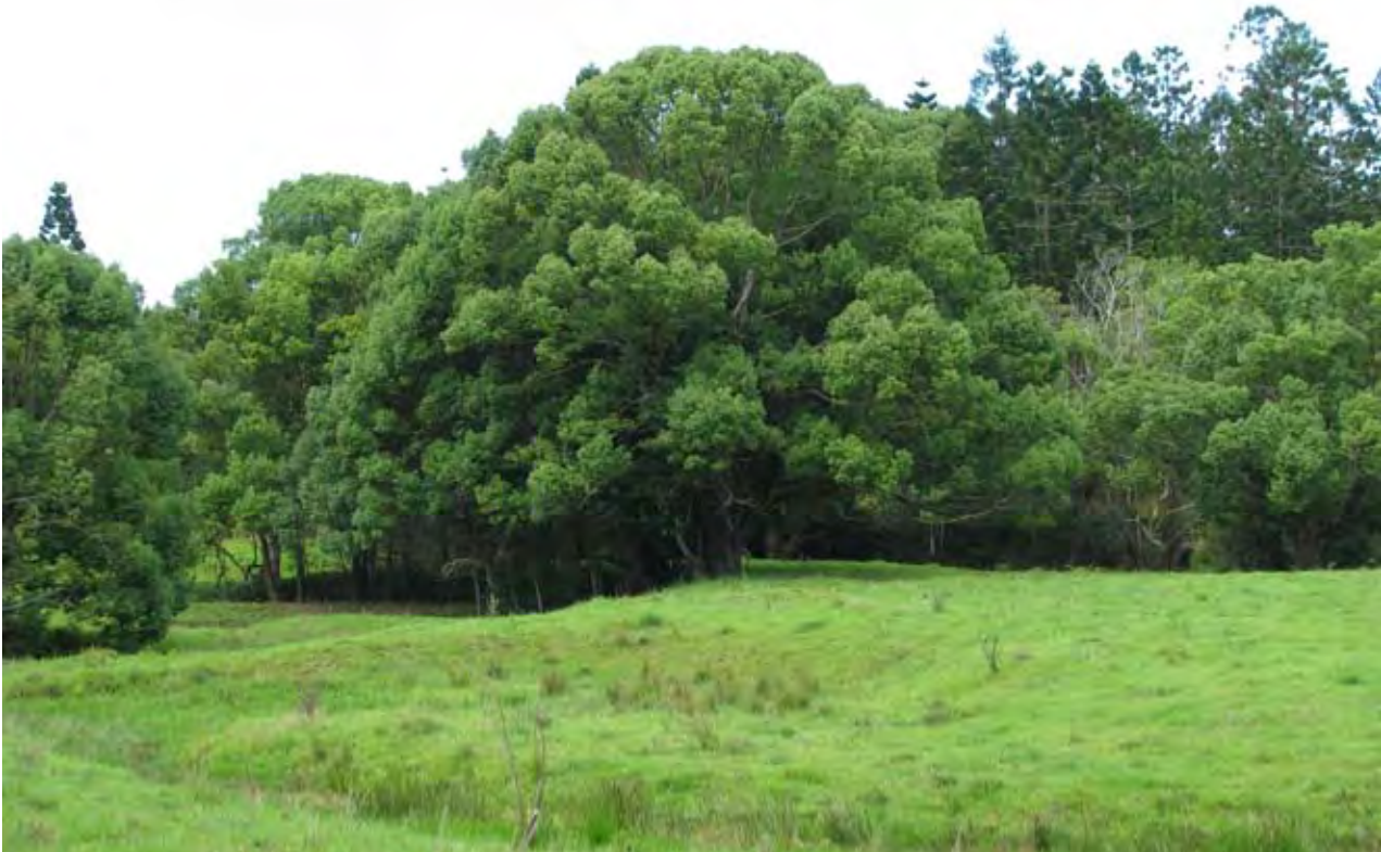
Figure 4. Camphor laurel invading agricultural land. Rod Ensbey

Seeds germinate more readily after ingestion by birds. It is thought that the fruit contains a germination inhibitor to delay germination until seeds are separated from the fruit. Viability is usually at least 70 per cent in the first year, decreasing rapidly in the second year. Some seeds remain viable for 3 years. Germination extends over a period of 4 to 20 weeks. This adaptation ensures the spread of viable seeds over time, leading to favourable weather conditions for germination.