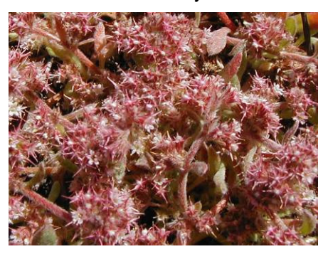
Chorizanthe angustifolia SPINEFLOWER