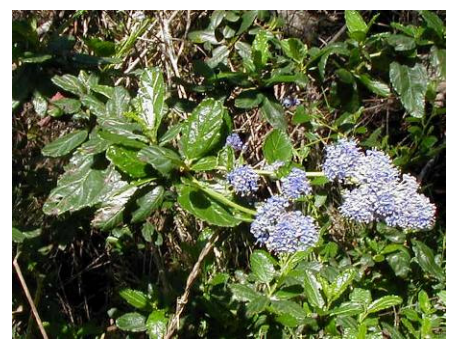
Ceanothus griseus CARMEL CEANOTHUS

Habitat: Found locally in maritime chaparral or Bishop pine forests.