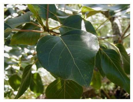
Populus balsamifera trichocarpa