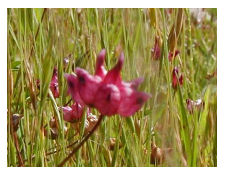
Trifolium depauperatum var. truncatum