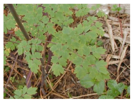
Thalictrum fenderli MEADOW RUE

Habitat: Riparian areas, moist shaded slopes.