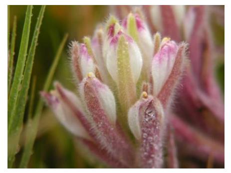
Cordylanthus maritimus maritimus