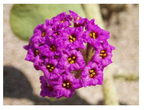
Abronia maritima SAND VERBENA

Status: 4/None/None Habitat: Sand dunes.