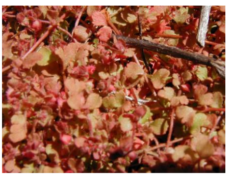
Pterostegia drymariodes PTEROSTEGIA