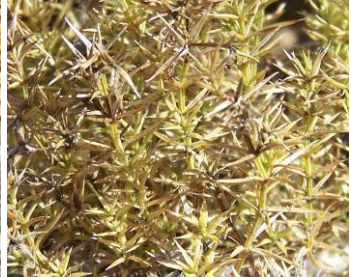
Galium andrewsii andrewsii