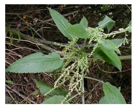
Urtica dioica ssp. holosericea