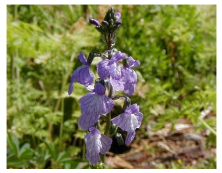
Linaria canadensis BLUE TOAD-FLAX

Notes: This rare species, according to Hoover, was once found all over the shores of Morro Bay. Today, it has been found only in small patches on the Sandspit, Audubon Sweet Springs Preserve, and Shark's Inlet. In 2005 a survey found only four populations. This plant is similar to a paintbrush, except the tip of the flower beak is closed. Leaves and bracts may be hairy and are often coated with salt. (MDO)