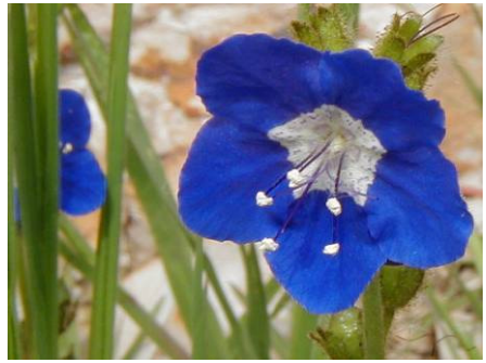
Phacelia viscida STICKY PHACELIA

Habitat: Coastal scrub, chaparral, shale soils.