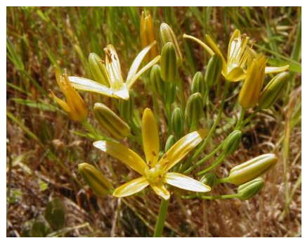
Bloomeria crocea COMMON GOLDENSTAR