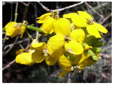
Erysimum insulare suffrutescens