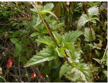
Scrophularia californica californica FIGWORT

Habitat: Riparian areas, coastal scrub, chaparral, roadsides.