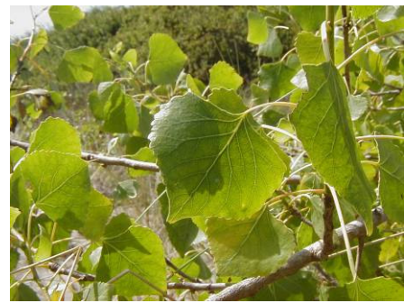
Populus fremontii fremontii FREMONT COTTONWOOD