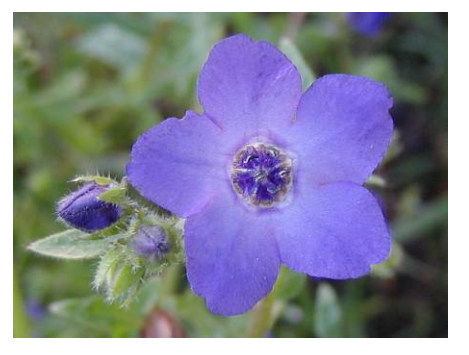
Pholistoma auritum var. auritum