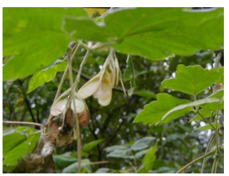
Acer negundo var. californicum