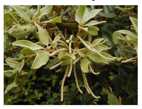
Garrya elliptica SILK TASSEL

Habitat: Found locally in chaparral and wooded or riparian areas.