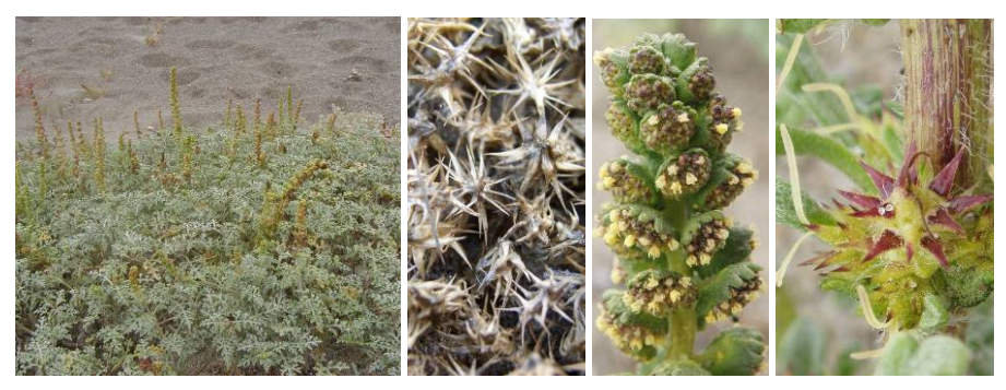
Ambrosia chamissonis BEACH-BUR