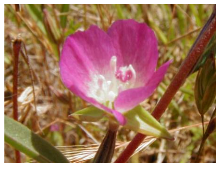
Clarkia purpurea quadrivulnera FOUR-SPOT