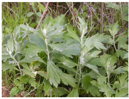
Artemisia douglasiana MUGWORT

Habitat: Open to shaded, moist regions, often found in riparian zones.