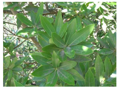
Umbellaria californica CALIFORNIA BAY LAUREL

Habitat: Riparian areas, steep canyons, seeps.