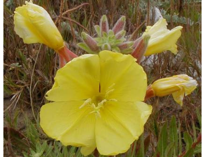
Oenothera elata hookeri EVENING PRIMROSE