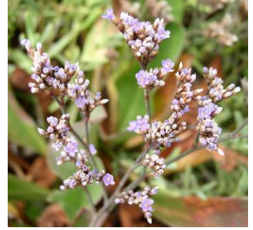
Limonium californicum SEA LAVENDER