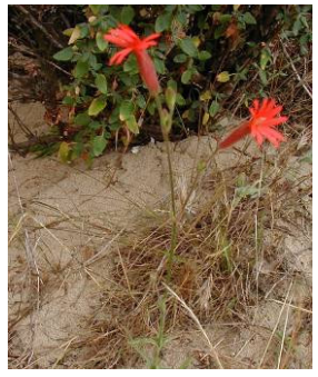
Silene laciniata major