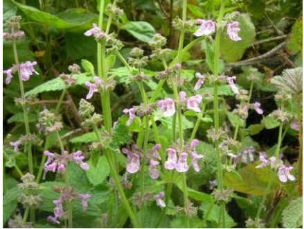
Stachys bullata HEDGE-NETTLE

Habitat: Oak woodland, shaded coastal scrub, chaparral.