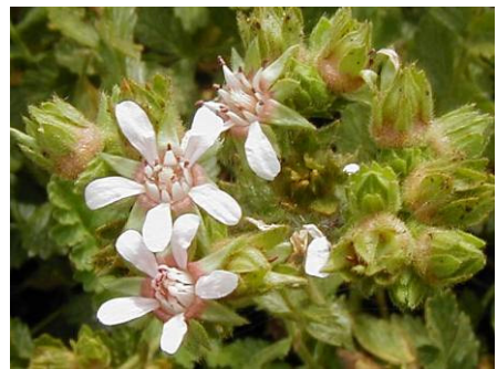
Horkelia cuneata HORKELIA

Habitat: Open areas in old sand dunes, coastal scrub, chaparral.