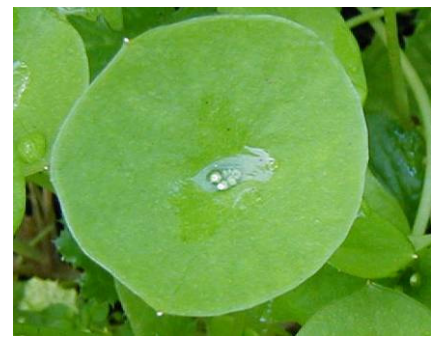
Claytonia perfoliata MINER'S LETTUCE

Habitat: Oak woodlands, moist shaded areas in most habitats.