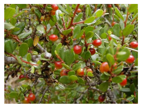
Rhamnus crocea SPINY REDBERRY

Habitat: Coastal scrub, chaparral, oak woodlands.