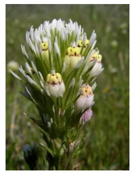
Castilleja densiflora obispoensis