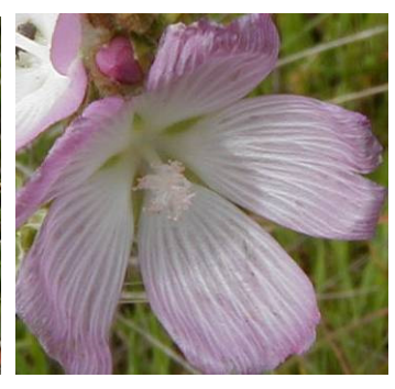
Sidalcea malviflora CHECKERBLOOM

Habitat: Open dry areas, mostly grasslands, road sides.