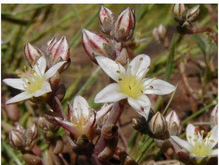
Dudleya blochmaniae blochmaniae