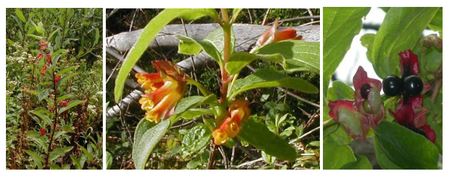
Lonicera involucrata var. ledebourii