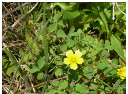
Oxalis albicans pilosa