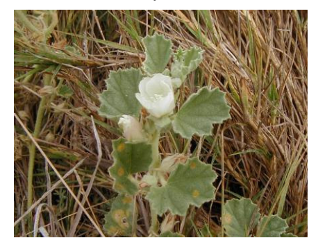
Malvella leprosa ALKALI MALLOW

Habitat: Moist alkaline soils, lagoon mouths or salt marshes.