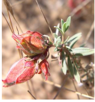
Epilobium canum canum CALIFORNIA FUSCHIA