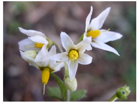
Solanum douglasii NIGHTSHADE

Habitat: Coastal scrub, chaparral, back-dunes, oak woodlands.