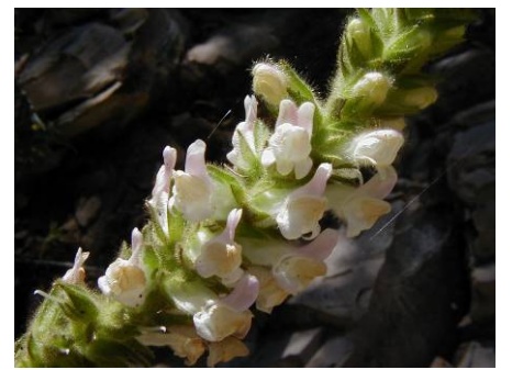
Antirrbinum multiflorum SNAPDRAGON

Habitat: Rocky outcrops, disturbed areas.