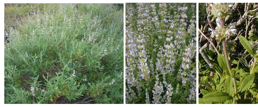
Salvia mellifera BLACK SAGE

Notes: As with all Salvia spp., the flower petals are lobed and there are four-paired seeds (nutlets) per flower. This small annual can be seen in great abundance in years of good rain. This is an annual sage that has dense blue flowers arranged in a terminal cluster. Leaves are basal, textured, and deeply lobed. (MBSP, MDO)