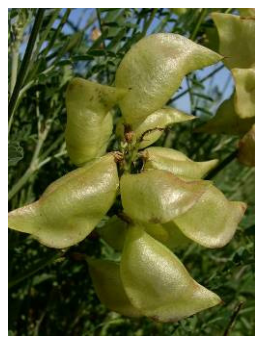
Astragalus nuttallii var. nuttallii