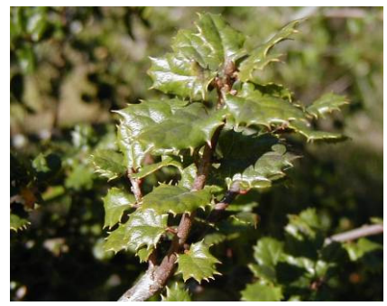
Quercus wislizeni var. frutescens