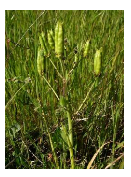
Zigadenus fremontii DEATH CAMAS

Habitat: Grasslands, rocky outcrops, oak woodlands