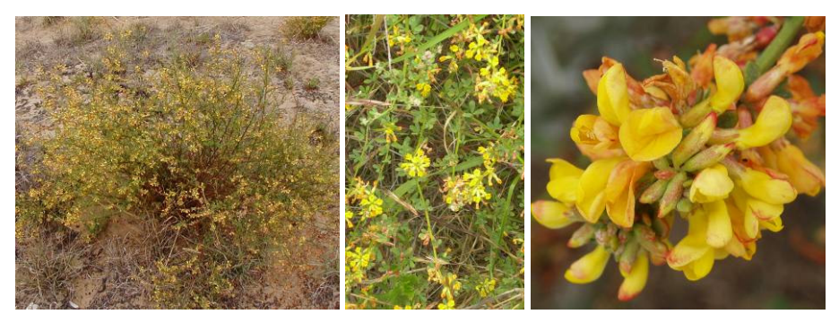
Lotus scoparius var. scoparius

Notes: A very common mat-forming plant in open and sandy areas. Overall, this species is very hairy compared to L. scoparius . (EB, LOOR, MBSP, MDO, MSSB)