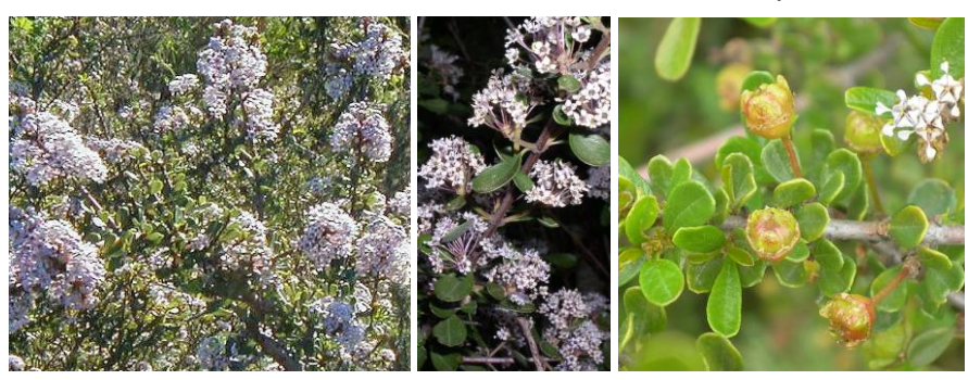
Ceanothus cuneatus BUCKBRUSH

Habitat: Coastal dune scrub, chaparral, rocky dry slopes.