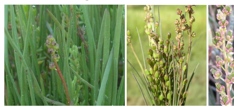
Triglochin concinna ARROW-GRASS

Habitat: Salt marsh, alkaline areas, mudflats.