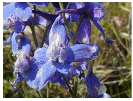
Delphinium parryi LARKSPUR