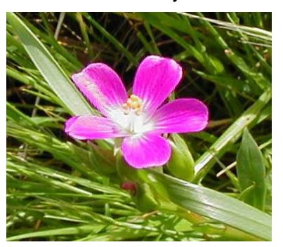
Calandrinia ciliata RED MAIDS