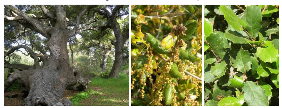
Quercus agrifolia var. agrifolia