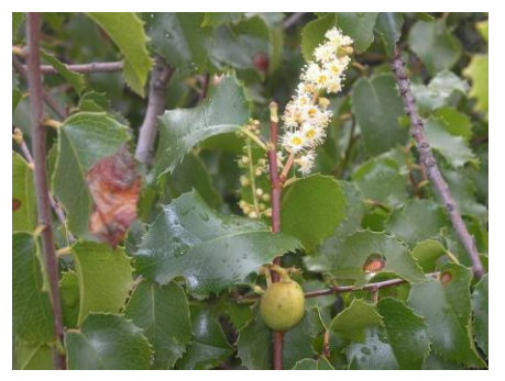
Prunus ilicifolia ilicifolia ISLAY BERRY

Habitat: Canyons, slopes, chaparral, ecotone between coastal scrub and oak woodland.