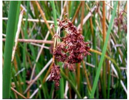
Scirpus acutus var. occidentalis