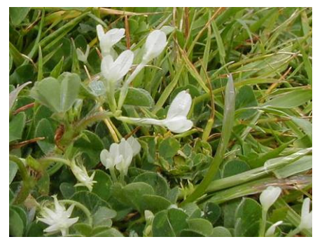
Trifolium monanthum var. monanthum