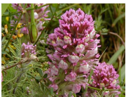
Castilleja exserta exserta