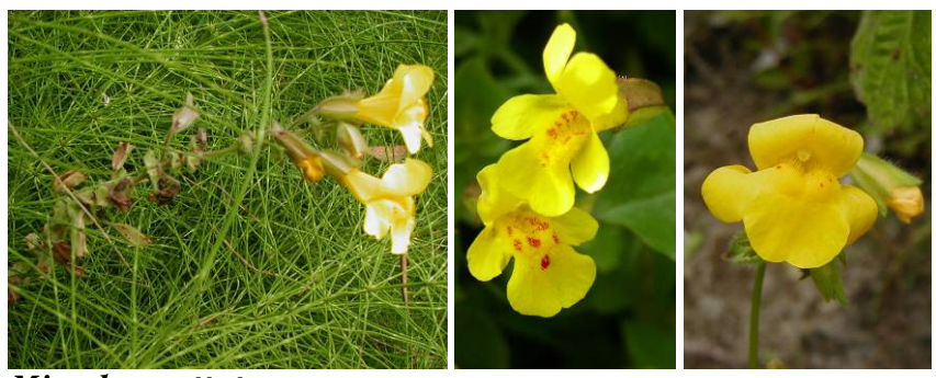
Mimulus guttatus MONKEYFLOWER