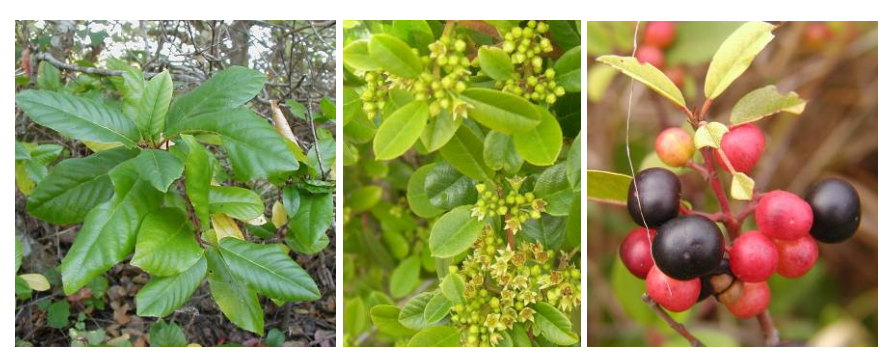
Rhamnus californica californica

Notes: A common shrub in riparian areas of MDO. The leaves are evergreen and are much larger than, and not nearly as tough as, those of C. cuneatus . Dense clusters of deep blue flowers. More common in northern California.