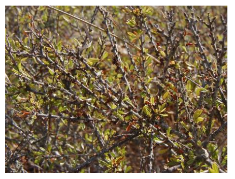
Prunus fasciculata var. punctata