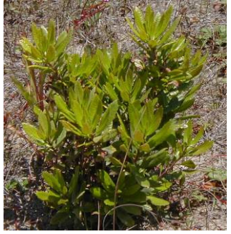
Myrica californica WAX MYRTLE

Habitat: Moist areas in most habitats, including sand dunes, coastal scrub, riparian areas, and oak woodlands.