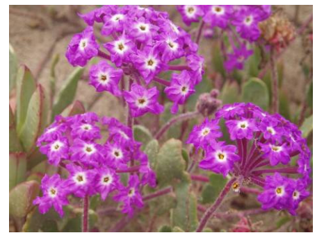
Abronia umbellata SAND VERBENA

Habitat: Sandy areas, old stabilized dunes.