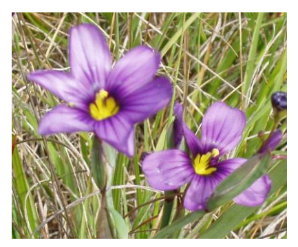
Sisyrinchium bellum BLUE-EYED GRASS

Habitat: Grasslands, open areas in oak woodlands, especially in moist soils.