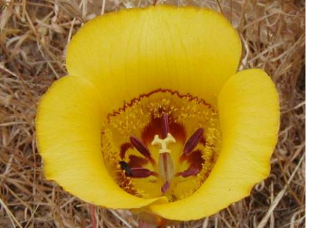
Calochortus clavatus clavatus