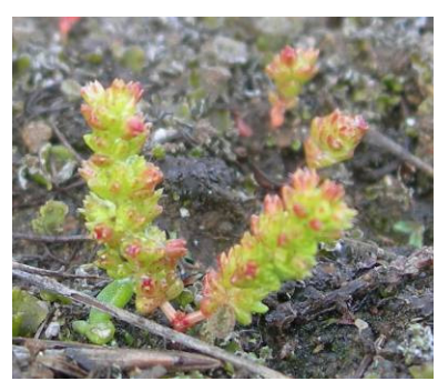
Crassula connata PYGMY-WEED

Habitat: Open areas in rocky outcrops and sandy locations.