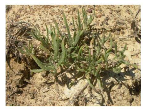
Spergularia macrotheca var. macrotheca

Notes: A perennial with long thin stems and conspicuous bright red flowers. This species is separated from another closely related species, S. californica , by having slender leaves throughout. (LOOR, MBSP, MDO)