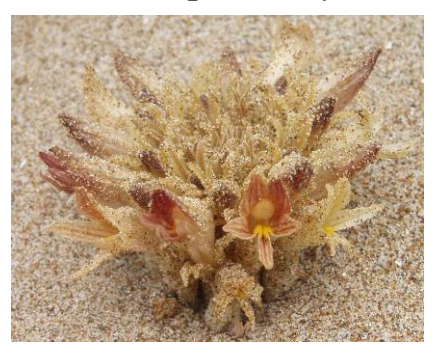
Orobanche fasciculata CLUSTERED BROOM-RAPE

Habitat: In open sand as a root parasite, most often on Artemisia spp., Eriodictyon spp., and Eriogonum spp.