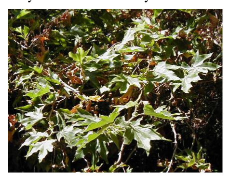
Platanus racemosa WESTERN SYCAMORE