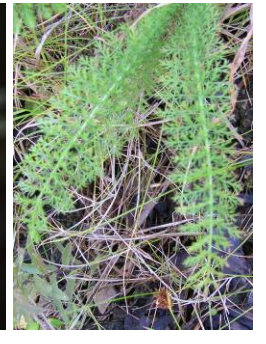
Achillea millefolium COMMON YARROW

Habitat: Diverse habitats, from sand dunes to open chaparral