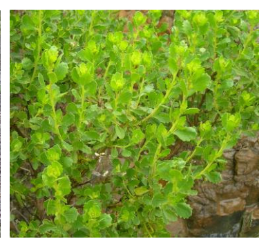
Baccharis pilularis COYOTEBUSH

Habitat: Coastal bluffs, oak woodlands, grassland communities.