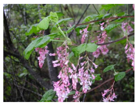
Ribes malvaceum var. viridifolium CHAPARRAL CURRANT