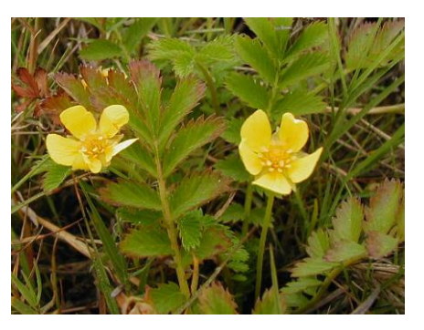
Potentilla anserina pacifica CINQUEFOIL

Habitat: Edges of freshwater marshes, moist areas, coastal sand dune swales.