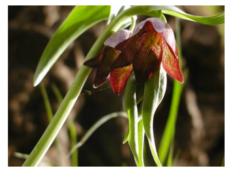
Fritillaria biflora CHOCOLATE LILY