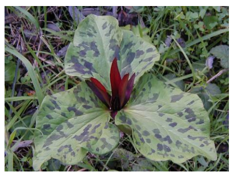
Trillium angustipetalum WAKEROBIN

Habitat: Locally in moist deeply shaded canyons.