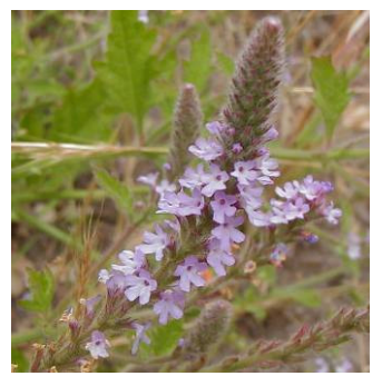
Verbena lasiostachys var. lasiostachys VERVAIN