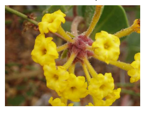
Abronia latifolia SAND VERBENA