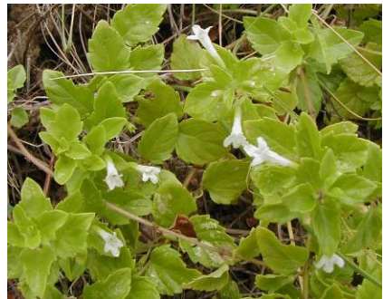
Satureja douglasii YERBA BUENA

Habitat: Oak woodland, chaparral, coastal scrub