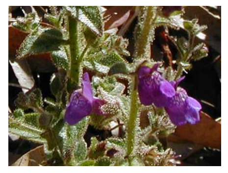
Antirrhinum nuttallianum subsessile SNAPDRAGON

Habitat: Coastal dunes and rocky outcrops. Locally rare on volcanic rocks near the coast.