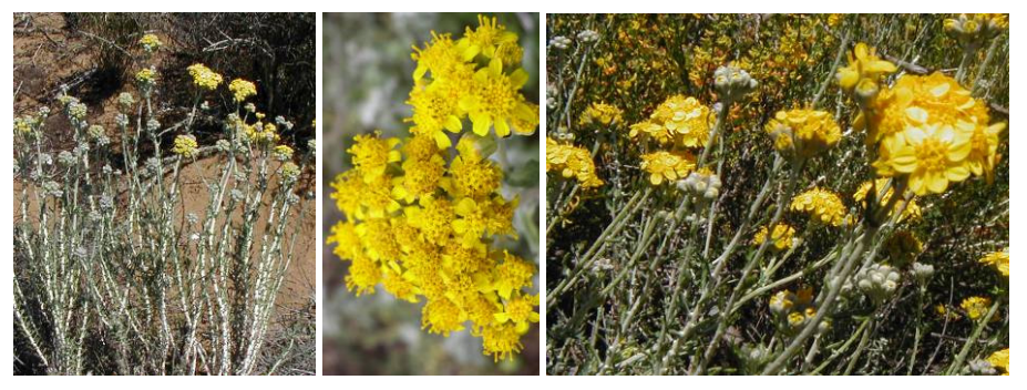
Eriophyllum confertiflorum GOLDEN YARROW

Habitat: Can be found from stabilized dunes to mature chaparral.