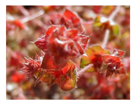
Mucronea californica CALIFORNIA SPINEFLOWER