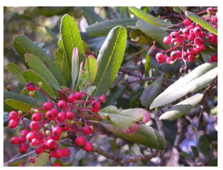
Heteromeles arbutifolia TOYON