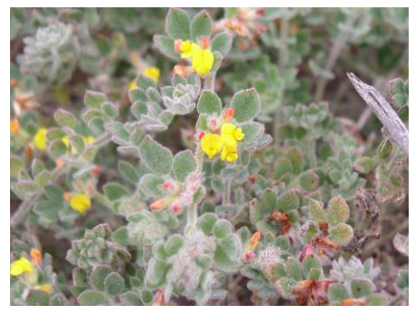
Lotus beermannii var. orbicularis