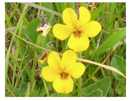
Viola pedunculata JOHNNY JUMP-UPS