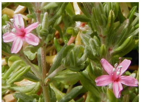
Frankenia salina FRANKENIA