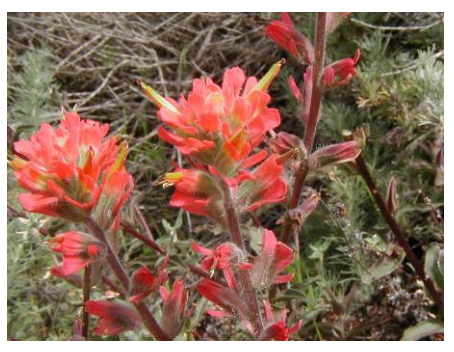
Castilleja affinis affinis INDIAN PAINTBRUSH

Habitat: Chaparral and coastal scrub, often on rocky soils.