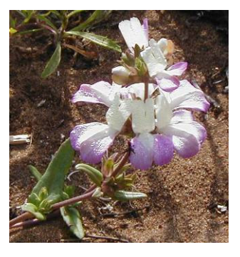
Collinsia beterophylla CHINESE HOUSES

Habitat: Diverse habitats including open areas in Baywood fine sand coastal scrub.