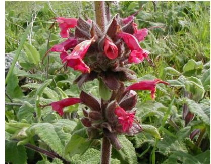
Salvia spathacea HUMMINGBIRD SAGE

Habitat: Oak woodland, coastal scrub, chaparral, open or shady areas.