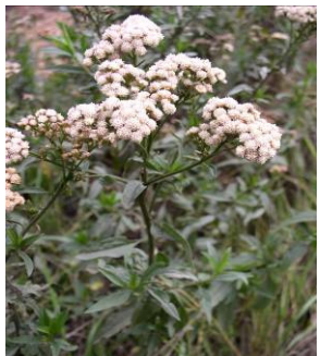
Baccharis douglasii MARSH BACCHARIS