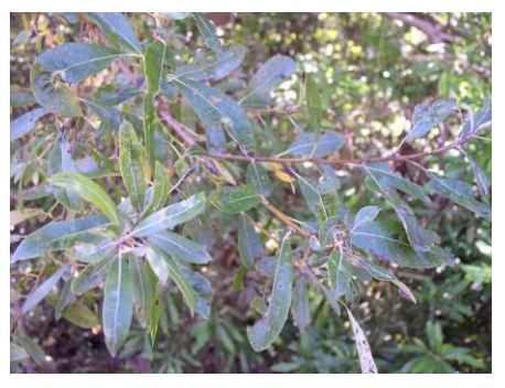
Salix lasiolepis ARROYO WILLOW