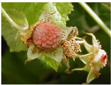
Rubus parviflorus THIMBLEBERRY