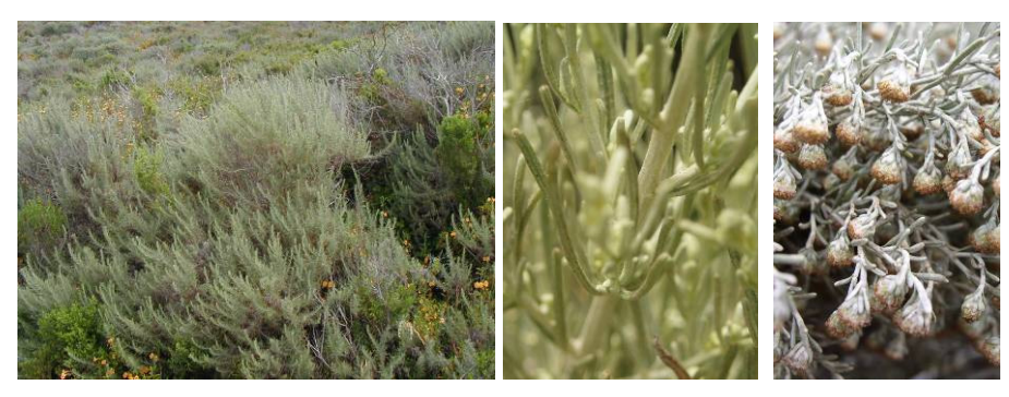
Artemisia californica CALIFORNIA SAGEBRUSH

Notes: A matting plant, perfect for dune stabilization. In its fruiting stage, this species forms sharp burs used for seed dispersal. The flower stalks are brown and not very showy and male and female flowers are separate on same inflorescence. The photographs above show the plant, seeds, female flower and male flower (male and female were on same inflorescence). Seeds are armored, flowers are not. (EB, MSSB, MDO, MBSP)