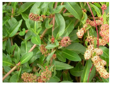
Rumex salicifolia var. crassus