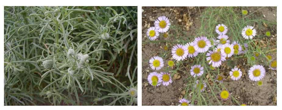
Erigeron blochmaniae BLOCHMAN'S LEAFY DAISY

Notes: A common component of the dune communities in and around Morro Bay, this low growing shrub is easy to identify. The stem is white pubescent and the leaves are reduced, grooved, crowded, and often appearing as a fan shaped fascicle. (MBSP, MSSB, MDO, LOOR)