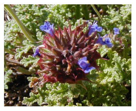
Salvia columbariae CHIA

Habitat: Chaparral, coastal scrub, open sandy disturbed areas.