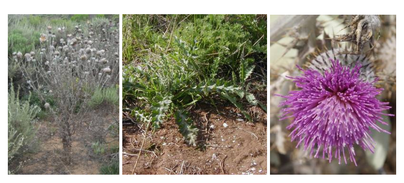
Circium occidentale var. occidentale

Notes: Purple flowers when in full bloom. Called a cobwebby thistle due to the cotton-like trichomes (hairs) in its flower head, this rare variation of the prototypical C. occidentale is only found on coastal bluffs and dunes. The rugged nature of this environment causes it to become compact and low growing, as in the center photograph. (HC)