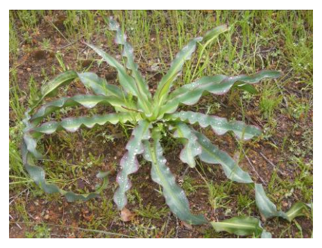
Chlorogalum pomeridianum SOAP PLANT

Habitat: Grasslands, coastal scrub, chaparral, coastal bluffs.