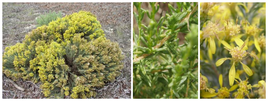
Ericameria ericoides MOCK HEATHER

Habitat: Stabilized sand dunes, inland sandy regions.