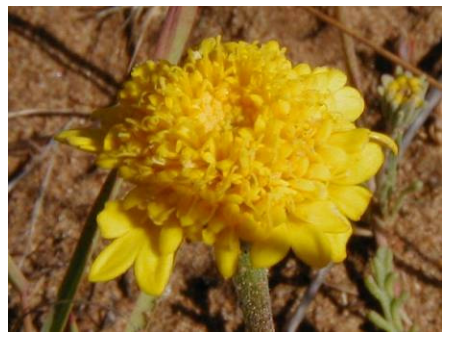
Chaenactis glabriuscula PINCUSHIONS

Habitat: Typically seen in dry places in dunes or other sandy areas.