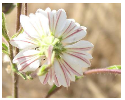
Hemizonia congesta luzulifolia