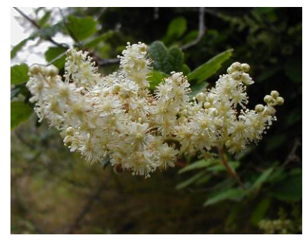
Holodiscus discolor OCEANSPRAY