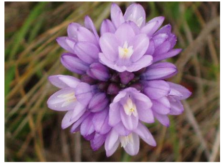
Dichelostemma capitatum capitatum BLUE-DICKS

Habitat: Grasslands, coastal scrub, chaparral, oak woodlands.