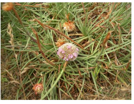
Armeria maritima californica