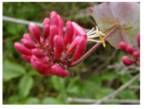
Lonicera bispidula var. vacillans