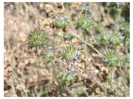
Navarretia squarrosa SKUNKWEED

Habitat: Chaparral, open disturbed areas.