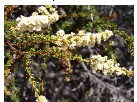
Adenostoma fasciculatum CHAMISE