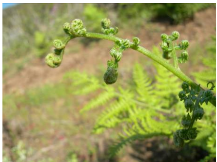
Pteridium aquilinum var. pubescens