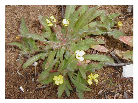
Camissonia micrantha SUN CUP

Habitat: Sandy areas, coastal sand dunes.