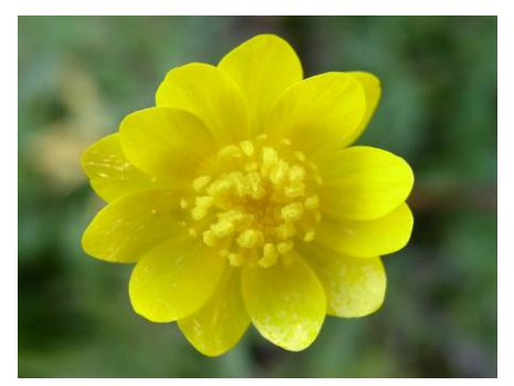
Ranunculus californicus CALIFORNIA BUTTERCUP