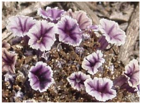
Pholisma arenarium SAND FOOD