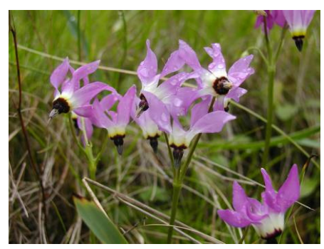
Dodecatheon spp. SHOOTING STAR