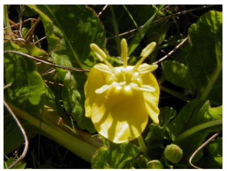
Camissonia ovata SUN CUP