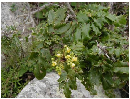
Berberis aquifolium var. dictyota