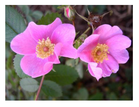
Rosa californica CALIFORNIA ROSE