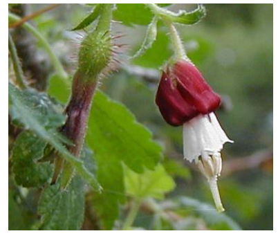
Ribes menziesii CANYON GOOSEBERRY

Habitat: Oak woodland understory, chaparral.