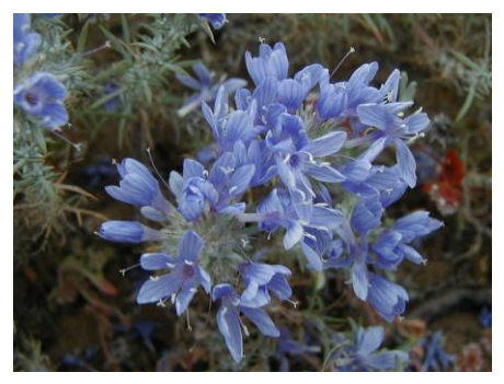
Eriastrum densifolium densifolium ERIASTRUM

Habitat: Locally found in coastal sand dunes.