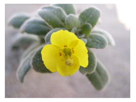
Camissonia cheiranthifolia cheiranthifolia