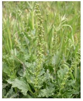
Chenopodium californicum CALIFORNIA GOOSEFOOT

Habitat: Coastal scrub, chaparral, generally open sandy areas.