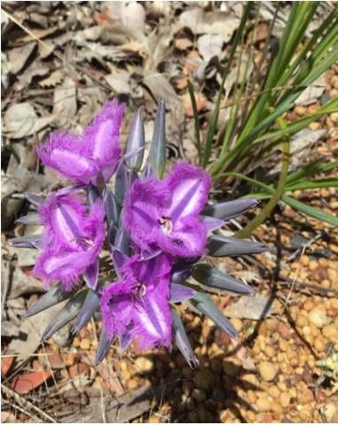
A Fringe Lily

When: Saturday, 27 April 2019, 12noon to 1:30pm