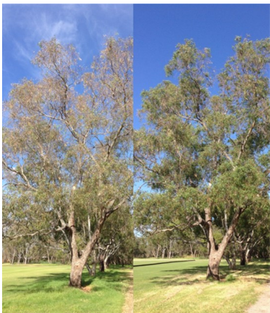
Photomonitoring of a Flooded Gum

When: Saturday, 15 June 2019, 09:00am to 11:30am