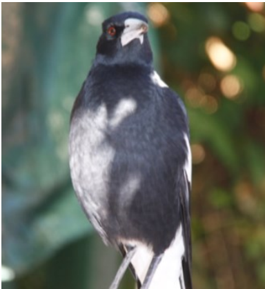
An Australian Magpie

When: Saturday, 18 May 2019, 10:00am to 12:30pm