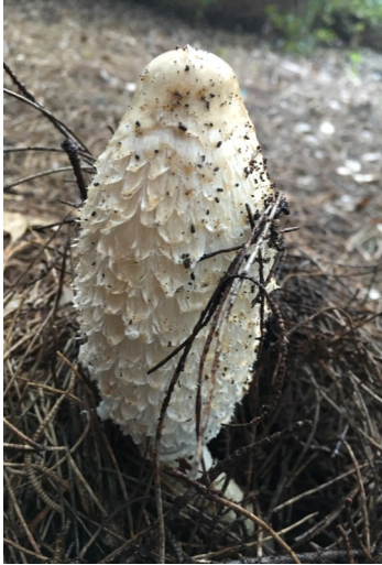
An emerging mushroom