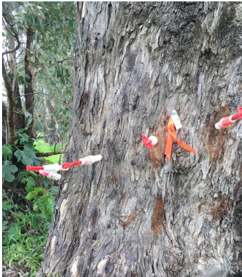
Trees with phosphite injectors