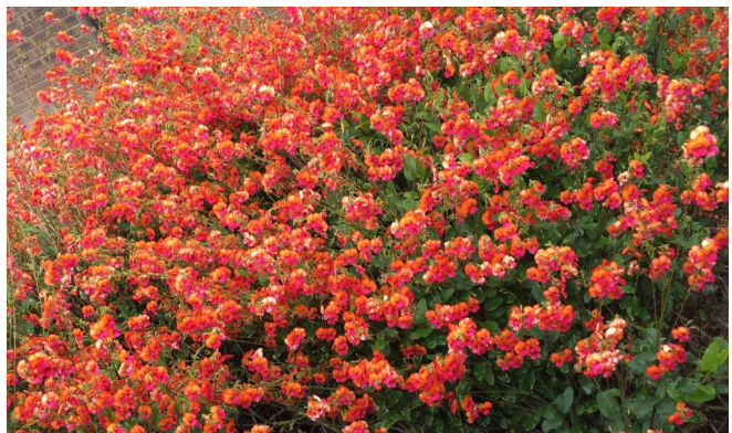
Top left: Lechenaultia biloba , Top right: Fungi, Bottom left: Acacia pulchella , Bottom right: Fabaceae .