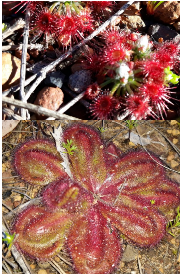
Two Sundew species found in the Perth Hills