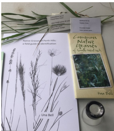
Una Bell's latest book, along with her booklet and a Wallaby Grass specimen