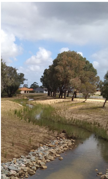
Revegetation works