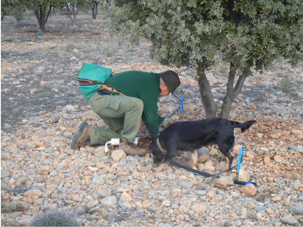
Fig. 1 - T. melanosporum plantation in Spain

unpublished data). T. melanosporum plantations have also been established in Israel, Argentina and in several European countries but to the best of our knowledge production has yet to begin.