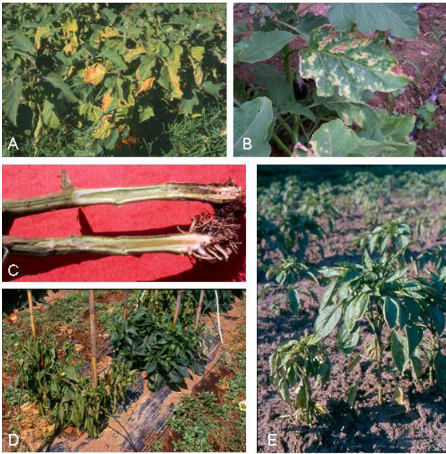
Fig. 4 Verticillium wilt of eggplant (A, B), tomato (C) and pepper (D, E) caused by the soil-borne fungus Verticillium dahliae . Symptoms consist of yellowing of foliage (A, B), varying degrees of vascular discoloration (C), wilt as a result of water stress (D) and stunting growth (E).