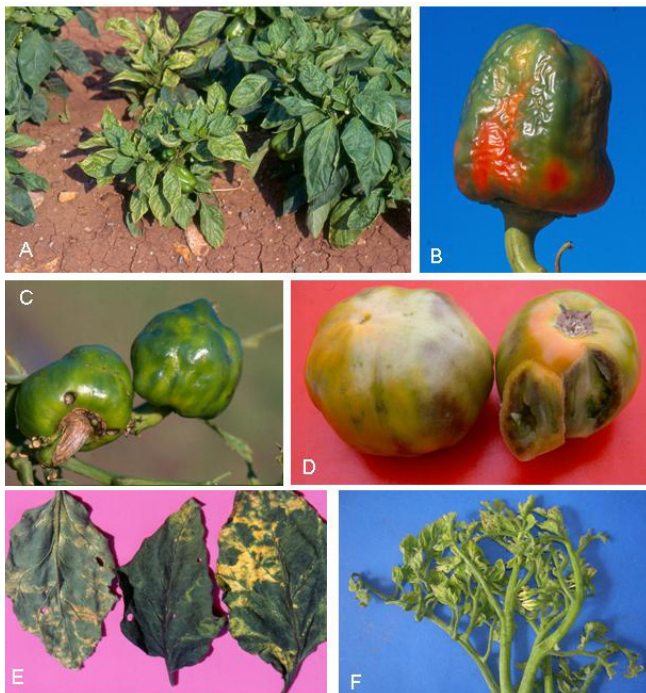
Fig. 9 Symptoms of TMV ( Tobacco mosaic virus ) infection in pepper leaves (A) and fruit (B). Symptoms of CMV ( Cucumber mosaic virus ) infection in pepper fruit (C), tomato fruit (D) and eggplant leaves (E). Symptoms of TYLCV ( Tomato yellow leaf curl virus ) infection in tomato leaves (F).

necrosis (two strains of the virus that are differentiated based on the symptoms they cause on tomato) have been found to cause losses in tomato crops (Panagopoulos 2000).