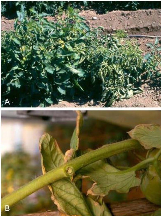
Fig. 6 (A) Bacterial canker of tomato caused by the bacterium Clavibacter michiganensis subsp. michiganensis . (B) Bacterial canker discoloration. (Photographs courtesy of Prof. E. C. Tjamos, Agricultural University of Athens, Greece).

spore-forming, Gram-positive bacterium. Cells may be pleomorphic in culture, but are rod-shaped when isolated from plants. Optimum growth occurs at 24-27°C. Reproduction is characterized by “snapping” division, resulting in V- and Y-shaped arrangements of the cells. Identification of the bacterium can be confirmed by classical and molecular diagnostic methods (Schaad et al. 2001; Janse 2005). C. michiganensis subsp. michiganensis is most important as a pathogen of tomato; however, it can infect other Solanaceous plants such as pepper, eggplant, Nicotiana glutinosa and other Solanum sp. The bacterium is mentioned in EPPO A2 quarantine lists (Janse 2005).