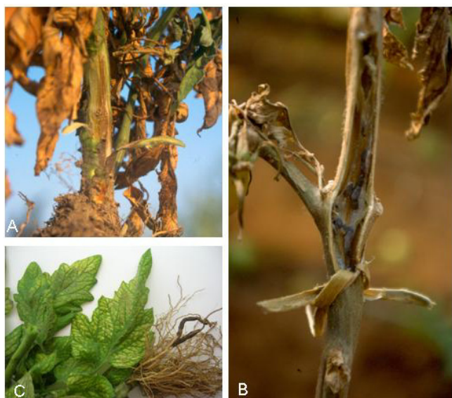
Fig. 5 (A) Fusarium wilt of tomato caused by the soil-borne fungus Fusarium oxysporum f.sp. lycopersici . (B) White mold of tomato caused by the soil-borne fungus Sclerotinia sclerotiorum . (C) Corky root rot of tomato caused by the soil-borne fungus Pyrenochaeta lycopersici .

Pythium spp. are spread by sporangia, each of which releases hundreds of zoospores. Zoospores that reach the plant root surface encyst, germinate and colonize the root tissue by producing hyphae. These hyphae release hydrolytic enzymes to destroy the root tissue and absorb nutrients. Pythium spp. survive in the soil as saprophytes and most are favored by wet soil conditions and cool temperatures (15-20°C) The irrigation system in greenhouses contributes to the fast development and spread of Pythium spp. They form oospores and chlamydozoospores on decaying plant roots which can survive prolonged adverse conditions and lead to subsequent infections.