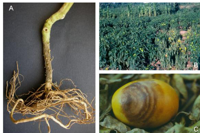
Fig. 3 Phytophthora root rot of tomato (A) caused by the oomycete Phytophthora parasitica and pepper (B) caused by the oomycete Phytophthora capsici (C). Tomato fruit rot caused by Phytophthora spp. (Photograph B courtesy of Prof. E. C. Tjamos, Agricultural University of Athens, Greece).

Phytophthora parasitica Dastur (= P. nicotianae var. parasitica ), P. cryptogea (Pethyb. and Laff.) and P. capsici Leonian are the main causal organisms of Phytophthora root rot. A root and crown rot extending to a considerable height above the soil level may occur (Fig. 3A). The infected area has water-soaked lesions with a dark discoloration, and the pith is usually destroyed. Infected tissues shrink and in humid weather a white mycelium develops. Infected plants wilt and die quickly (Fig. 3B). These pathogens can also infect tomato fruit and cause field and post-harvest fruit rots (Fig. 3C) (Stevenson 1991; Ristaino 2003).