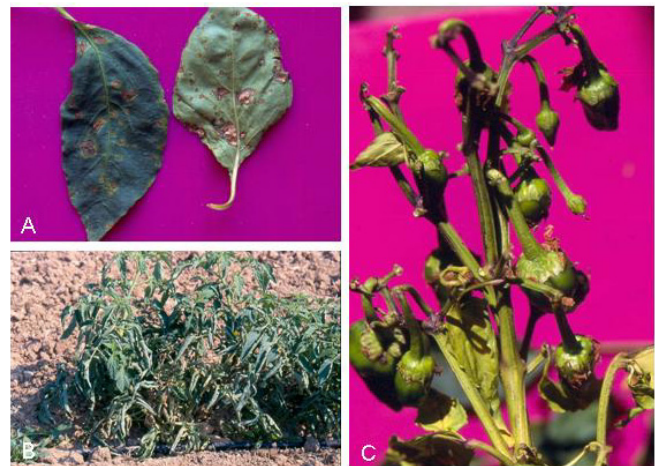
Fig. 8 (A) Bacterial spot of pepper caused by the bacterium Xanthomonas campestris pv. vesicatoria . (B) Bacterial wilt of tomato caused by the bacterium Ralstonia solanacearum . (C) Tomato big bud or Stolbur caused by a phytoplasma similar to those causing aster yellows. (Photographs courtesy of Prof. E. C. Tjamos, Agricultural University of Athens, Greece).

On leaves, stems and fruits, spots appear that are small (up to 5 cm), circular to irregular in shape, and have a