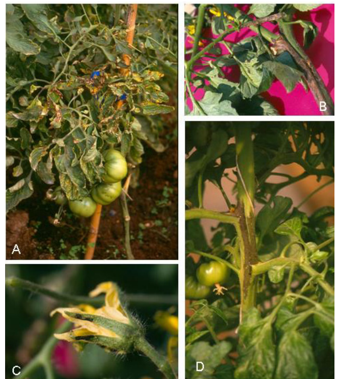
Fig. 7 Bacterial speck of tomato caused by the bacterium Pseudomonas syringae pv. tomato on leaves (A), stems (B, D) and sepals (C). (Photographs courtesy of Prof. E. C. Tjamos, Agricultural University of Athens, Greece).

The pathogen causes spots on stems (Fig. 7B, 7D), petioles, leaves (Fig. 7A), stalks, peduncles, sepals (Fig. 7C) and fruits. On leaflets, spots are round and dark brown to black (1-3 mm). The halo is lacking in the early stages but develops with time. The lesion extends throughout the entire leaf but is prominent on the abaxial surface. As the disease spreads spots coalesce in large areas of leaves (Fig. 7A). On fruits, minute dark lesions or specks might develop. The numerous specks that develop on young green fruit are slightly raised, rarely larger than 1 mm in diameter, and