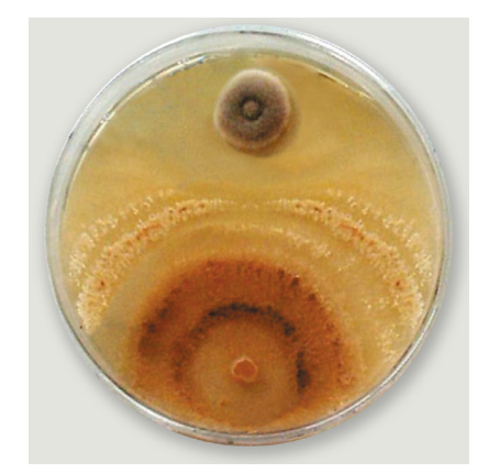
Fig. 1 Inhibition of mycelial growth of R. solani AG-2-1 by isolate XLT3S of P. restrictum in dual culture.

It is quite reasonable to assume that the occurrence of P. restrictum in soil is largely influenced by its competitiveness toward the other microbial components, as at least in part regulated by the bioactivity of the extrolites it may produce. To this regard, indications of an ability to possibly overcome fungistasis and antibiosis promoted by other microorganisms was inferred based on the tolerance toward the staling products released by fungi inhabiting lentil rhizosphere (Arora and Dwivedi 1976, 1979), while assays in dual cultures against Sporotrichum schenckii and Scopu lariopsis brevicaulis (Blunt and Baker 1968) first documented its ability to exert antibiosis toward soil fungi. Consistent inhibitory capacities were later showed against Gaeu mannomyces graminis var. tritici (Mekwatanakarn and Sivasithamparam 1987), although in a following assay car-