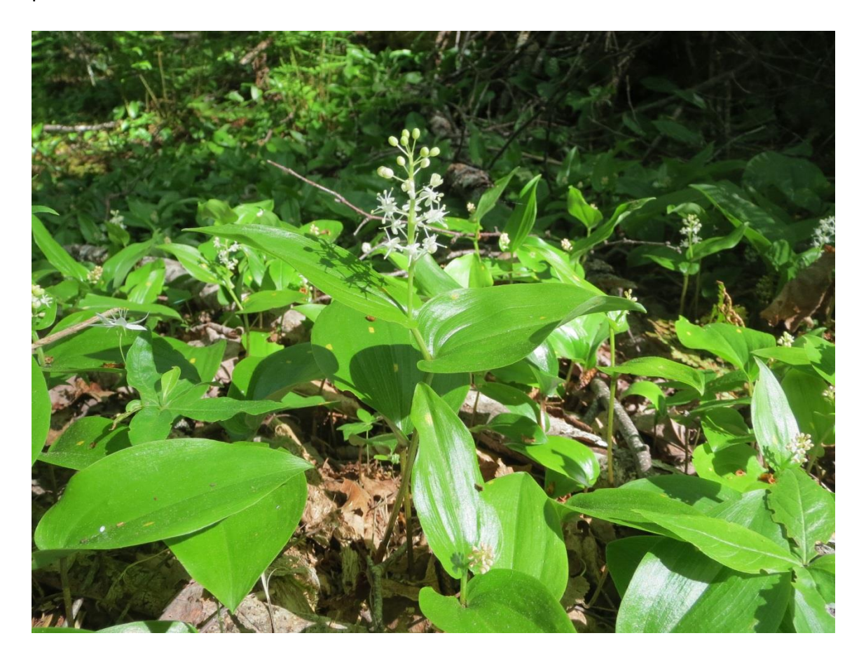
Figure 13: Wild Lily-of-the-valley ( Maianthemum canadense ) in Area E

Non-vascular species were identified as observed but were not the target of this study. This list is incomplete and does not represent the full diversity of of fungi, lichens and non-vascular plants in this area.