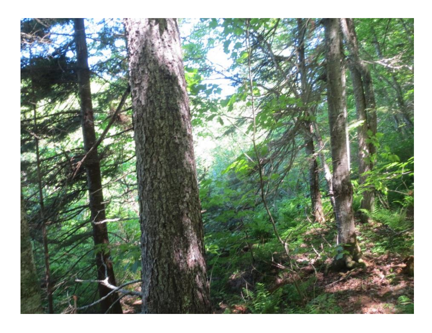
Figure 15: Large Eastern Hemlock ( Tsuga canadensis ) on steep slope in Area I east of West River