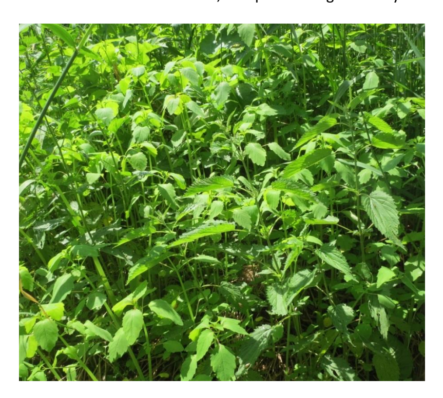
Figure 11: Stinging Nettle ( Urtica dioica ) and Spotted Jewelweed (Orange Jewelweed) (Spotted Touch-me-not), ( Impatiens capensis ) at Crosby's Mill area

A number of invertebrate species such as cicadas, moths, butterflies, spiders and biting insects were noted but not identified, except for a single Viceroy Butterfly.