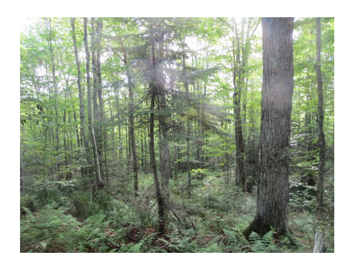
Flora and Fauna of the Bonshaw Hills: An Inventory of Flora and Fauna in Thirteen Sites in the Trans-Canada Highway Re-alignment Area New Haven to Bonshaw, PEI

A report to the Bonshaw Hills Public Land Management Sub-committee Charlottetown, Prince Edward Island October, 2014 Island Nature Trust