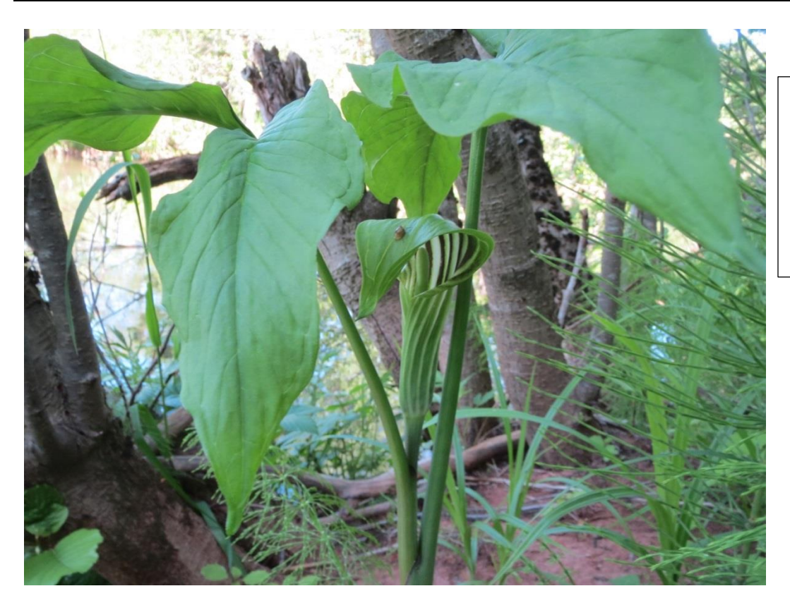
Figure 14: Swamp Jack-inthe Pulpit ( Arisaema triphyllum ) in Area E