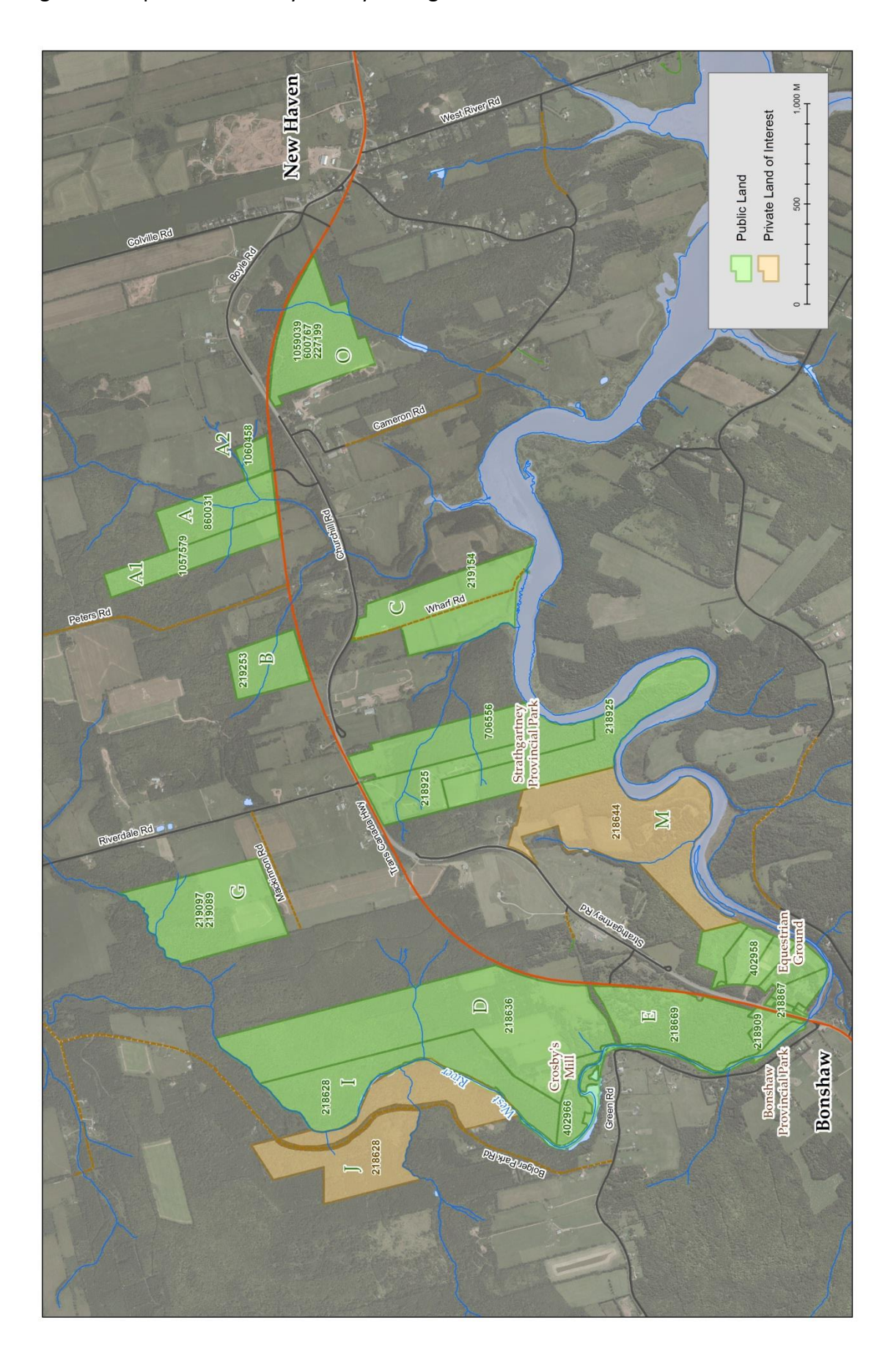
Figure 2: Map of Sites Surveyed May to August 2014