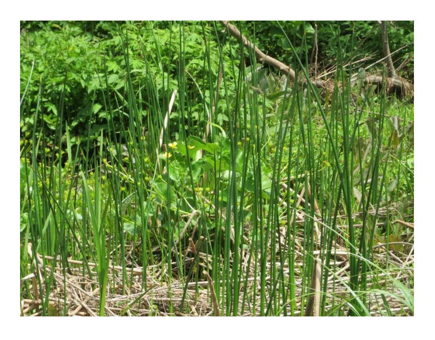
Figure 8: Baltic Rush ( Juncus balticus ) at Bonshaw Provincial Park

Non-vascular species were identified as observed but were not the target of this study. This list is incomplete and does not represent the full diversity of of fungi, lichens and non-vascular plants in this area.