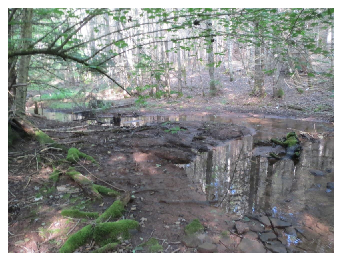
Figure 1: Tributary in Parcel A