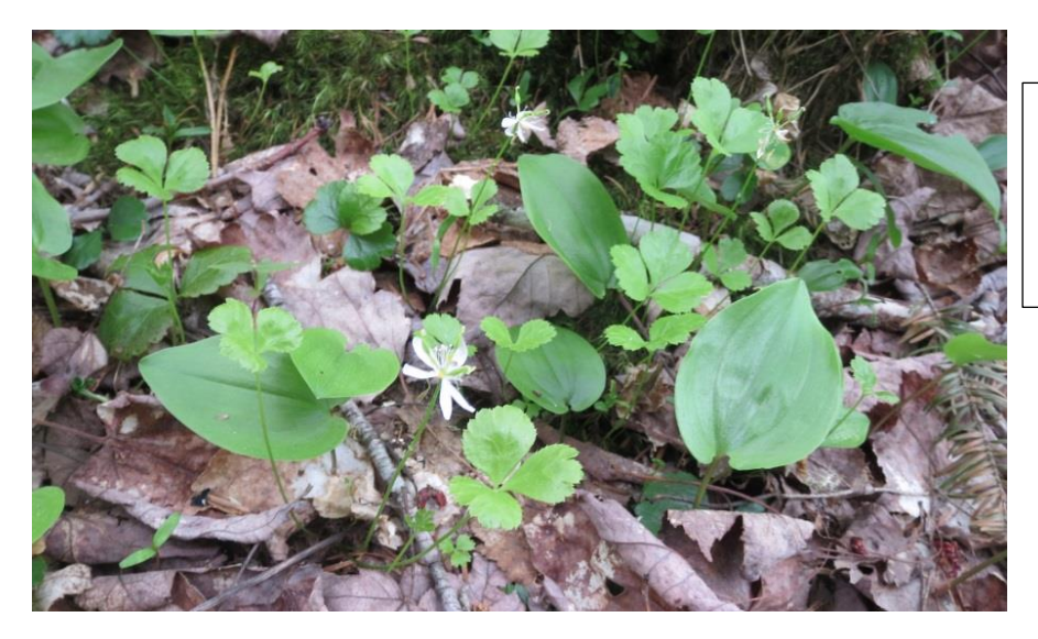
Figure 4: Goldthread ( Coptis trifolia ) and Wild Lily-of-the-valley ( Maianthemum canadense ) found in area G

Some species that we expected to find in large numbers were either present in low numbers or not at all. Low numbered species include Gold-thread, May Flower and Prince's Pine. No occurrences were noted for Tea-berry which is readily present in nearby St. Catherine's area. Dwarf Ginseng, One-flowered Shinleaf and Spring Beauty were not found, although there is suitable habitat.