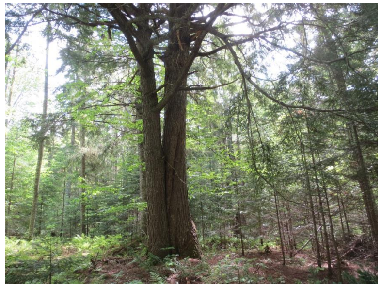
Figure 12: Large Eastern Hemlock ( Tsuga canadensis ) in Area D

A number of invertebrate species such as moths, butterflies, spiders and biting insects were noted but not identified.