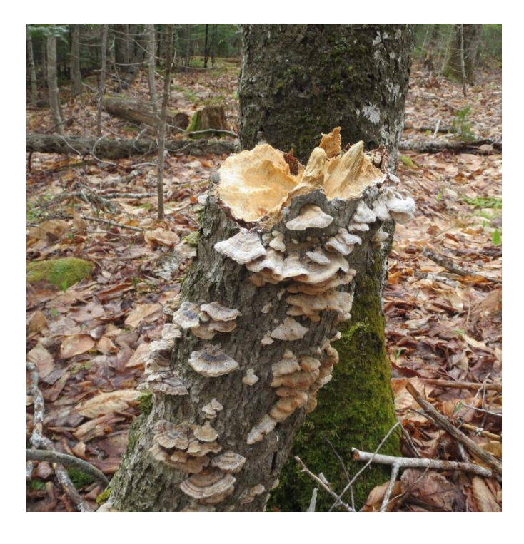
Figure 21: Bracket fungi in Strathgartney Woodland

Non-vascular species were identified as observed but were not the target of this study. This list is incomplete and does not represent the full diversity of of fungi, lichens and non-vascular plants in this area.