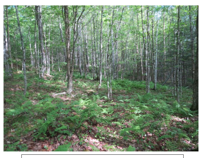
Figure 6: Young stand of hardwood in area A

Many sightings on this list are recorded from evidence of animals in the area, such as scat, tracks, middens and browse. A number of invertebrate species such as moths, butterflies, spiders and biting insects were noted but not identified.