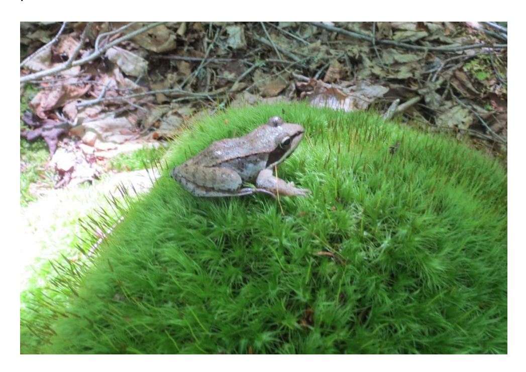
Figure 16: Wood frog (Lithobates sylvaticus) in area I

Non-vascular species were identified as observed but were not the target of this study. This list is incomplete and does not represent the full diversity of of fungi, lichens and non-vascular plants in this area.