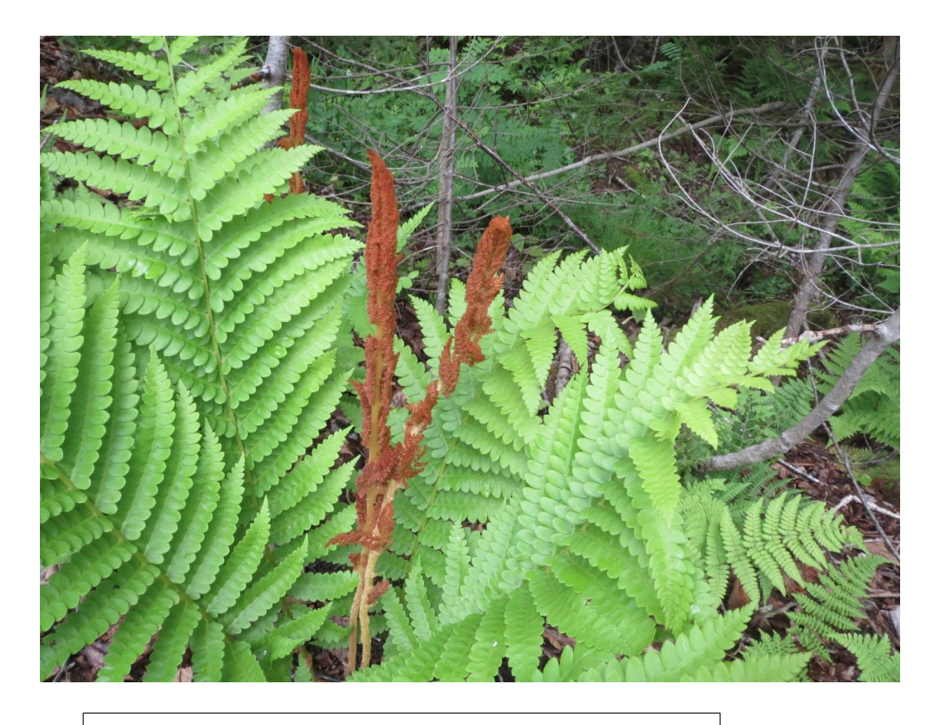
Figure 7: Cinnamon Fern (Osmunda cinnamomea) in Area B

A number of invertebrate species such as cicadas, moths, butterflies, spiders and biting insects were noted but not identified.