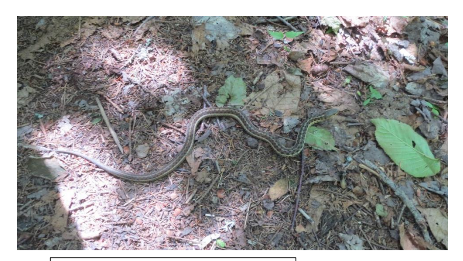
Figure 17: Eastern Garter Snake ( Thamnophis sirtalis )

A number of invertebrate species such as moths, butterflies, spiders and biting insects were noted but not identified.