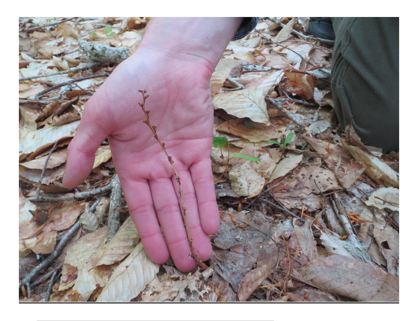
Figure 18: Beech-drops (Epifagus americana), Area M