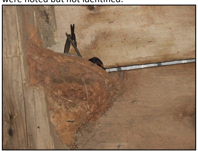
Figure 9: Barn Swallow ( Hirundo rustica ), listed with COSEWIC as Threatened, nest in building north of Area C.

A number of invertebrate species such as cicadas, moths, butterflies, spiders and biting insects were noted but not identified.