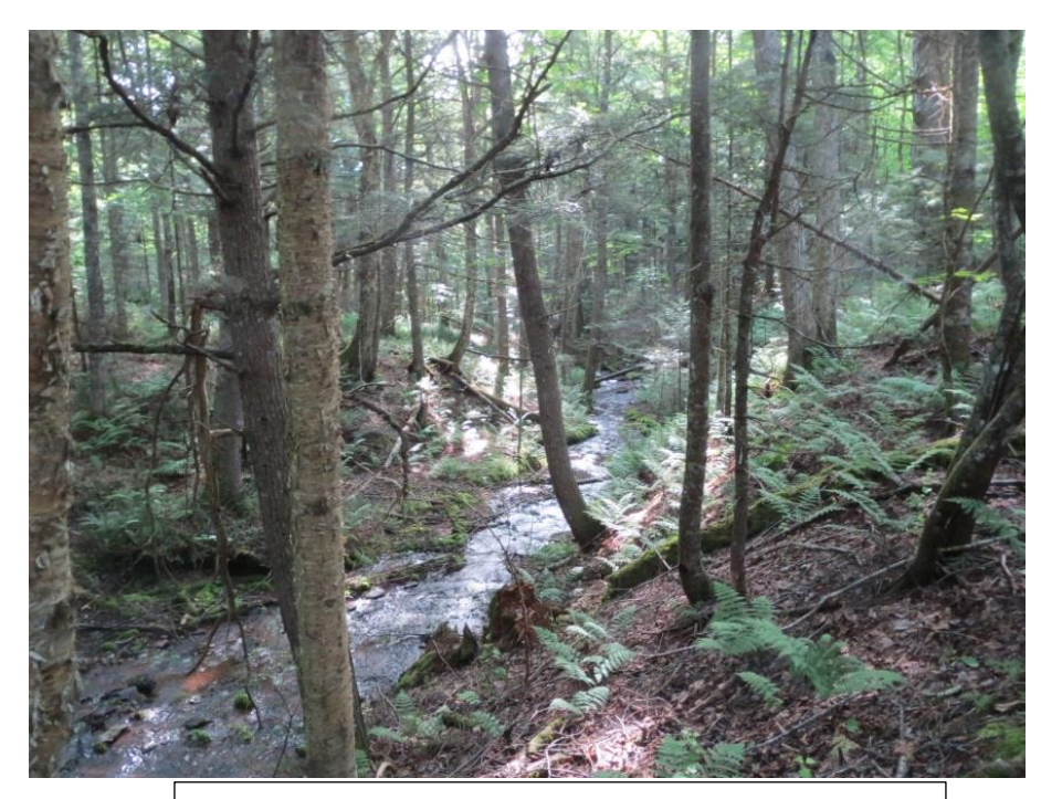
Figure 5: Riparian zone in Parcel A

Non-vascular species were identified as observed but were not the target of this study. This list is incomplete and does not represent the full diversity of fungi, lichens and non-vascular plants in this area.