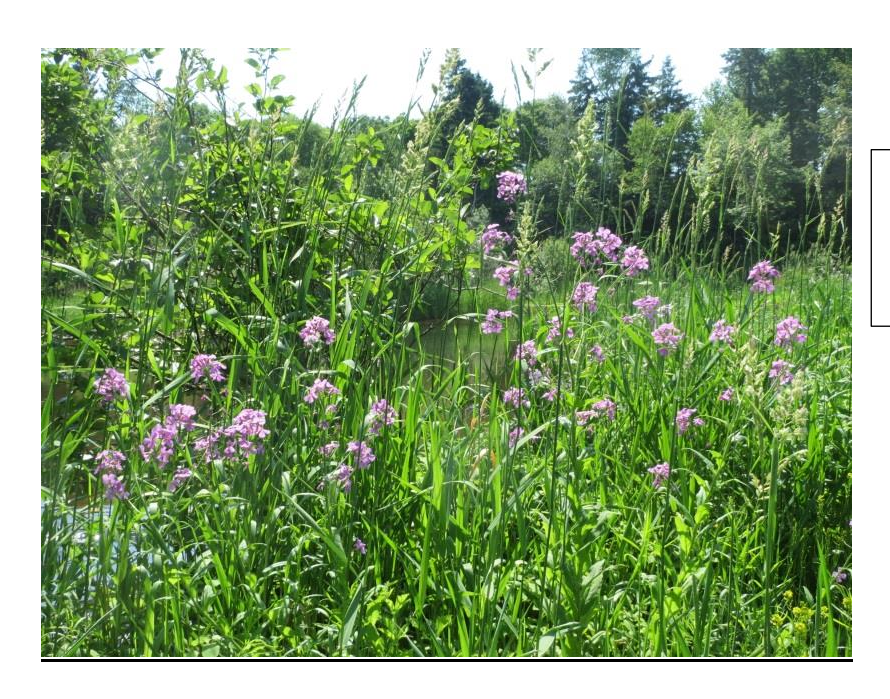
Figure 10: Dame's Rocket ( Hesperis matronalis ), an invasive plant, in Crosby's Mill area.