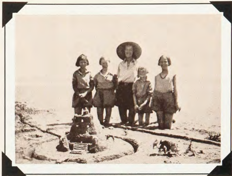
1936 campers and counselor built a sand castle.