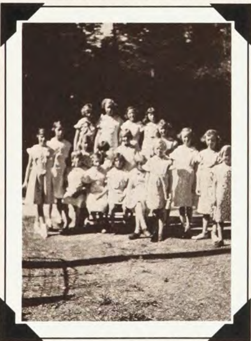
Campers model dresses they made in 1936.

"The camp uniform was hideous! Tasteful double brown outfits of brown bloomers and buff blouses." In addition, it was the custom to have each camper make a cotton print dress to wear home. "It was probably the only new dress the camper would receive that year as it was during the depression, and they were much needed during those hard times." But the