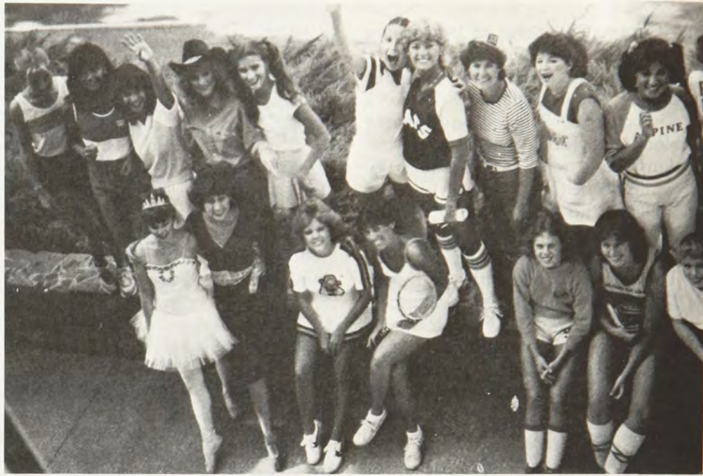
Dressed for sports, Washington State University collegians prepare to greet rushees to Sports Spectacular.