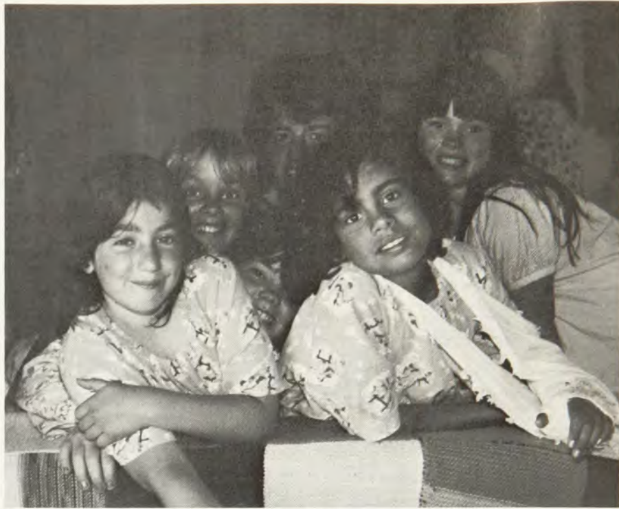
Part of the fun at camp is having a pajama party.