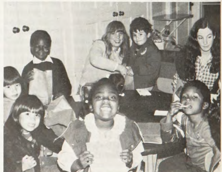
University of California Gamma Phi Betas have an Easter party for 30 children at St. Vincent's Day Home.