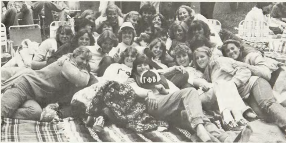
California Polytechnic collegians gather together at the Greek Week awards ceremonies.