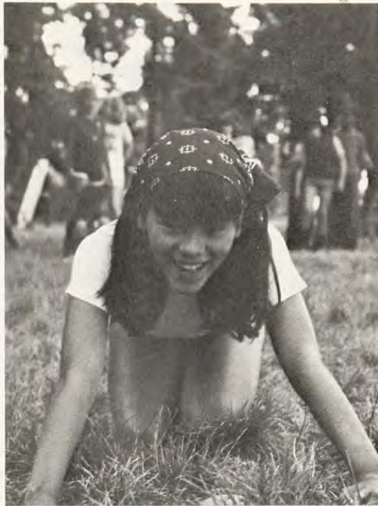
A camper prepares to push the potato with her nose on relay day.