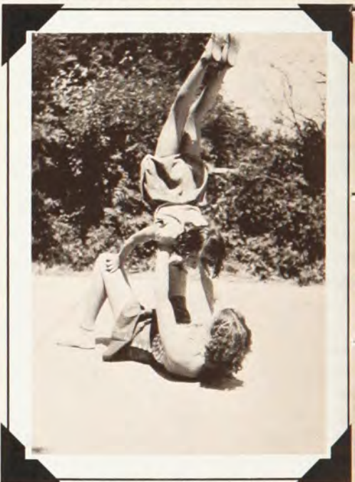
Campers doing acrobatics in 1935.

Beth's reminiscences continue: "The Mother's Club was as active as the