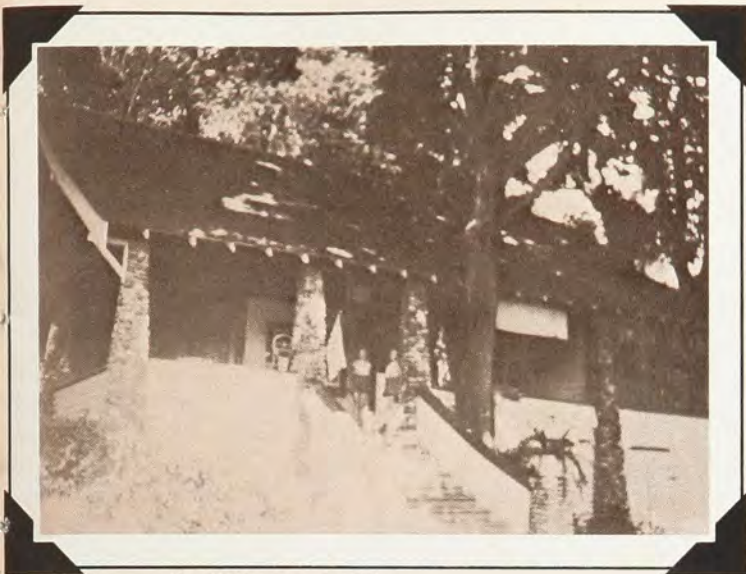
The Gables was the 1935 camp building.