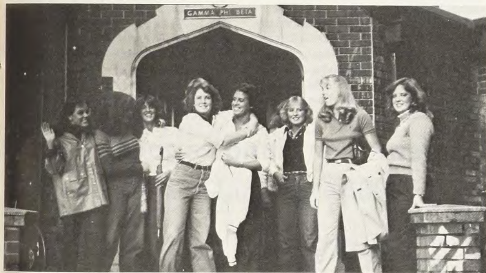
Oregon State University Gamma Phi Betas show their spirit on the front steps of the chapter house.