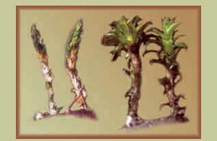
roof screw moss Tortula ruralis

∇ Seemingly lifeless lichens and bryophytes become photosynthetically active within minutes after wetting.