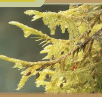
Douglas' neckera Neckera douglasii