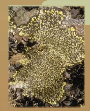
map lichen Rhizocarpon geographicum