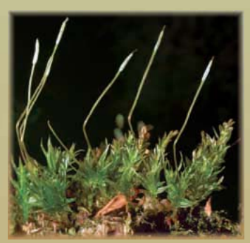
bent-kneed four-tooth Tetraphis geniculata