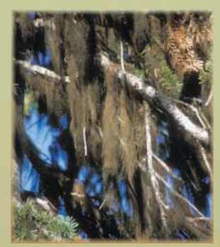
horsehair lichen Bryoria fremontii