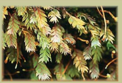
goblin gold Schistostega pinnata