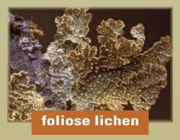
yellow specklebelly Pseudocyphellaria crocata