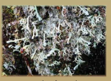
northern fan coral Bunodophoron melanocarpum

▷ Northern fan coral – This lichen was not previously known from the lower 48 states, but is now found in the Olympic National Park.