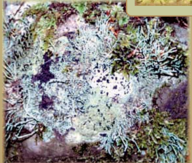
A variety of bryophytes and lichens are able to grow on a surface (substrate) as inhospitable as rock.

The work of a botanist! Exploring the realms of cryptogams often entails a very close examination of the subject matter.