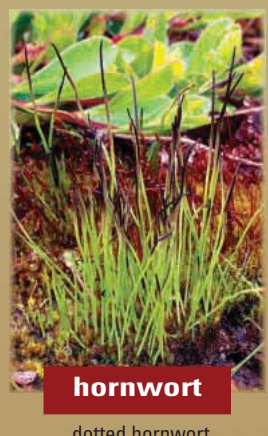
dotted hornwort Anthoceros punctatus