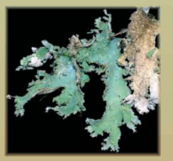
Flag moss – This moss has been found only three locations in Washington.

Some rare bryophyte and lichen species have been found recently in and near Olympic National Park, northwestern Washington.