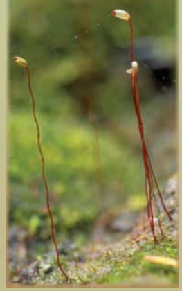
flaa moss Discelium nudum