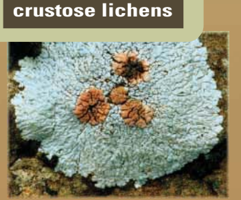
bullseye lichen Placopsis gelida