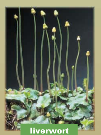
conehead liverwort Conocephalum conicum

Bryophytes are the small green plants commonly known as mosses, liverworts and hornworts. Compared to plants, they have primitive tissues for conducting food and water, and they lack a protective outer surface to maintain water balance. Most bryophytes, because they lack tissues such as roots, obtain their water through direct surface contact with their environment.