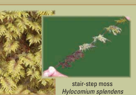
The age in years of stairstep moss can be determined by counting the number of "steps."