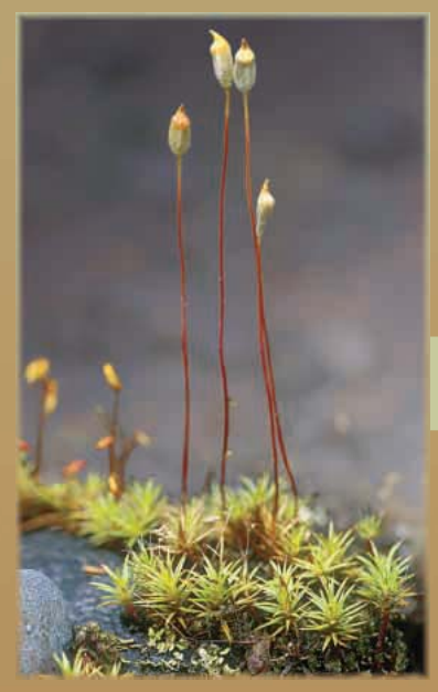
juniper haircap moss Polytrichum juniperum

available. Instead of producing seeds, bryophytes can either reproduce sexually by means of spores, or asexually when small pieces break off and grow into new individuals.