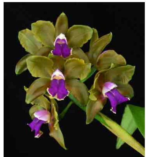
Left: Cattleya bicolor 'Sebastian Ferrell' AM/AOS, grown by Orchid Eros Center: Cattleya bicolor "Sense and Color' AM/AOS, grown by Orchid Eros Right: Cattleya bicolor 'Teccapin Station' AM/AOS, grown by Orchid Eros