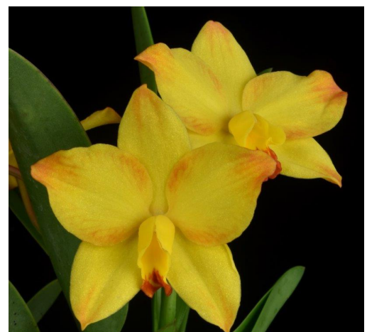
Left: Cycnoches cooperi 'Isabel Rosalia' CCM/AOS, grown by Orchid Eros Center: Rlc . Harriet Brickell 'St. Augustine' AM/AOS, grown by Orchid Eros Right: Cattleya Pole Star 'Gabriel' AM/AOS, grown by Orchid Eros