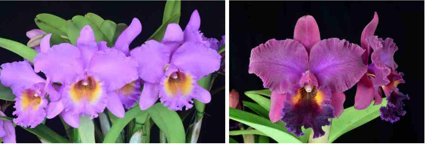
Left: Rlc . Pamela Ann Oliveros 'Mom's Best' AM/AOS, grown by Shogun Hawaii Right: Rlc . Sydney Southwick 'Dark Devil' AM/AOS, grown by Shogun Hawaii