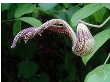
Fig.3.15 Aristolochia gibertii