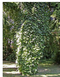
Fig. 3.8. Aristalochia macrophylla