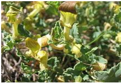
Fig.3.9. Aristolochia pistolochia