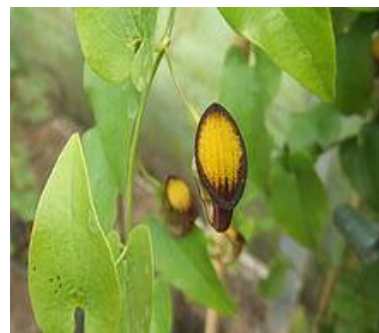
Fig.3.12. Aristolochia sempervirens