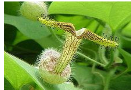
Fig.3.14. Aristolochia eriantha