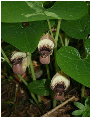
Fig.3.11. Aristolochia pontica