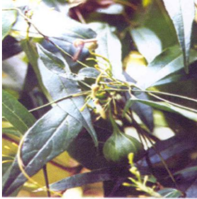
Fig.3.4. Aristalochia indica (Sapsanda/Sassandra)

September to January and found in humid environments where the elevation is up to 3000 ft. (Ayurvedic Herbarium, BMARI)