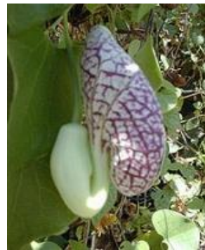
Fig.3.6. Aristalochia littoralis flower