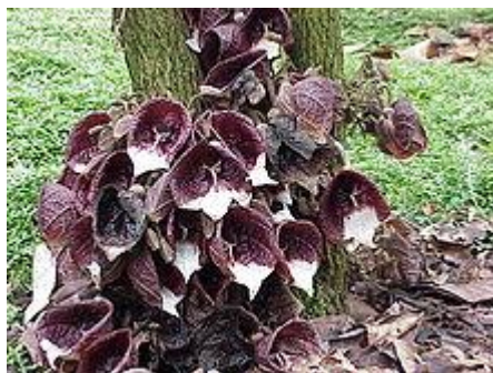
Fig.3.13. Aristolochia arborea