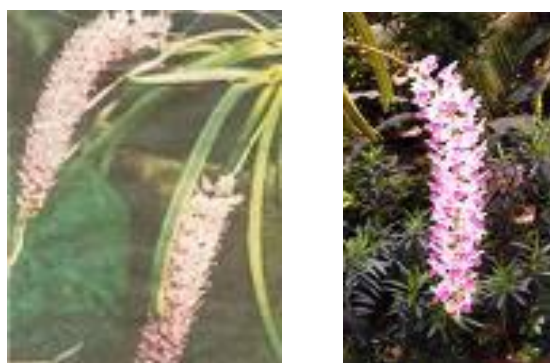
Fig.3.17. Guruluraja( Rhynchosyilis retusa ) Flower found in Badulla area( Uva Province)

Aristolochia ringens (Guruluraja-Sinhala name) (Fig. 3.17) is another Aristolochia species found in few Sri Lankan Ayurvedic prescriptions. Also, there is a pre-prepared syrup called "Guruluraja Thailaya" in some handbooks to prove the usage of Guruluraja in Ayurvedic Medicine. But in most available Sri Lankan literature, the plant species known as Guruluraja (Fig. 3.14) is not believed to be Aristolochia . The synonyms for Guruluraja are 'Foxtail Orchid' and 'Batticaloa Orchid'. According to the Uva provincial council website, Guruluraja is identified as Rhynchosyilis retusa , which belongs to the Orchidaceae family. Therefore, the research team concluded that further studies should be conducted to determine the Guruluraja plant.