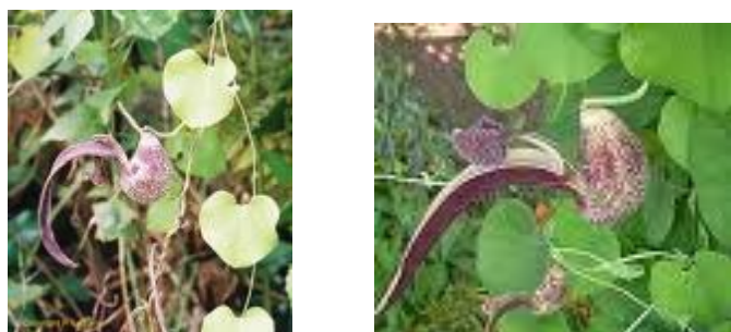
Fig.3.18. Aristolochia ringens (Sinhalese name yet to be identified for this species)