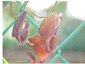
Fig.3.10. Aristolochia maxima