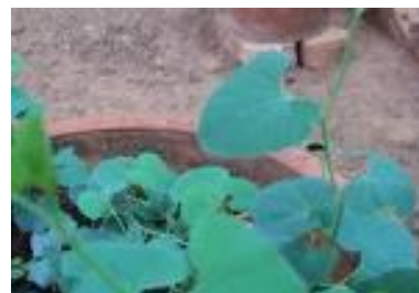
Fig.3.16. Aristolochia bracteolata