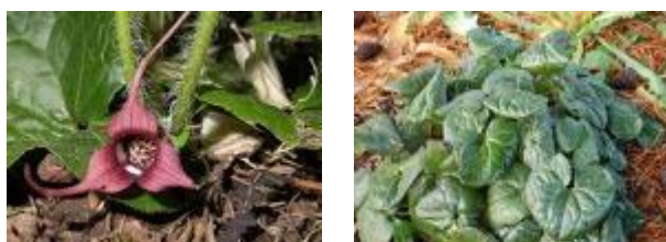
Fig.3.3. Asarum (wild ginger)

Other than these Aristolochia species, Asarum species (Wild Ginger) are considered to be contained Aristolochic acid, and no evidence was found to prove that they are being used in Sri Lanka.