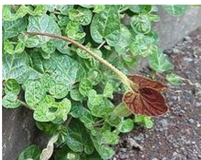
Fig.3.7 Aristalochia lindneri