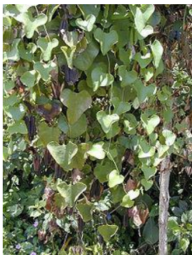
Fig.3.5. Aristalochia littoralis