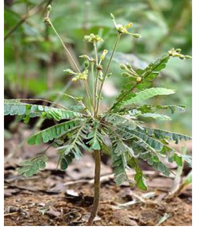
Whole plant of Biophytum sensitivum