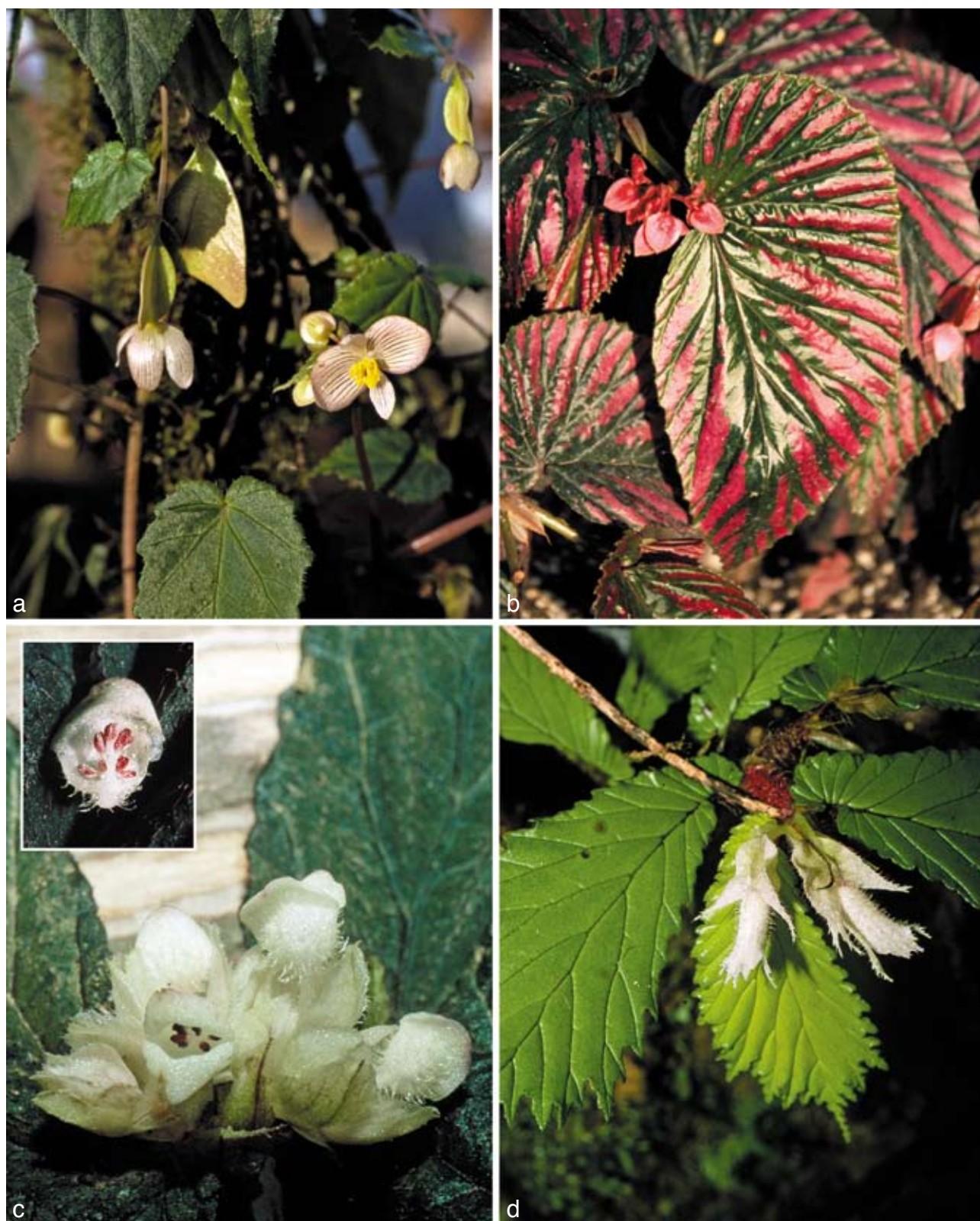
Plate 1 Representatives of the three Begonia sections occurring in New Guinea. a. Begonia kaniensis Irmsch. (sect. Diploclinium ); a climber, showing pendulous female flowers, an angular fruit wing much larger than the other two and male flowers having two of the four tepals pink with longitudinal markings; b. Begonia breviformis Irmsch. ssp. exotica Tebbitt (sect. Petermannia ); showing striking leaf markings and inflorescence of male flowers; c. Begonia sp. (sect. Symbegonia ); male flowers with stamens on an elongated torus (inset) and, in some species in the section, the tepals partially fused; d. Begonia sp. (sect. Symbegonia ); female flowers with tepals fused into a distinctive tubular 'corolla' and sharply pointed equal ovary wings manifestly extending beyond the style base.

for nearly half the total number in Southeast Asia (Hughes 2008). Even with 55 already described from New Guinea (e.g. B. augustae Irmsch. and B. simulans Merr. & L.M. Perry), it is most probable that many new species await description and will be predominately referable to sect. Petermannia . Although there are exceptions, most species are characterised by being protogynous with female flowers (often only two) at the base of