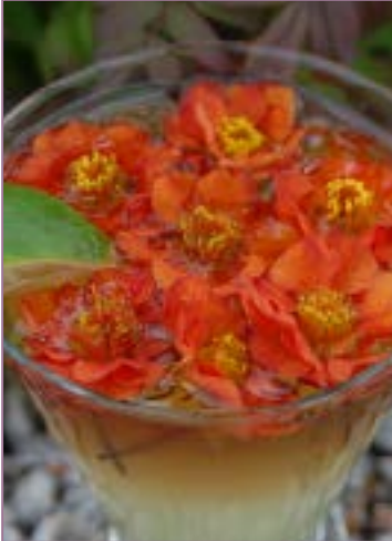
Geum x Dark and Stormy PP#27,225