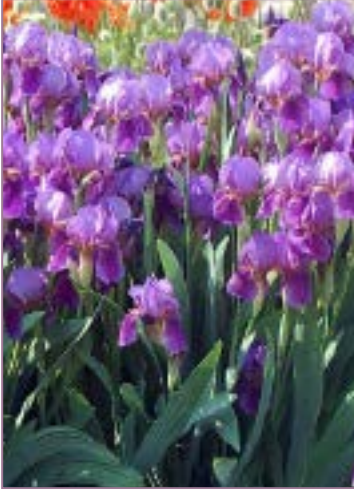
Iris pumila Prolific Purple