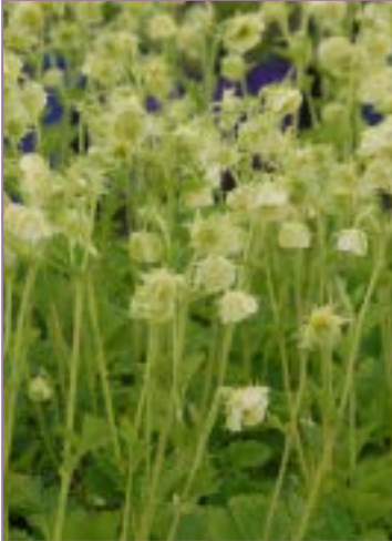
Geum x Champagne