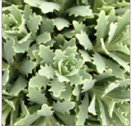
Sedum x Joyful PPAF