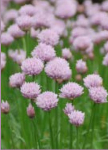
Allium x Chivette PPAF