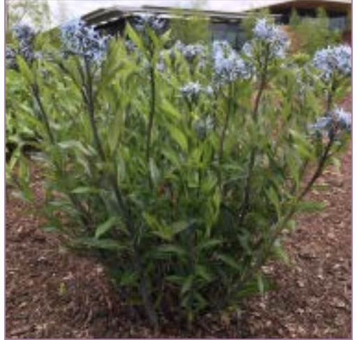
Amsonia tabernaemontana Fontana