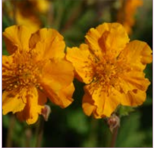
Geum x Solid Gold Dancer PPAF