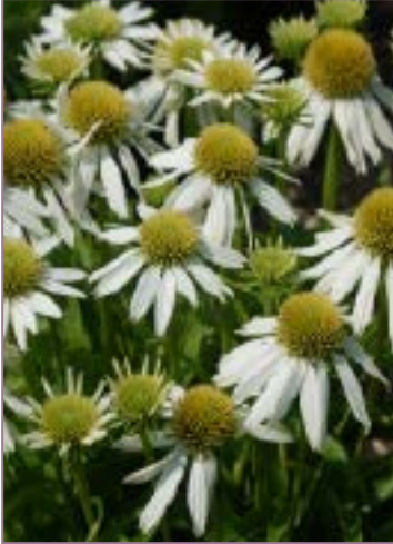
Echinacea x Snow Cone