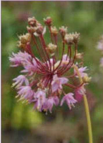
Allium cernuum Wine Drop