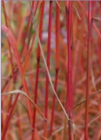
Andropogon gerardii Dancing Wind PP#26,892