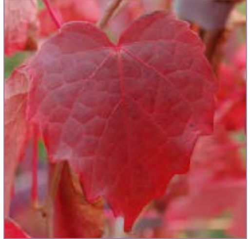
Parthenocissus tricuspidata Grand Slam