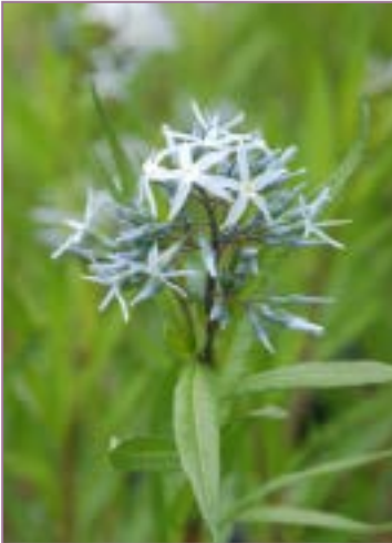
Amsonia x Seventh Inning Stretch