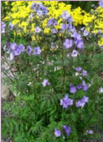
Polemonium x Heaven Scent PP#20,214