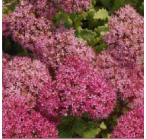
Sedum x Rock Star PPAF