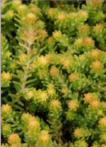
Sedum sexangulare Golddigger