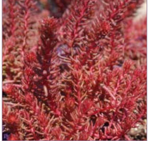
Sedum rupestre Making Progress PPAF