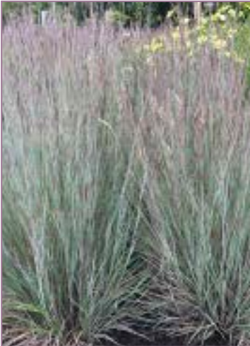
Schyzachrium scoparium Jazz