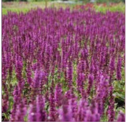
Salvia nemorosa Ave Maria