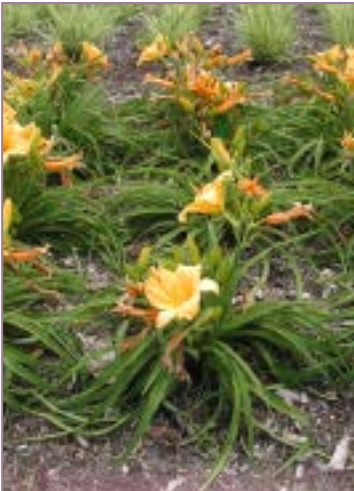
Hemerocallis x On Top Syn. Baby Stella™