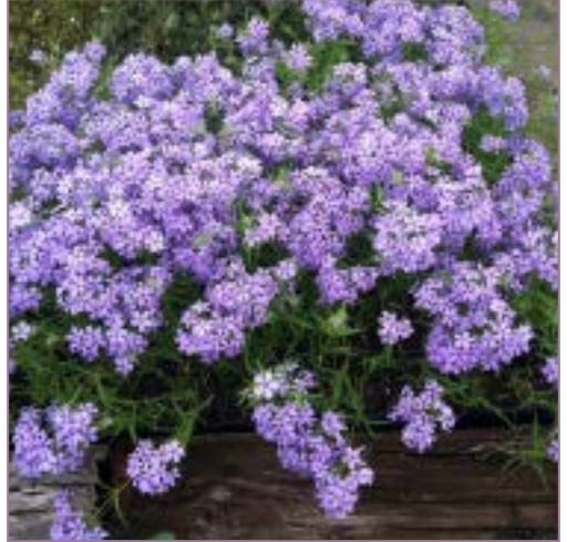
Phlox pilosa Bungalow Blue