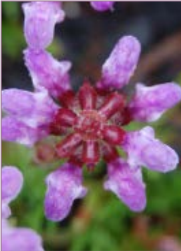
Prunella vulgaris Under the Sea