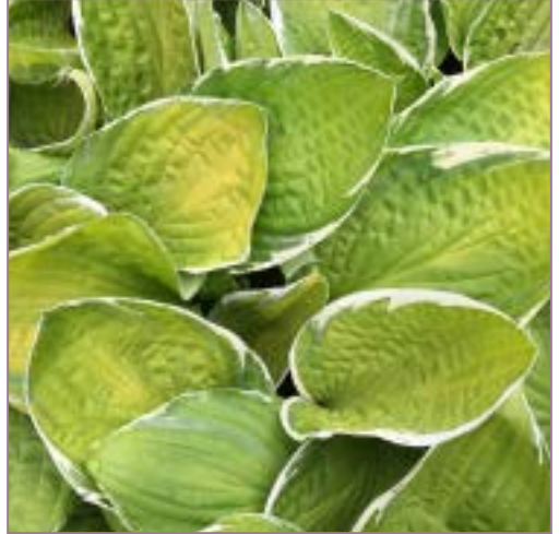
Hosta x Hasta Mañana PPAF