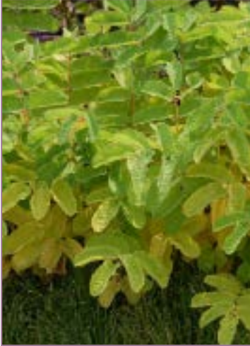
Sanguisorba canadensis Candlelight