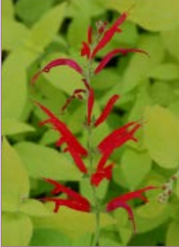
Salvia elegans Golden Delicious PP#17,977