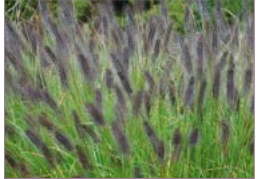
Penstemon alopecuroides Red Rocket PP#28,715