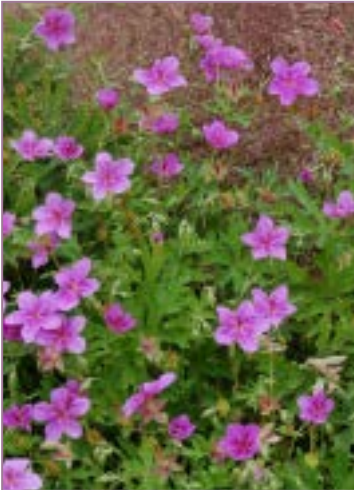
Geranium soboliferum Butterfly Kisses