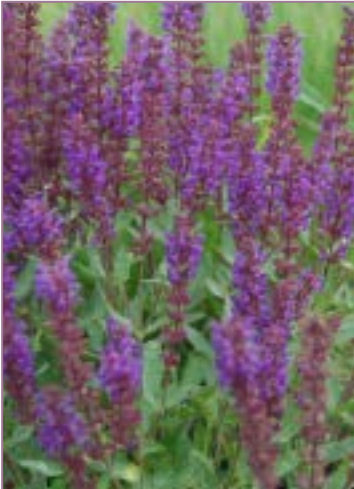
Salvia nemorosa Blueberry Beret