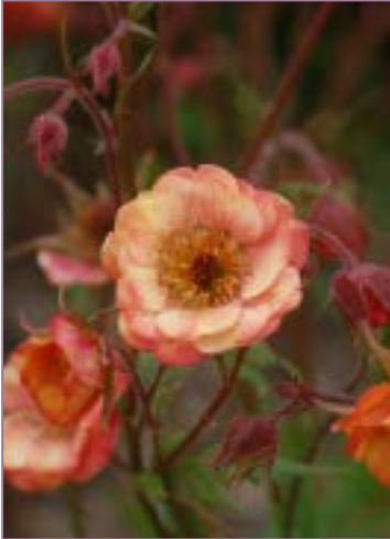
Geum x Wet Kiss PP#27,227