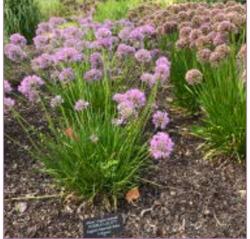
Allium x August Asteroids