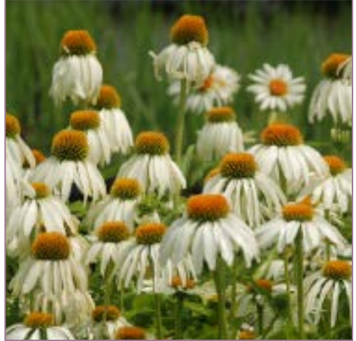
Echinacea purpurea White Showoff