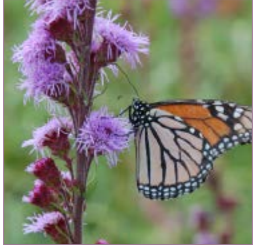
Liatris ligulistylis Butterfly Magnet