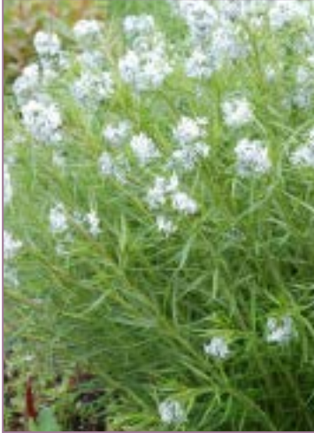
Amsonia x Halfway to Arkansas