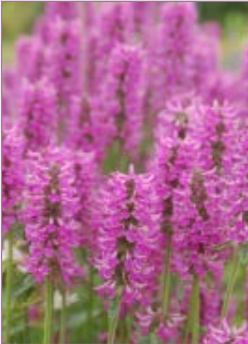
Stachys x Summer Romance PPAF