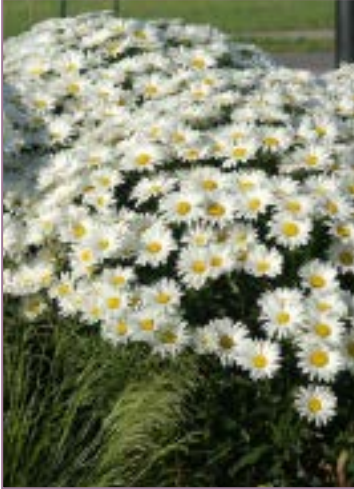
Leucanthemum superbum Daisy Duke PP#21,914 Daisy May®