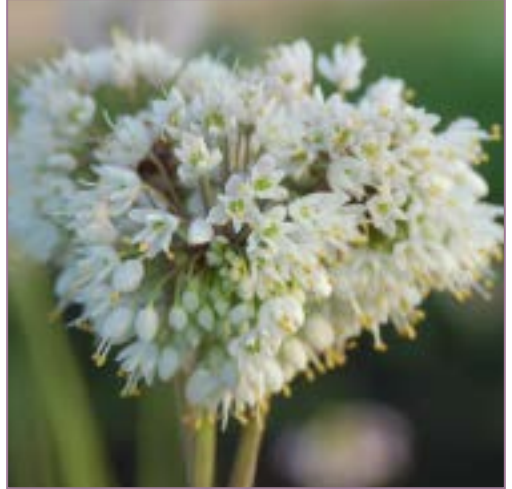
Allium cernuum Falling Stars