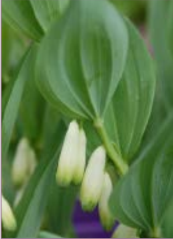
Polygonatum biflorum Prince Charming PP#22,304