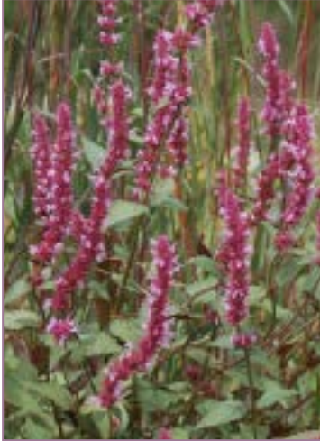
Agastache x Velvet Crush PPAF