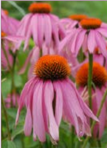
Echinacea purpurea Showoff