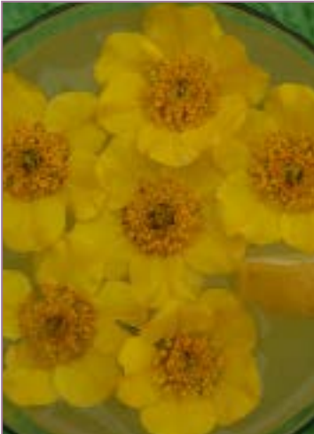
Geum x Limoncello