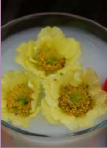
Geum x Banana Daiquiri PP#25,351