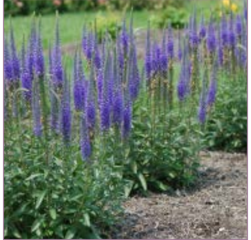
Veronica x Spike PP#27,814