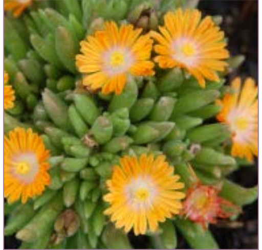
Delosperma x Orange Crush PPAF