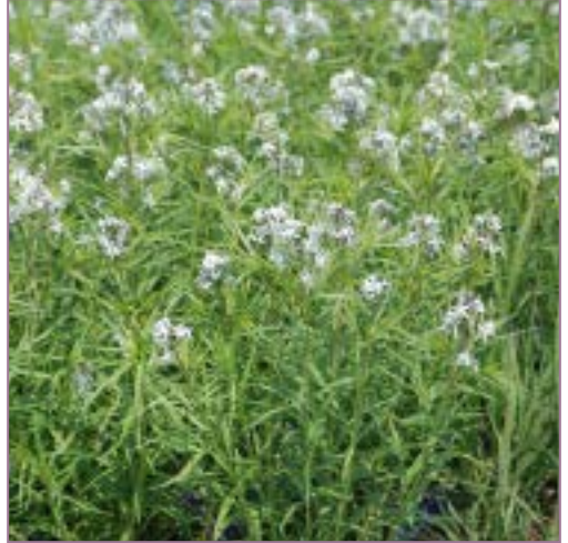
Amsonia x Midway to Montana