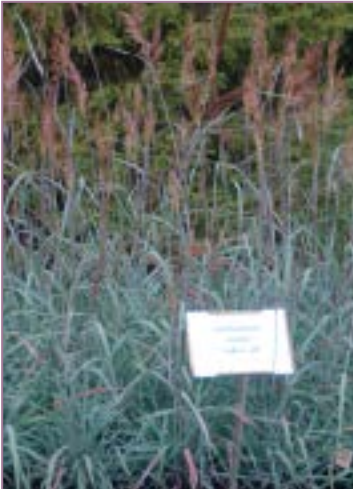
Sorghastrum nutans Skywalker