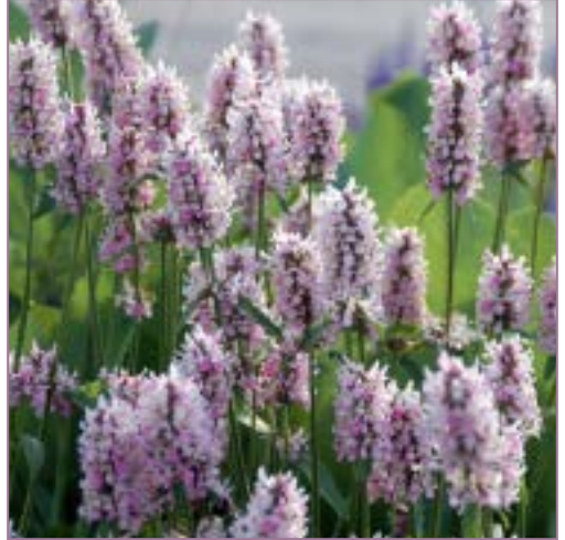
Stachys x Summer Crush PPAF