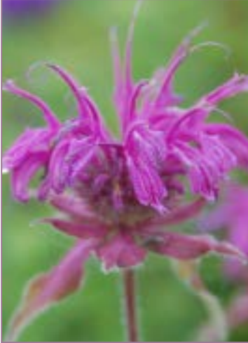
Monarda x Mojo PPAF