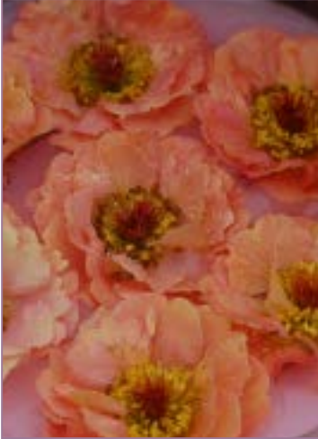
Geum x Mai Tai PP#22,433