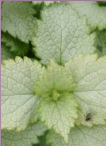
Lamium maculatum Ghost