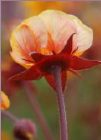
Geum x Spanish Fly PP#27,226