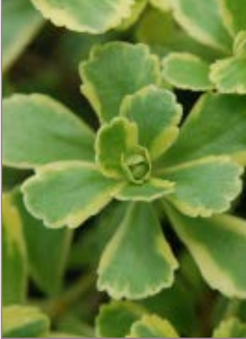
Sedum ellacombianum Cutting Edge PPAF