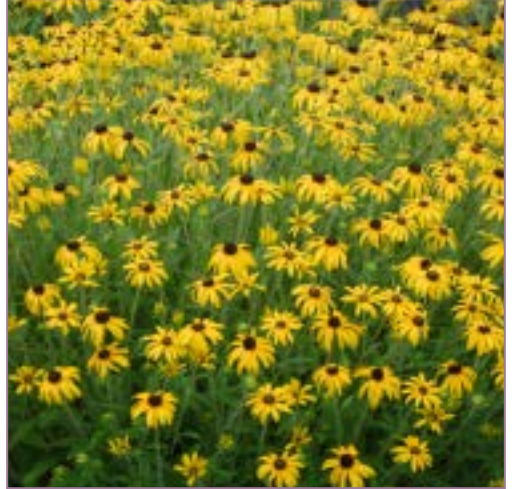
Rudbeckia x American Gold Rush PP#28,498