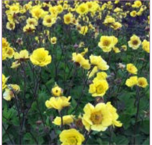
Geum x Top Shelf Margarita PPAF