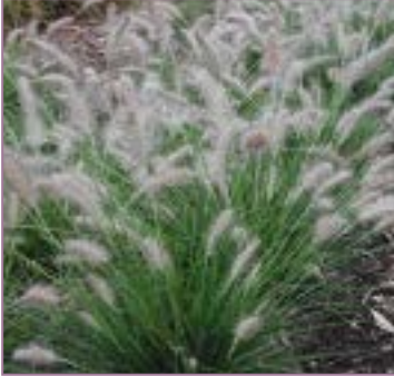
Pennisetum alopecuroides Piglet PP#19,074