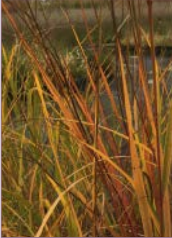
Spartina pectinata Cinnamon Spice