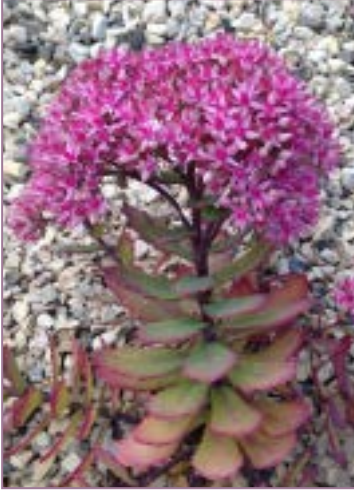
Sedum x Peace and Joy PPAF