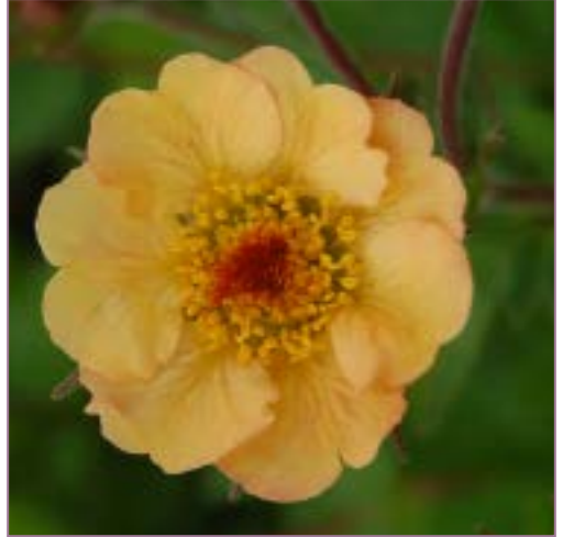
Geum x Peach Daiquiri PP#28,840