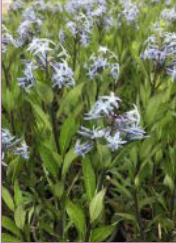
Amsonia x Short Stop