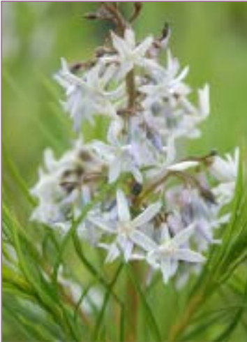
Amsonia hubrichtii Green Mist