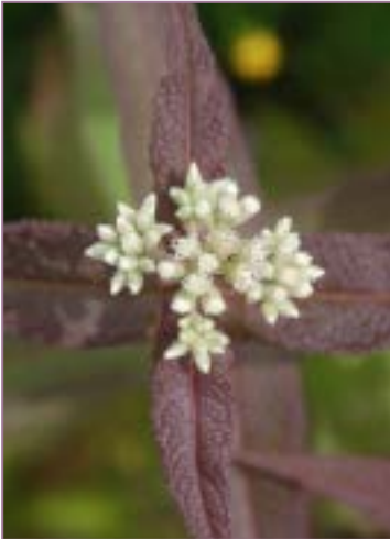
Eupatorium perfoliatum Milk 'n Cookies