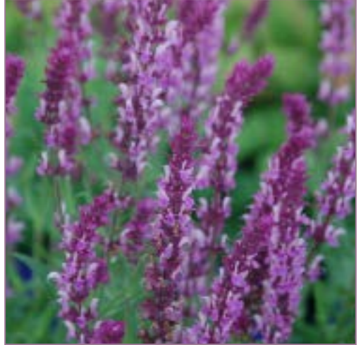
Salvia nemerosa Pink Wesuve