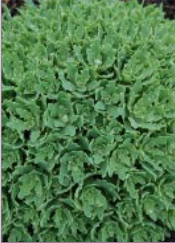
Sedum x Thundercloud PP#21,833