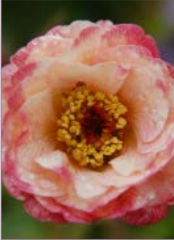
Geum x Cosmopolitan PP#24,982