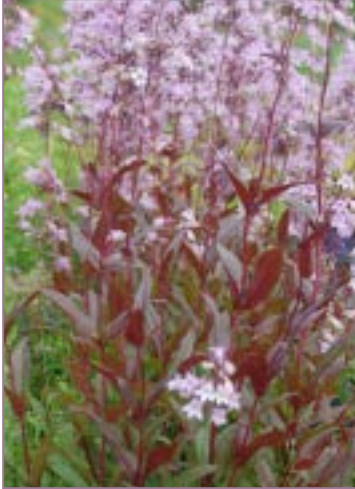
Penstemon digitalis Pacahontas PP#24,804