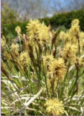
Carex pensylvanica Straw Hat PPAF