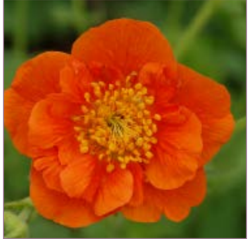
Geum x Coppertone Punch PPAF