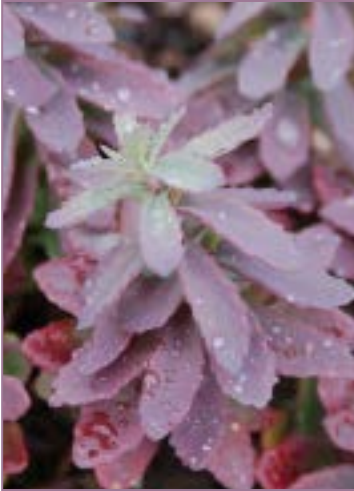
Sedum x Plum Perfection PP#22,690