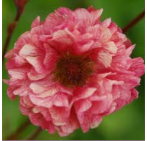
Geum x Cherry Bomb PPAF