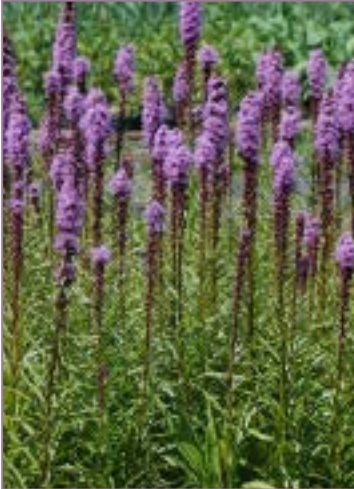
Liatris spicata Trailblazer