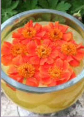
Geum x Sea Breeze PP#26,437