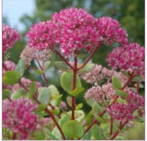
Sedum x Pillow Talk PP#28,528