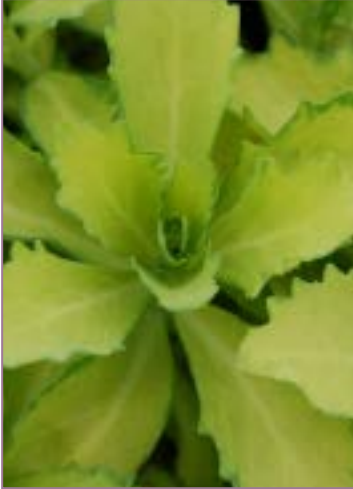
Autumn Delight™ Sedum x Beka PP#18,398