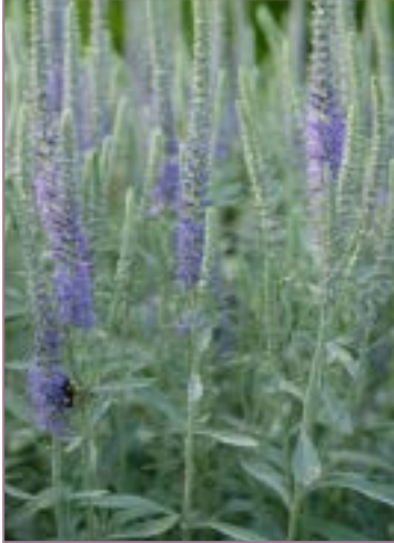
Veronica incana Pure Silver