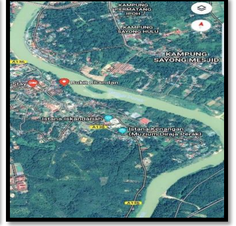
Fig 2:- Royal Town of Kuala Kangsar, Perak