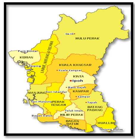
Fig. 1:- Perak State Map

Kuala Kangsar is selected for this study because it is a convenient location; it holds a unique heritage of the Perak Malay Sultanate. It contains a much historic building associated with the royal legacy heritage. Furthermore, the town has officially declared as the Perak Royal City since 1887 (Shen, Farid, & McPeek, 2008). The Royal Town of Kuala Kangsar is located in the State of Perak and situated in the north of Peninsular Malaysia between Ipoh and Taiping. The town today is bypassed by the North-South Highway and has become a backwater of tourism. It is 35km north of Ipoh, the State Capital, and situated on the western bank of the Perak River. From Ipoh, the highway passes through karst topography dominated by rounded limestone hills blanketed in unique vegetation that can survive the harsh conditions.