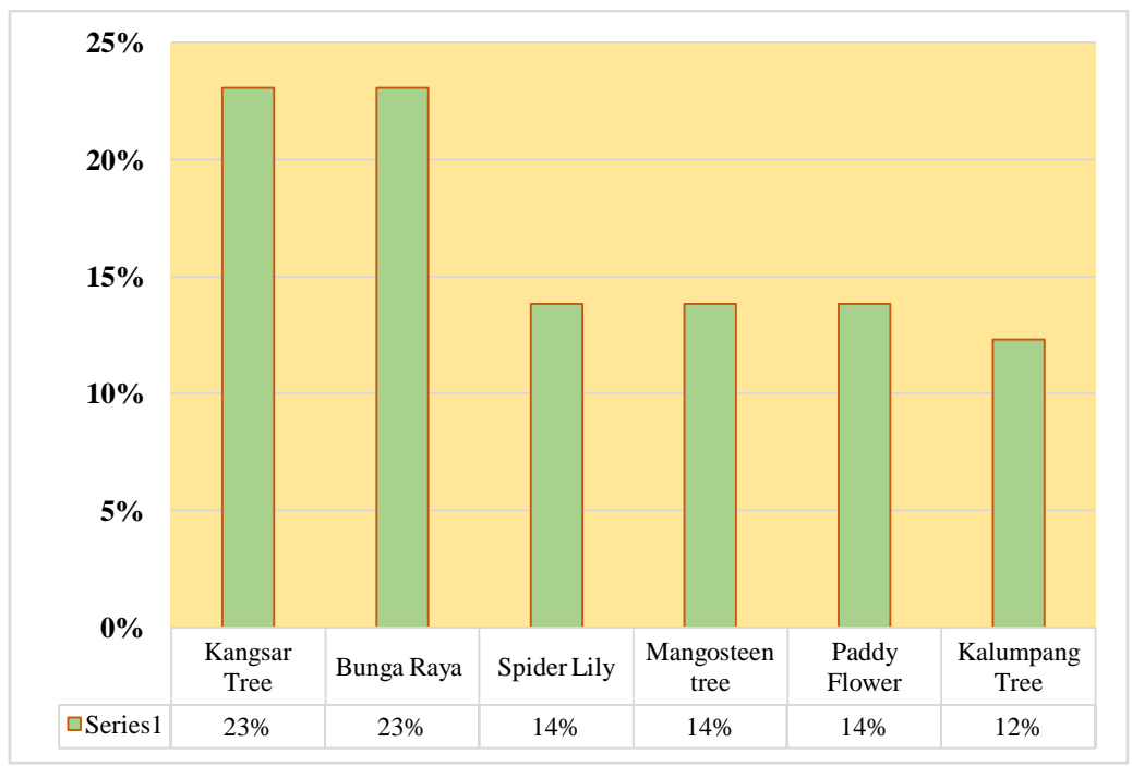
Fig 7:- The Type of Plants under the Heritage Plants Category (Prepared by; I.Khasumarlina, 2018).

In general, cultural plants have significant roles in the lives of people in Kuala Kangsar. These plants are involved in preserving cultural activities by recording information about the horticultural habits of their ancestors, such as knowing the role of the plants in societal activities in general and in particularly their roles in the activities of the Perak royal household.