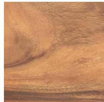
ESPIÑO BLANCO (acacia albicorticata)