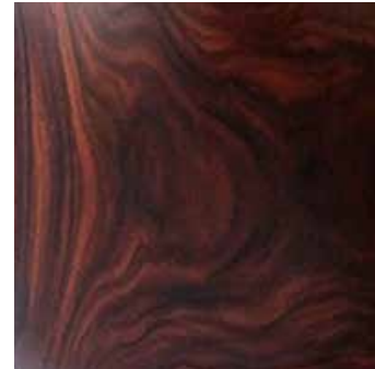
MORADO (machaerium scleroxylon)