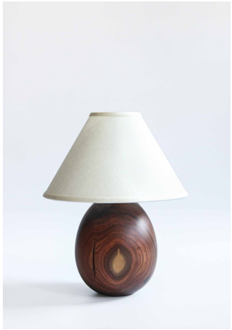
SMALL 15" H / 38 cm