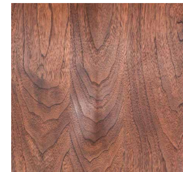
CUPESÍ NEGRO (prosopis nigra)