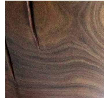
GUAYACÁN (guaiacum officinale)