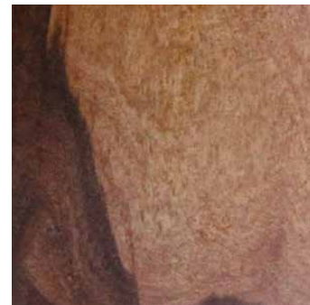
SIETE COPAS (terminalia catappa)