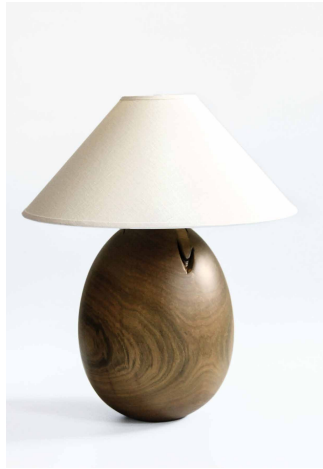
MEDIUM 19" H / 48 cm