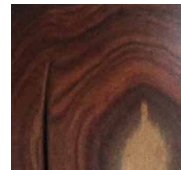
CUPESÍ (prosopis chilensis)