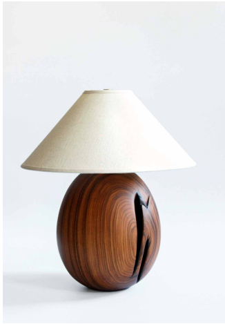
SMALL MEDIUM 17" H / 43 cm