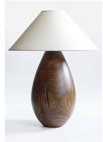
EXTRA LARGE 27" H / 69 cm