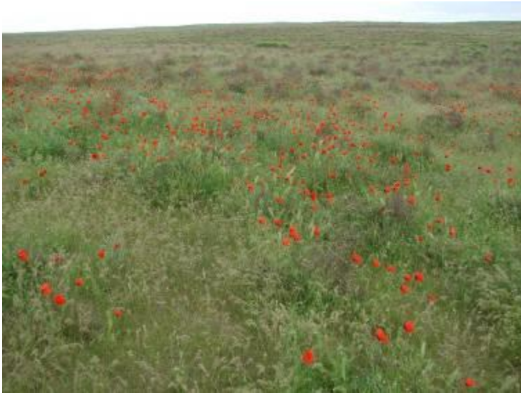
Ephemeral-ephemeroid vegetation in the South-eastern Kyzylkum Photos and text by Natalia Beshko