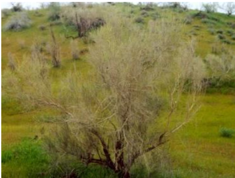
The White Saxaul forest (South-Eastern Kyzylkum)