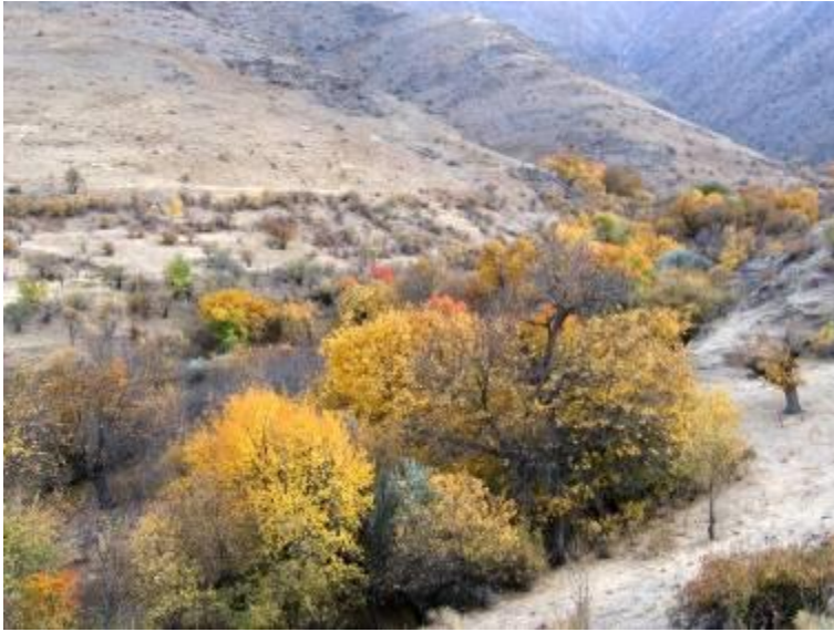
Walnut forest (Nuratau range)