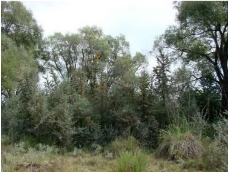
Riparian forest (tugai) (valley of Zeravschan river)