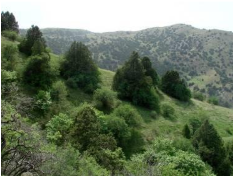
Juniper forests (Turkestan range)