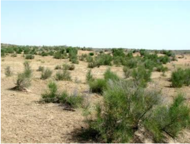
Psammophytic shrubs formed by Calligonum (Western Kyzylkum)