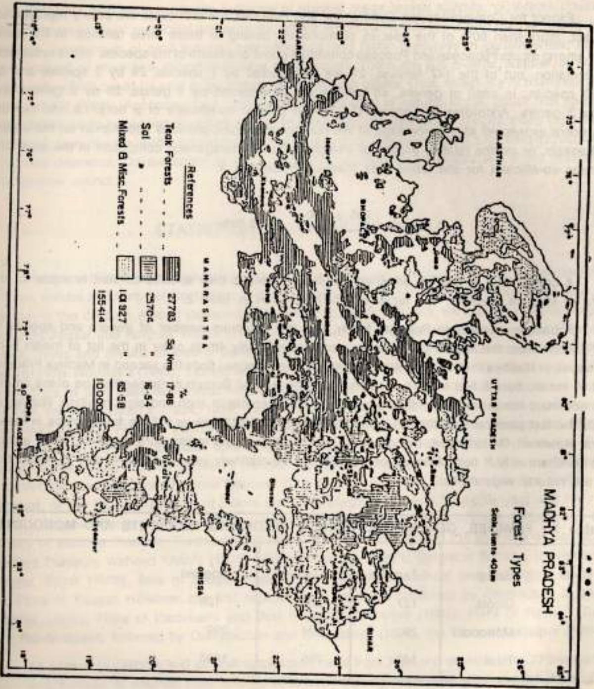
Map 3 . Showing forest types in Madhya Pradesh