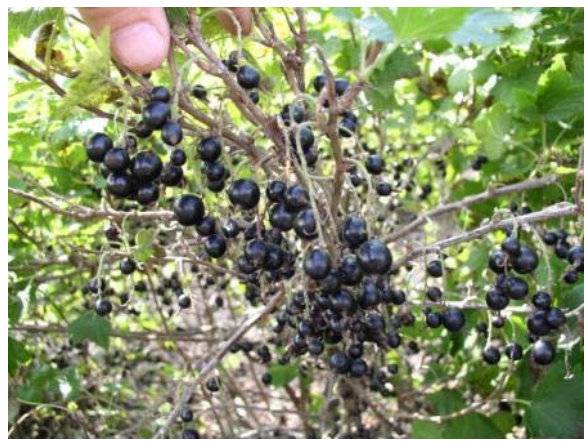
American black currant.

Contributed by: USDA NRCS Bismarck Plant Materials Center