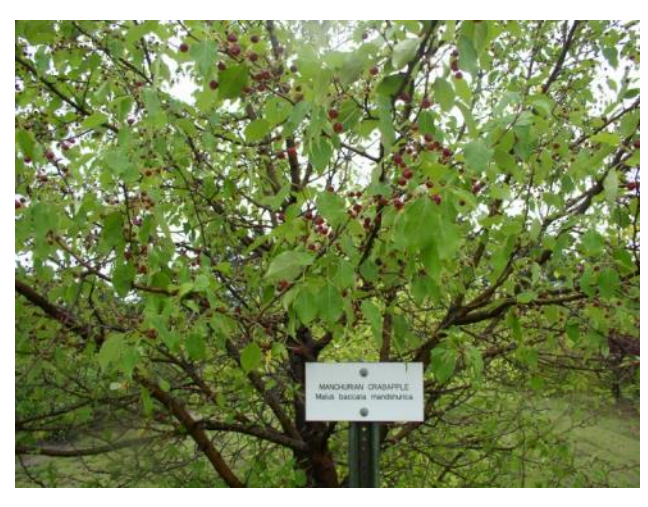
The small apples are eaten by many species of birds.

The fruit is a pea-sized apple, highly desirable by birds and small mammals. It is spread locally by these animals. Manchurian crabapple is not aggressive, and invasiveness is not usually a concern. Fire and herbicide can be used for control.