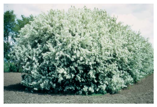
Photo Credit: USDA NRCS Plant Materials Center, Bismarck, North Dakota

Contributed by: USDA NRCS Plant Materials Center, Bismarck, North Dakota