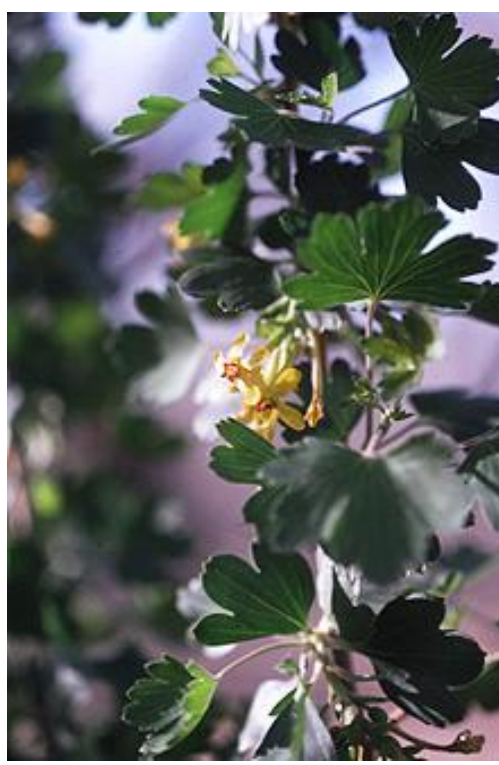
Botany Dept., NMNH, Smithsonian Institution @ PLANTS

Contributed by: USDA NRCS National Plant Data Center & the Biota of North America Program