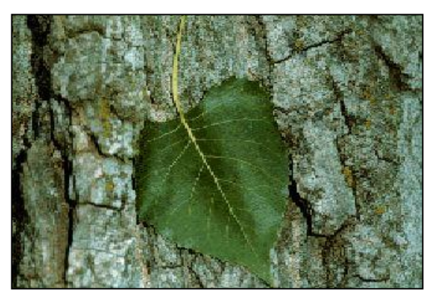
Robert Mohlenbrock USDA NRCS 1995 Northeast Wetland Flora @USDA NRCS PLANTS

Contributed by: USDA NRCS Plant Materials Program