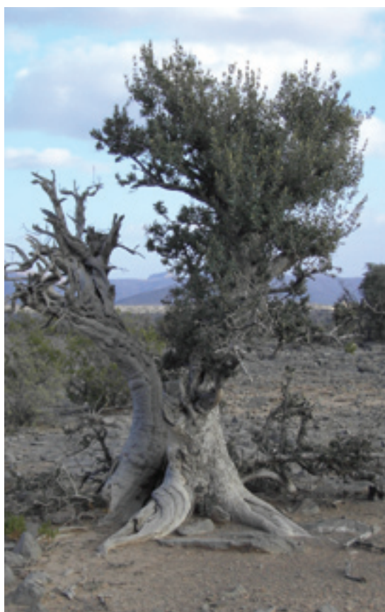
Left: Olea europaea subsp. cuspidata on Al Jebel Al Akhdar.

found at the coolest site above 1,700 metres, while others only occurred at the warmer locations. A multilayered vegetation structure dominated with a canopy, an understory and a ground layer. Greatest species richness was recorded in the lowest stratum. Multicropping in small-scale agriculture creates favourable microclimates and often provides habitats for wild plants and animals. Remote Omani oases are not only a recently discovered important refuge for ancient wheat landraces (Al-Maskri et al. 2003, Zhang et al. 2006, Al Khanjari et al. 2007a,b) but also for indigenous wild plant