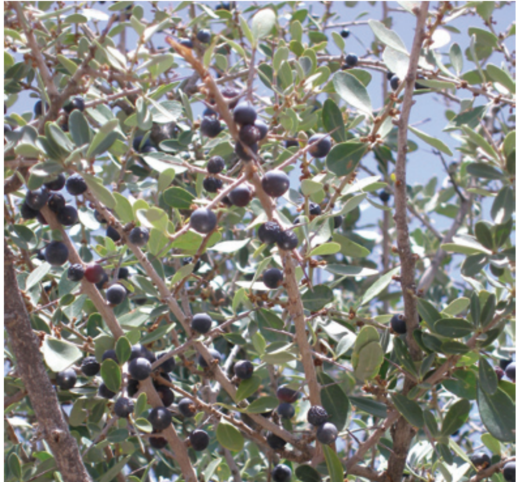
Sideroxylon mascatense on Al Jebel Al Akhdar