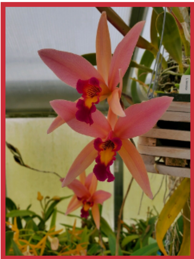
L. Santa Barbara Sunset 'Showtime' HCC/AOS