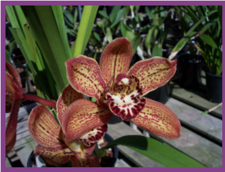
Cym. Dosido 'Freckleface' HCC/AOS