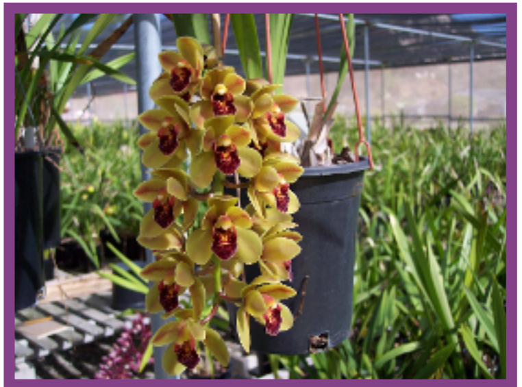
Cym. Mad Hatter