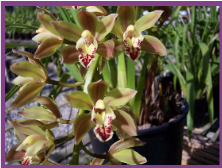
Cym. Len Southward x Pepperpuss