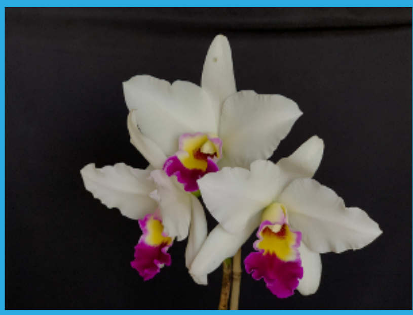
Lc. Higher Ground 'Masterpiece' x self