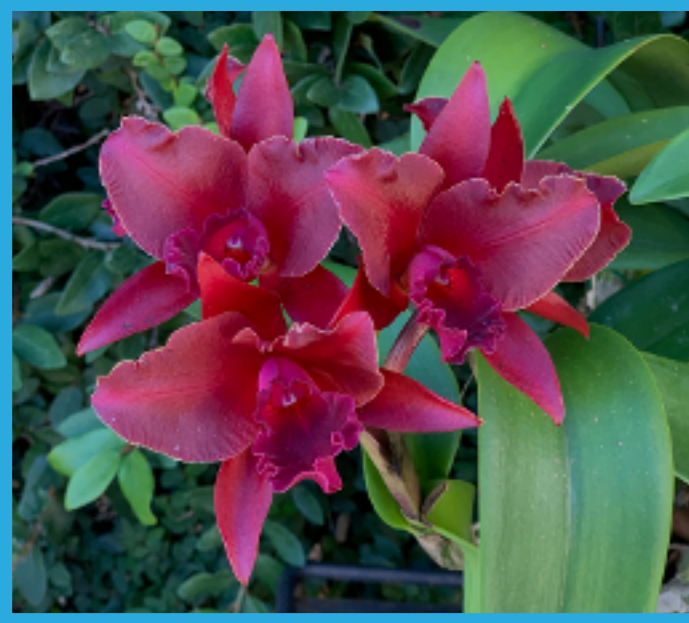
Blc. Cherry Suisse 'Kauai' HCC/AOS