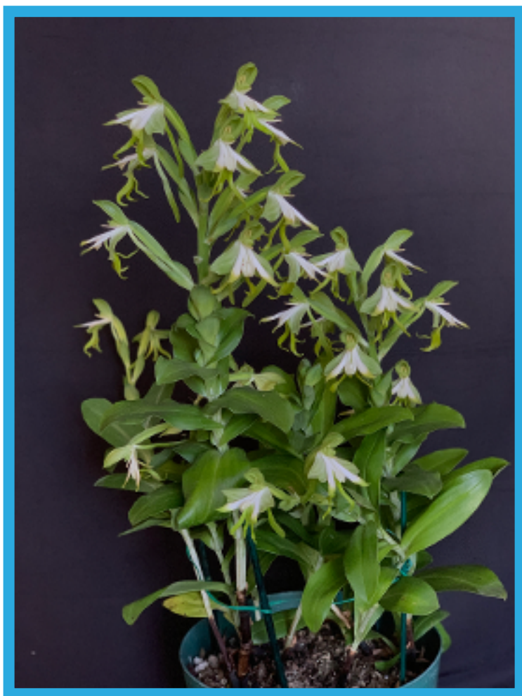
Bonatea speciosa 'Green Egret' FCC/AOS