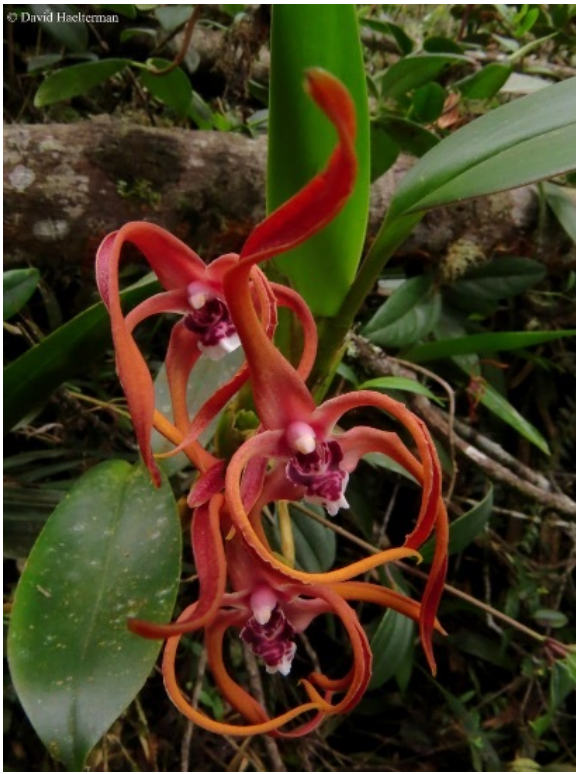
Probably the first registration of the magnificent Maxillaria platyloba in situ for Valle del Cauca department. One of my preferred species in Colombia, from cold climate around 2800 m asl.