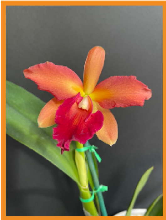
Blc. Tropical Upgrade