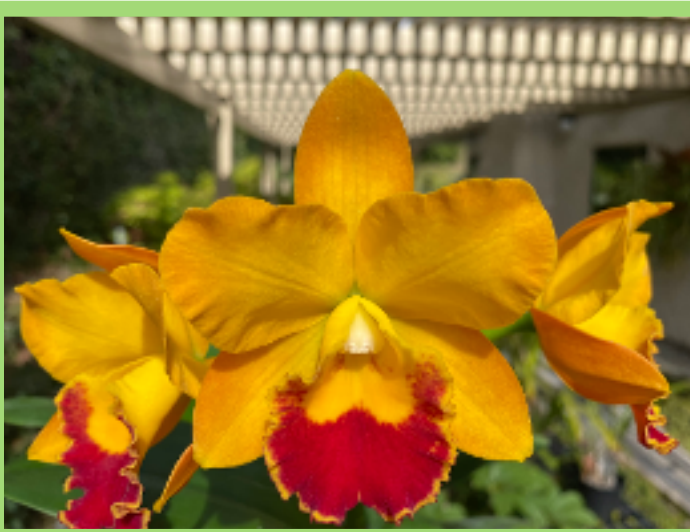
Blc. Husky Boy