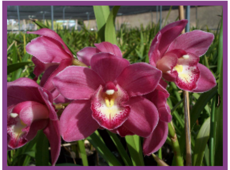
Cym. Valley Olympic 'Rose'