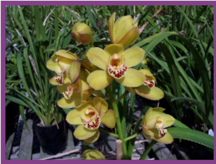
Cym. Tanto's Targer 'Tatsue'