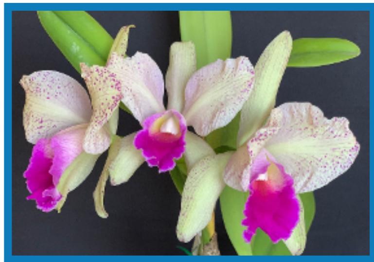
AMN-237E Blc. San Diego Hot Spots x C. Horace 'Maxima'