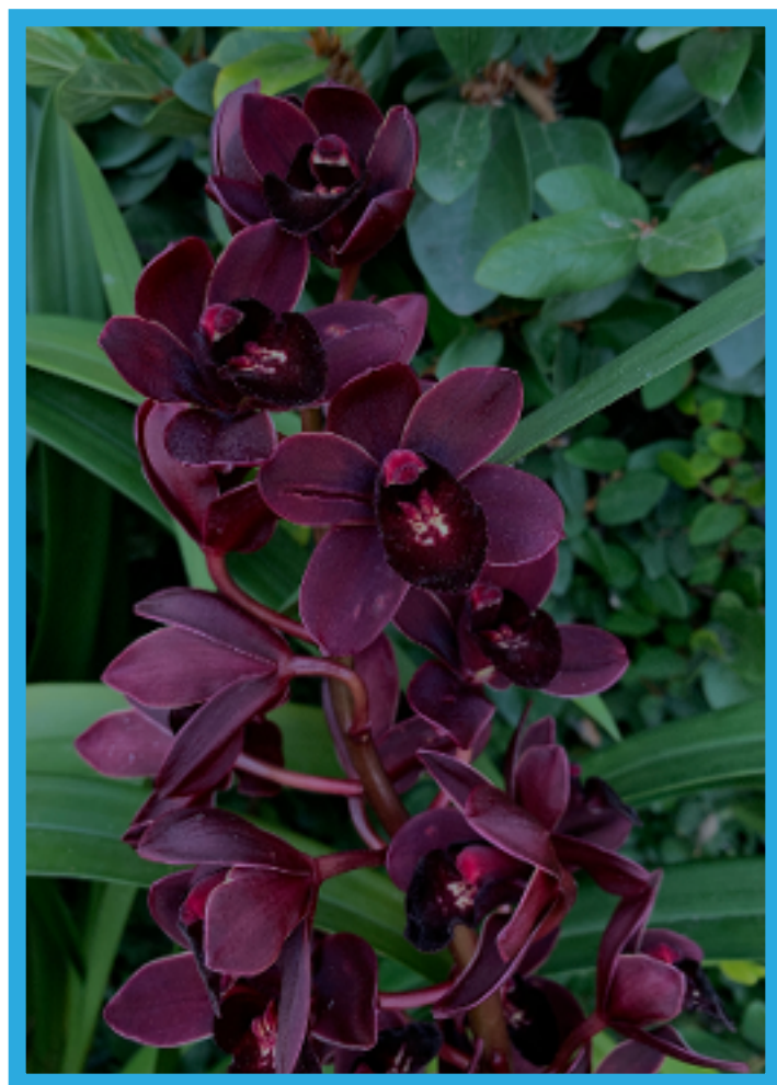
Cym. Radiant Ruby