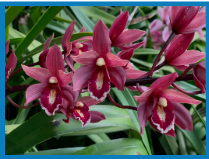
Cym. Canterbury 'Emma' HCC/AOS