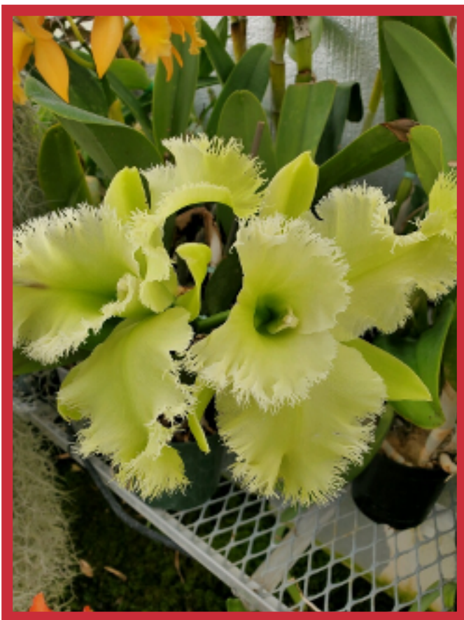
Rlc. Golf Green