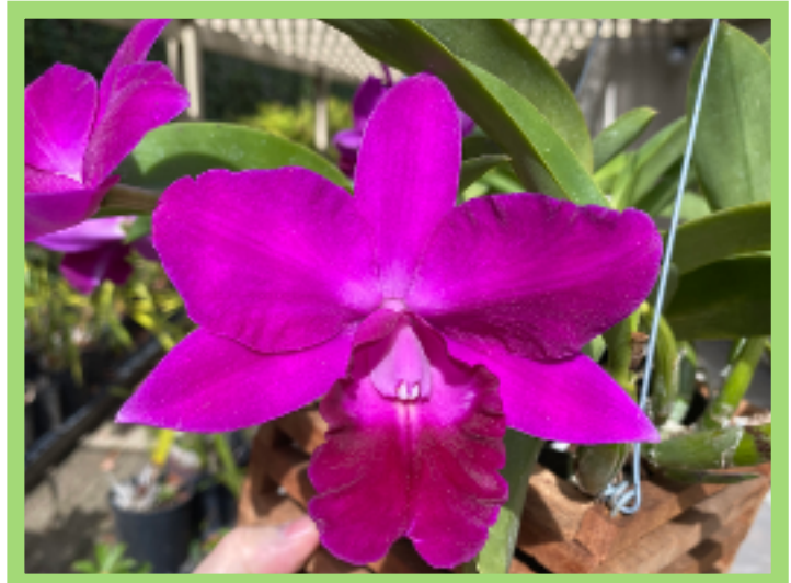
Lc. Mini Purple