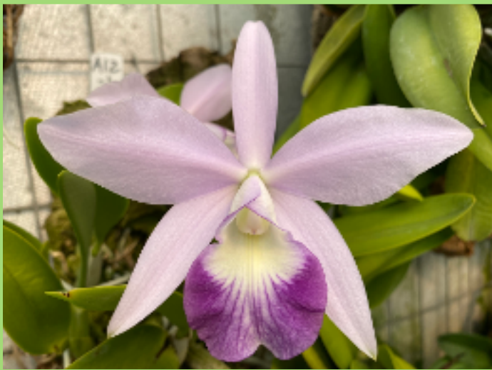
Lc. Love Knot var coerulea