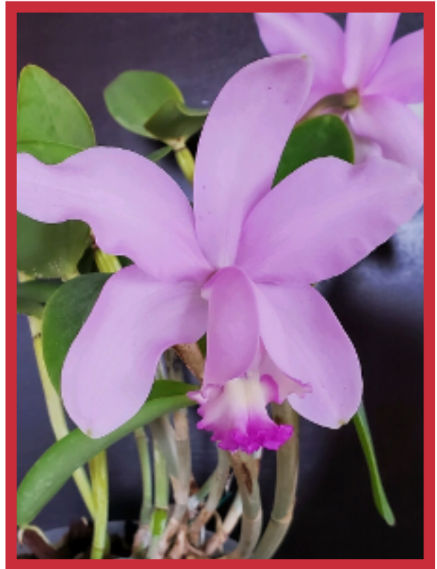
C. Claesiana (C. intermedia var aquinii x C. loddigesii)