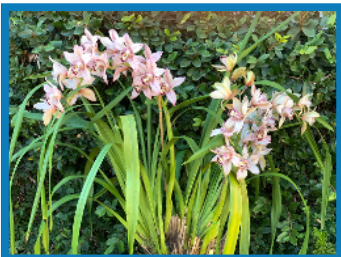
Cym. Samuari Hee-Haw with close up