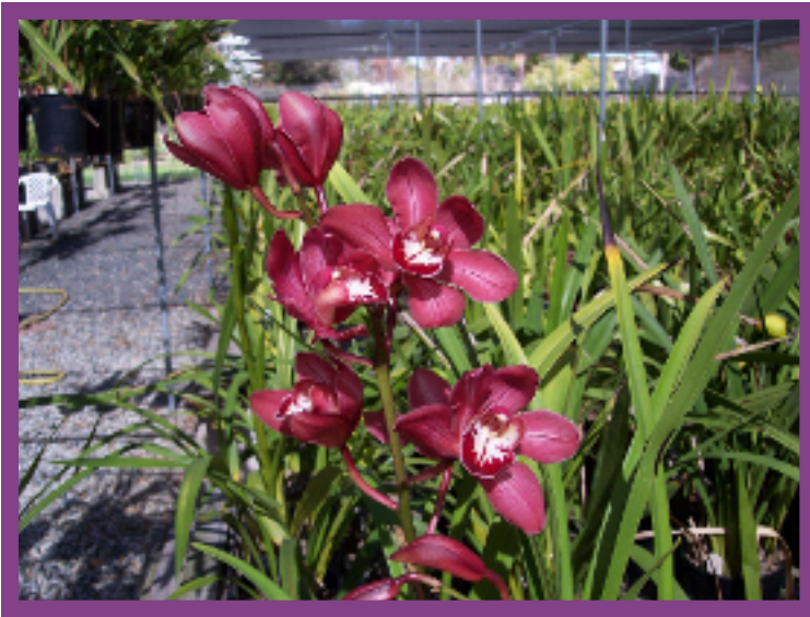
Cym. Red Beauty 'Évening Star'