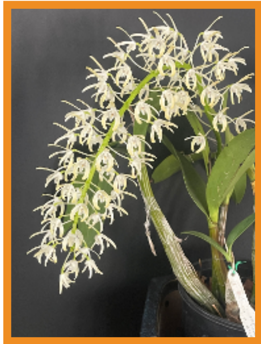
Den. speciosum var. grandiflora