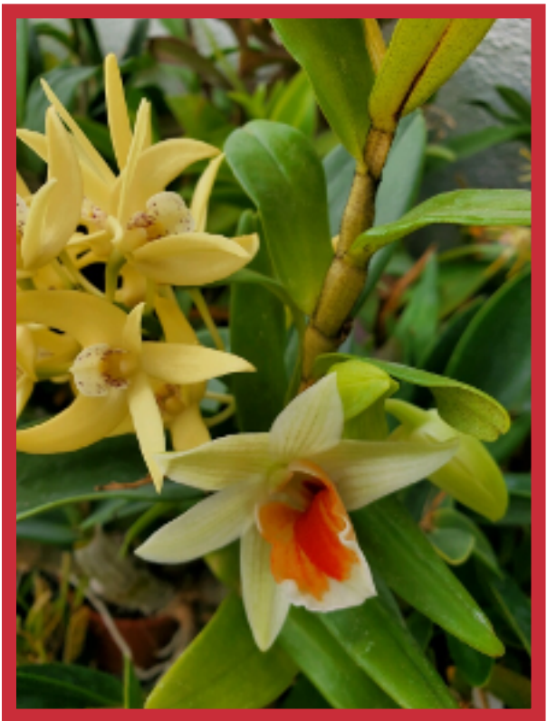
Den. Golden Vista 'SVO' x Den. Dunokala 'Tuyet' AM/AOS and Den. Green Lantern 'Red Carpet'