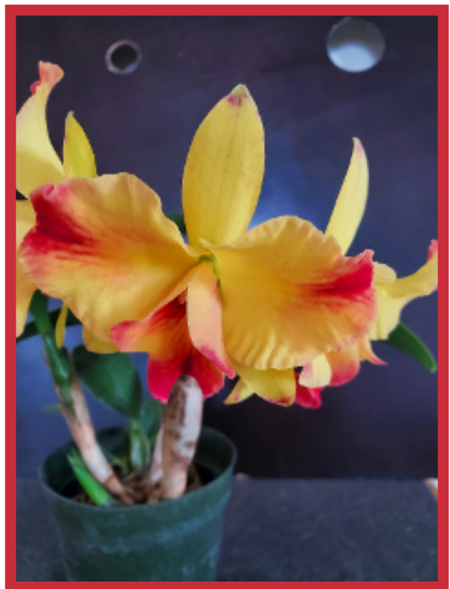
Slc. Angel's Fantasy 'Solar Flare' FCC/AOS X Pot. Mem. Jim Nickou 'James ' HCC/AOS