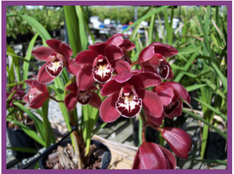
Cym. Street Hawk 'Çape Kidnapper''