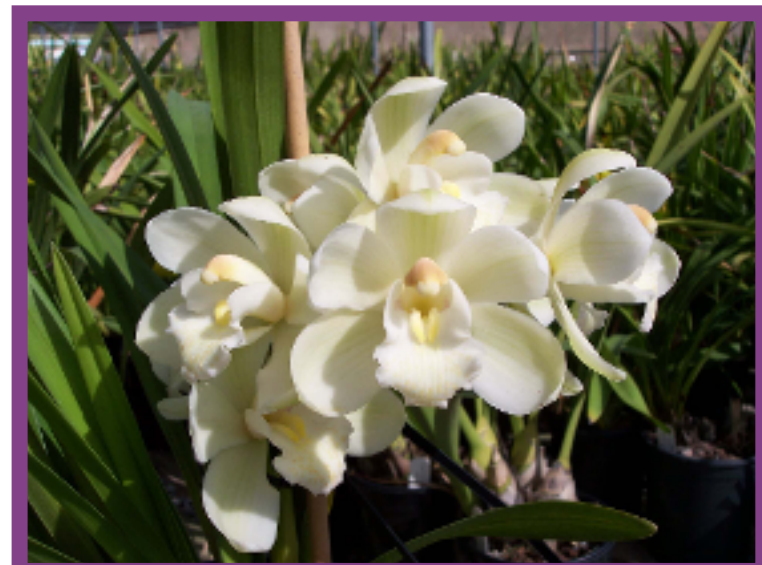
Cym. Pure Sarah 'Çarolyn'