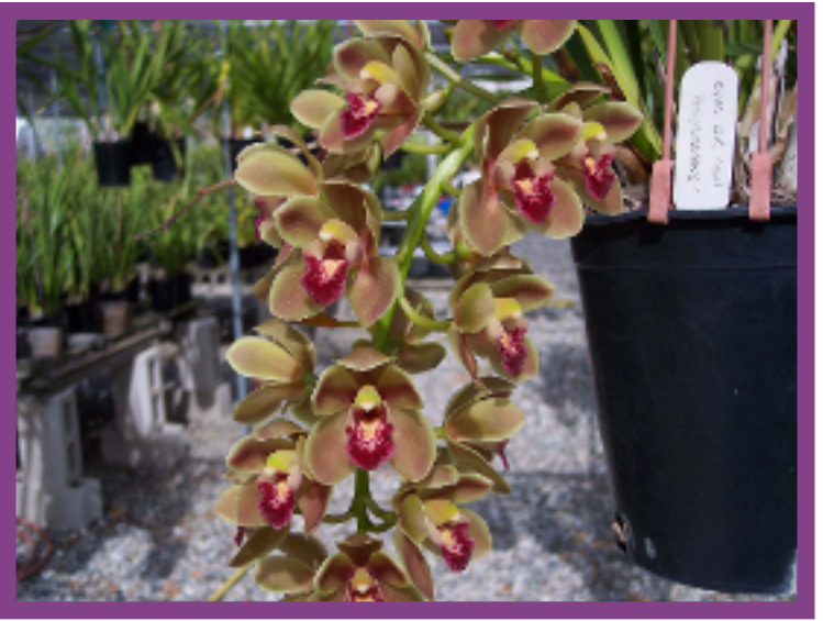
Cym. Dr. Len 'Geyserland'