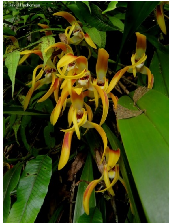
Huge Maxillaria luteograndiflora plant (orchid) flowering in situ during a botanical and ornithological exploration in Farallones de Cali National Park, Valle del Cauca department, Colombia.