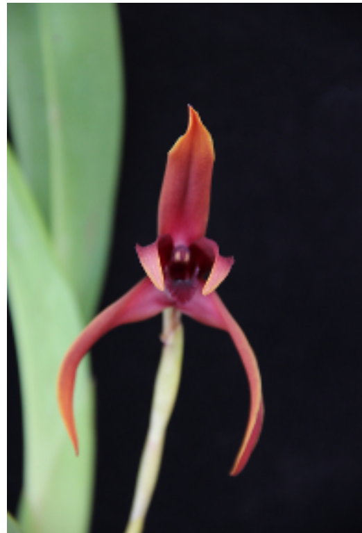
Maxillaria tonsbergii 'Smokey'