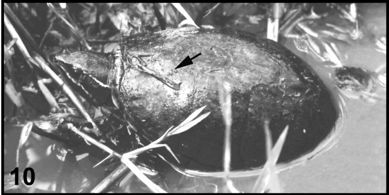
Figure 10 , “Stink-pot” turtle ( Sternotherus odoratus ). Raised areas on carapace (arrow) are temporarily dried algae ( Basycladia ).