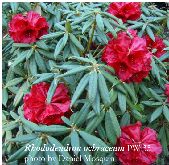
Rhododendron ochraceum PW 35

Only recently introduced from China, Rhododendron ochraceum is a species in the Maculifera subsection of section Barbata, closely related to the larger R. strigillosum . Like that species, R. ochraceum is a rounded, crimson-flowered shrub with recurved, sea-green leaves. Both species display a characteristically drooping leaf posture, and have bristly stems and petioles, but whereas the better known R. strigillosum is relatively glabrous under