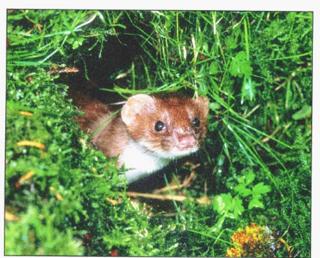
WEASEL Mustela nivalis