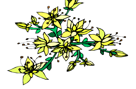
SANDATS BULLETIN DECEMBER 2003 PAGE 36

Members of SVNC could do worse than involve themselves in West Bromwich Town Council meetings when items affecting the Sandwell Valley are being discussed, or suggesting such items for discussion. With the requirements of Regional Planning Guidance to support them, the Council's support for the Black Country Urban Heritage Park to justify action, and the Regional Biodiversity Strategy to inform and guide such action, they might be able to progress nature conservation in the Valley and surrounding areas as never before. PRShirley.