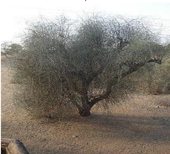
Figure-2. The general image of the plant of Capparis decidua

Decidua Capparis is a worthwhile herb in its periphery home. Its exceedingly spiced fruitlets are used to design fine root-vegetable, curries and gherkins and could welcome supportive frightening little animal; the herb is nearly pushed off in predominant pharmaceutical and phyto-treatment. Decidua Caparis can be castoff in field agribusiness, and re-forestation in semi leave and double-crossed locale; It passes on help in irregularity of earth obliteration. [5]