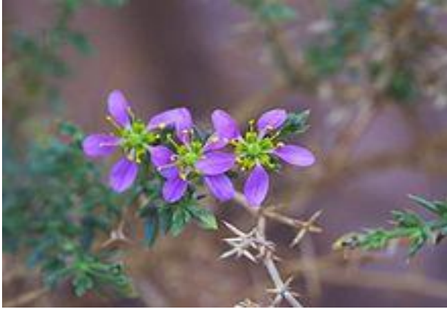
Figure-4. The general image of the plant of Fagonia Arabica .

Phagonia electronic items ought to be painstakingly assessed in light of the fact that there is practically zero confirmation for the species kept to, established on hereditary material examination. It might be because of the way that they all contain comparable Fagonic sp. , restorative blends, yet have not yet been perceived (2015). 2014 directed by one of the real colleges in the nation has set up that each of the 6 Pakistani foganic species is affirmed and not checked [10], they remained desirable in gainful yields in the Islamabad Fagonia advertise. Fundamental cautions of various plant species Fagonia and another outside issue, might be available in business arrangements.