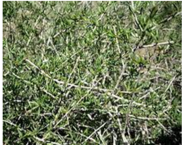
Figure-6. The general image of the plant of Pteropyrum olivieri

Pteropyrum is a variety of plants from the Polygonaceae family with around five species in western Asia. There has been a pteropyrum biogeochemical seek Olivieri, verdure Wadh proportion viewpoint zone soil-plant-shake. It is a local of the Iranian-Turan area that spreads to Saharan-Sindian Pakistan. P. Olivieri appropriation and some other co-natural greenery on lithology is likewise examined. The plant is various irregular regions that can be utilized to investigate new shrouded stores in and around the Wadh region. The stones in the anomalous territory filled in as a decent host for chromite and podiform mineralization related. The general picture of Prosopis cineraria plant (nearby name: Karwan Kush) appeared in Figure -6.