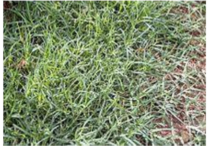
Figure-3. The general image of the plant of Cynodon dactylon

Cynodon dactylon , otherwise called starfish Vilfa [6] grass harshness, Dhoob, gramigna, DUBO, grass puppy teeth, Bahamas prairie, fiendish soul meadow, grass couch, Pakistan Doaba, Arugam-pul, grass, and field container is a Plant that induced in the Middle-East. [7]. despite the fact that not intrinsic to Bermuda, there is a far-reaching forceful kind. It should commit achieved North-America after Bermuda, ensuing in their mutual name. The general photo of the Cynodon dactylon plant (Local Name, Chadd) is given below in Figure-3