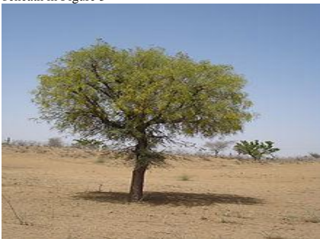
Figure-5. The general image of the plant of Prosopis cineraria

Prosopis cineraria is a sort of blooming plat of family Fabaceae. It is inalienable to desolate parts of West Asia and the subcontinent-Indian in addition to Afghanistan, Iran, India, Oman, Pakistan, Saudi Arabia, the UAE and Yemen. It is notable species set up in a few districts of South-east Asia, in addition to Indonesia. [11] Public forenames Arabic (Ghaf); [12] Khijri or "Loong tree" [13] (Rajestan); JAANTY (Bishnoi); Jond (Punjab); Kahour (Balochistan); Kande (Sindh); Bani/Shaaami (Kanada), Gandasien (Burma); Vannei (Tamel); Jami (Telugua); Chaunekra, [11] Janti-Janti, Khaar, [11] Khejri/Khejra, [11] Same, Shame (Marathe) and (Urdu) [14] Khejdo (Gujarati); Vannei-Andaraa, Street Andaara, Kalaapu andaara, LUNU Andaara (singalese). The general picture of Prosopis cineraria plant (nearby name: Babbur) appeared beneath in Figure 5