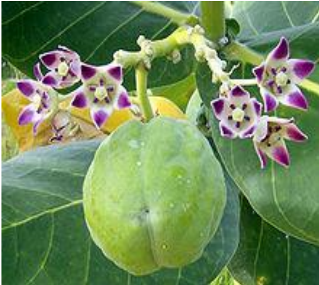
Figure-1. The general image of the plant of Calotropis procera