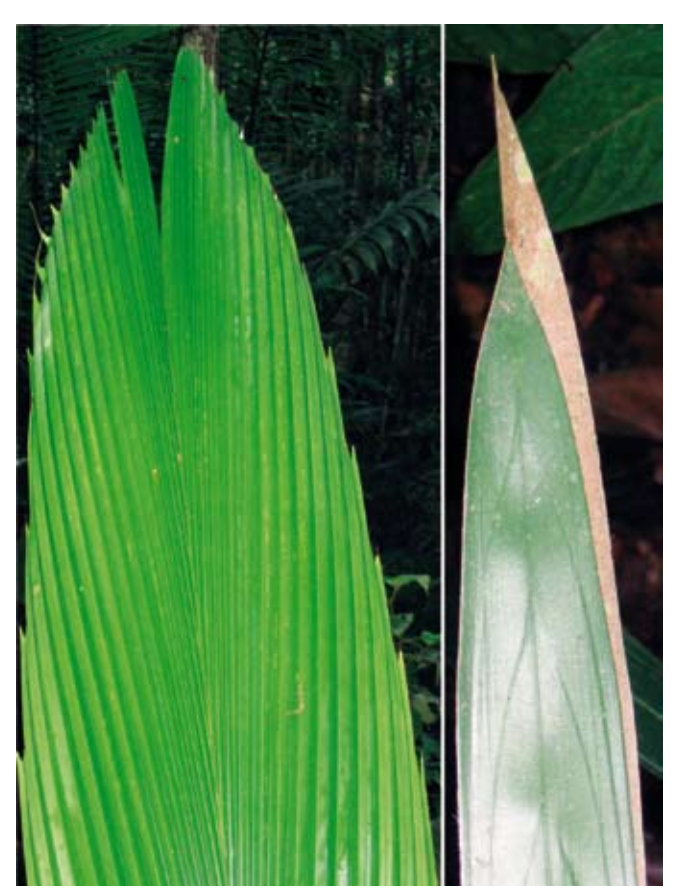
Figure 3. Leaf patterns. Left: toothed margin of eophyll ( Attalea ferruginea ); right: abaxial view of the asymmetrical pinnae apex with brownish lateral projection ( Attalea maripa ).

and maintain their differences in sympatry due to reproductive isolation, or 2) it is the same species which locally presents a polymorphism in the insertion of the staminate flowers. It is to be noted that while the A. polysticha morph is widespread, the A. sagotii morph is restricted to northeastern Amazonia.