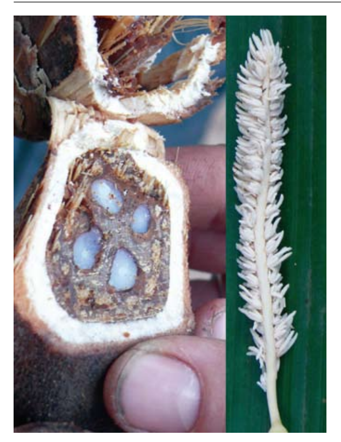
Figure 5. Attalea moorei. Left: transverse section of fruit showing the thick endocarp with a ring of conspicuous fiber clusters, and four seeds. Right: unilateral arrangement of staminate flowers on rachillae (Photos by Gloria Galeano).

merge when a large number of specimens are examined, so that the latter is better considered as a synonym. Attalea kewensis has been described in cultivation but some specimens from Peru match relatively well the type (Glassman, 1999).