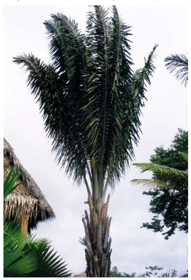
Figure 2. Attalea tessmannii, habit (north-eastern Peru)

This species is accepted by Henderson (1995) and also by Govaerts and Dransfield (2005). As mentioned above, Glassman (1999) considered A. microcarpa doubtful and instead recognized two species, A. polysticha and A. sagotii . These species differ in the arrangement of staminate flowers on the rachillae. In A. polysticha , staminate flowers are inserted all around the rachillae (fig. 8) while in A. sagotii , they are clearly unilateral. This distinction is known to be significant in many other groups of Attalea (Fig. 5-7) and has been widely used by Glassman (1999) to distinguish species and groups of species. The recent discovery of A. polysticha and A. sagotii growing almost sympatrically in French Guyana (de Granville, pers. com. and specimens at CAY) can be interpreted in two ways: 1) the two species are clearly distinct,