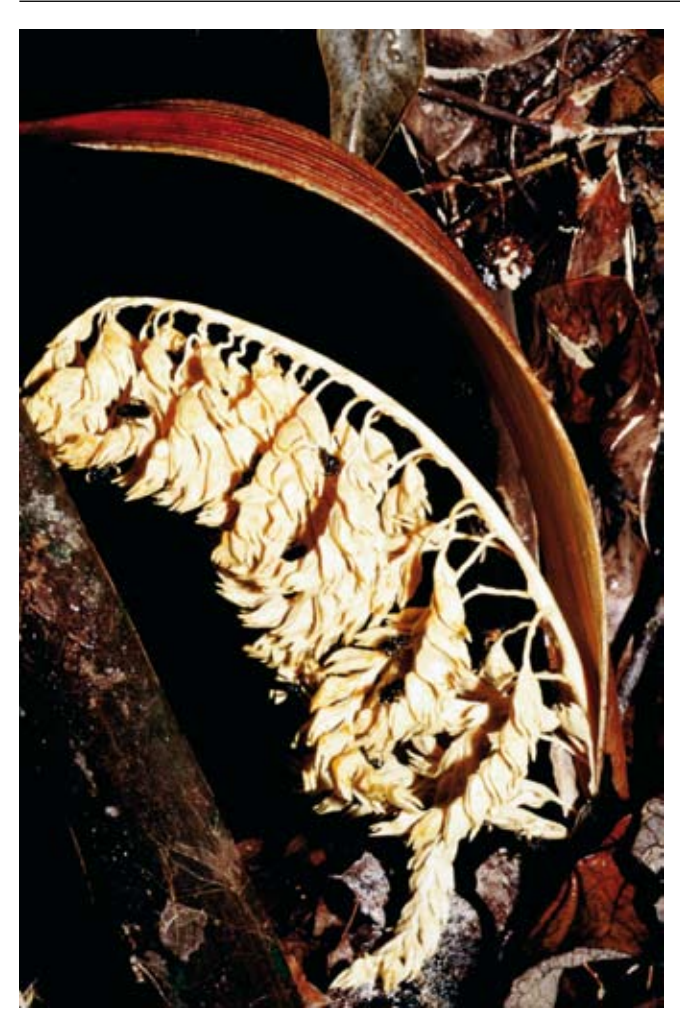
Figure 7. Attalea ferruginea. Staminate inflorescence showing unilateral arrangement of rachillae on rachis and of staminate flowers on rachillae.

South American, just reaching Panama (de Nevers, 1987) with two species, A. allenii and A. iguadummat . Two more species, A. amygdalina and A. nucifera grow in inter-Andean valleys of Colombia and A. colenda grows on the Pacific coast of southern Colombia and Ecuador.