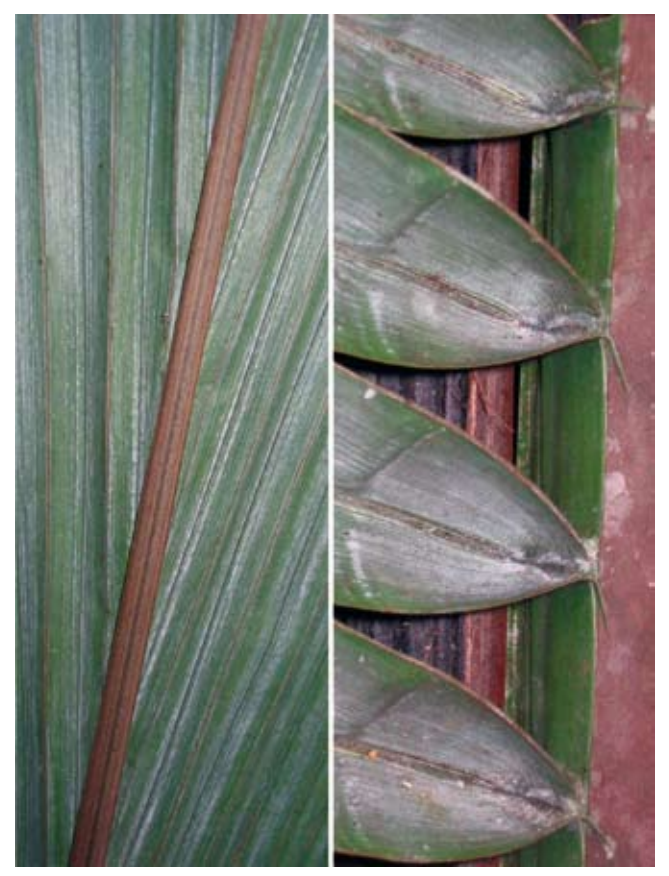
Figure 4. Leaf patterns. Left: whitish abaxial indument of Attalea tessmannii ; right: waxy-glaucous abaxial indument and spine-shaped auricle of pinnae of Attalea butyracea .

This group is defined by epetiolate leaves with very regularly arranged pinnae, these with a prominent spine-shaped auricle basally (Fig. 4), peduncular bract thin, staminate flowers spirally arranged on staminate rachillae and dispersed fibers within a thin endocarp (Fig. 6). All species of this group are tall-stemmed. Typical A. butyracea has small (4-5 cm long) fruits, turning yellow at maturity, with inconspicuous endocarp fibers, and with two seeds (Fig. 6), leaf segments are stiff, glossy green adaxially and waxy-glaucous abaxially (Fig. 4). A. macrocarpa is distinguished by larger fruits (8-9 cm long) and A. kewensis has very short staminate petals. Characters of A. butyracea and A. magdalenica