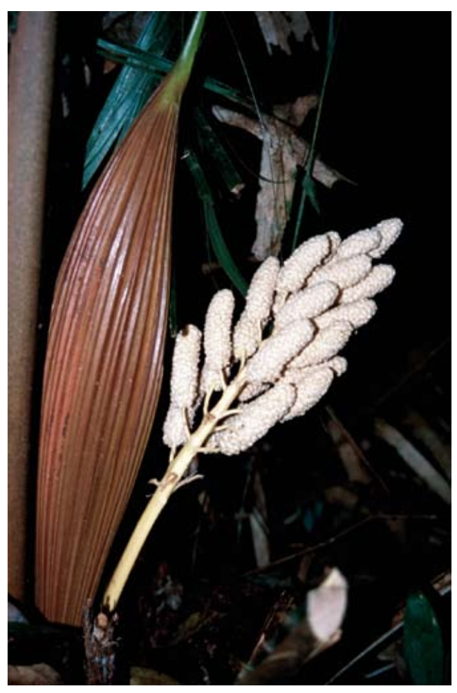
Figure 8. Attalea polysticha. Staminate inflorescence showing spirally arranged rachillae and staminate flowers.