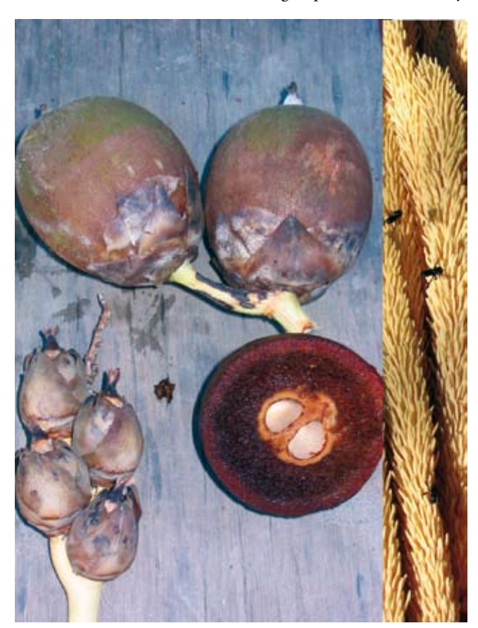
Figure 6. Attalea butyracea. Left: pistillate flowers, fruits and transverse section of fruit showing the thin endocarp with few, dispersed fibers, and two seed cavities. Right: spirally arranged staminate flowers on rachillae

This group is mostly diversified in southeastern Brazil (especially Bahia), and to a lesser extent in Central Brazil, with only three, not problematic species in the Amazon forest ( A. ferruginea = A. racemosa, A. septuagenata and A. tessmannii ). Contrary to the Scheelea and Orbignya groups which reach southern Mexico and the Caribbean, the Attalea sensu stricto group is almost exclusively