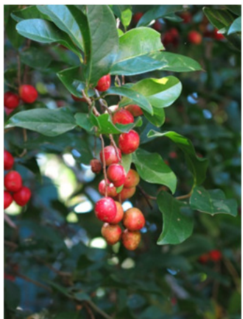
Breynia stipitata (fart bush)