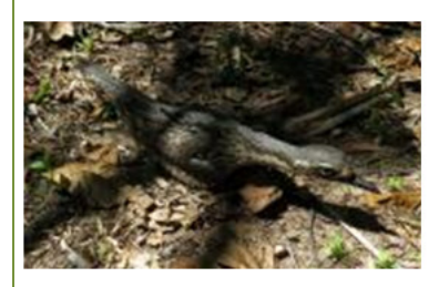
Pretending to be a stick - bush stone-curlew at Bramston Beach

It was a good day for birding: Three Beach Stone Curlews frolicked along the waterline, and we almost stood on a pair of Bush Stone Curlews stretched out on the ground leaf litter, their cryptic colouring and the dappled light rendering them almost invisible.