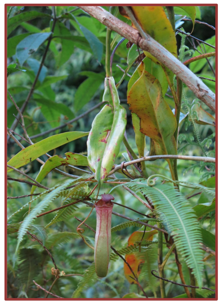
Nepenthes mirabilis with red and green pitchers, clambering over roadside regrowth.

After lunch we drove to the northern end of the road, waded the surprisingly deep North Bramston Creek (no crocs visible today!) and explored the ancient rocks along the mangrove fringed shoreline. A steep granite tor rises sheer from the beach and supports a strong population of trees, shrubs and epiphytes with a