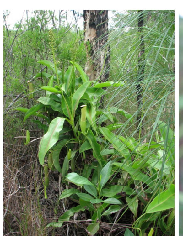
bromeliads also manage to trap Wild Nepenthes mirabilis with green pitchers.