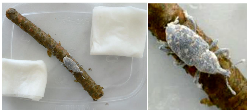
Figure 3. Adult of pine weevil infected by Beauveria bassiana