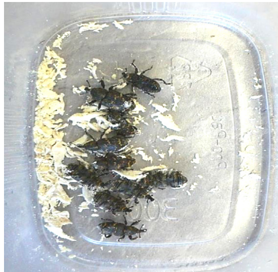
Figure 1. Dry infection of pine weevils

Food in Petri dishes was supplemented at regular intervals from 7 to 10 days. This food was registered, we also measured the surface area (in mm 2 ) and evaluated the size of nibbled area. The results were evaluated according to the type of infection and in the second experiment by gender of pine weevils.