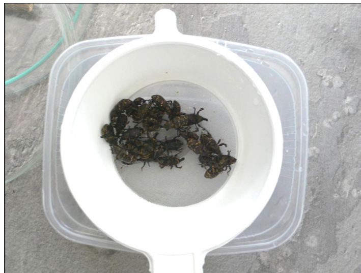
Figure 2. Wet infection of pine weevils in the liquid suspension