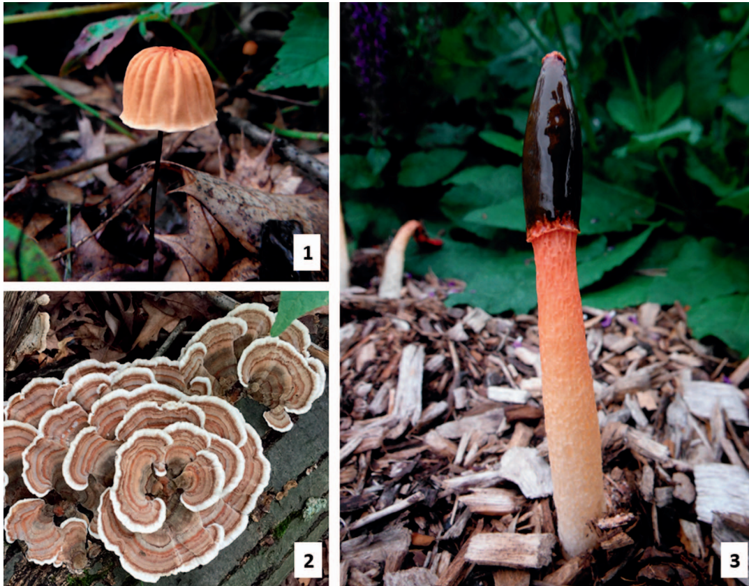
Figure 1–3.—Indiana macrofungi. A wide range of fungal diversity can be found within the state of Indiana, including macroscopic fruiting bodies recognizable as (1) mushrooms ( Marasmius sp.), (2) turkey-tail fungi ( Trametes sp.), and (3) stink horns ( Mutinus sp.).

is being made available online through the MyCoPortal ( http://mycoportal.org , see the Macrofungi of North America: Regions research checklist page), and will be updated regularly as more data become available.