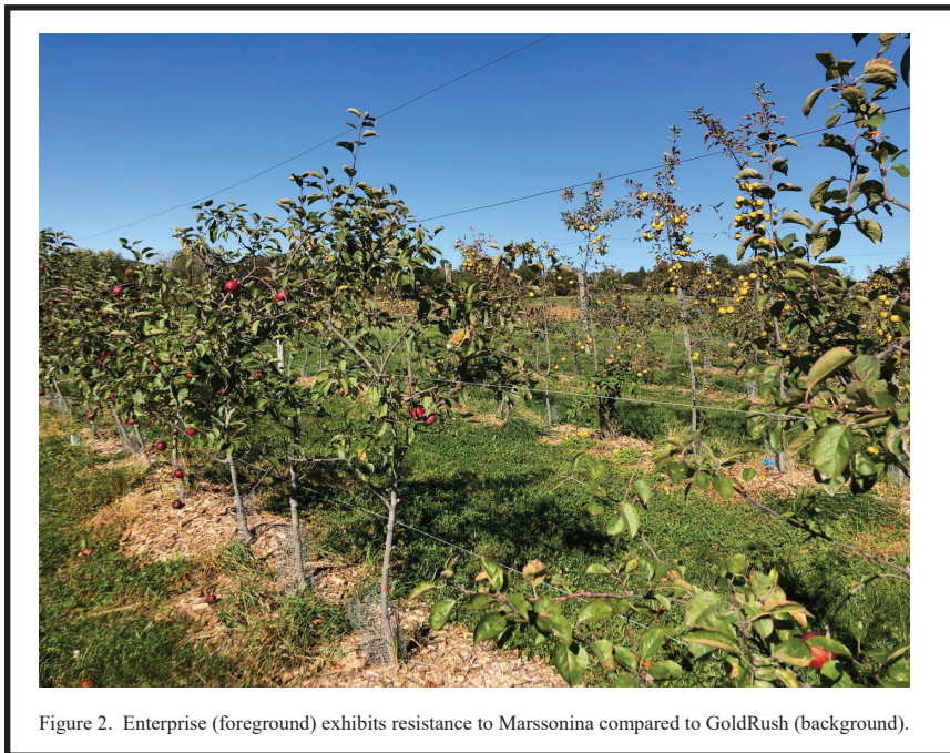
Figure 2. Enterprise (foreground) exhibits resistance to Marssonina compared to GoldRush (background).

GoldRush is a commercially available scab resistant apple variety bred by the Purdue-Rutgers-Illinois (PRI) apple disease resistant breeding program (Janick 2006). In addition to field immunity to apple scab, GoldRush exhibits high resistance to powdery mildew and is moderately resistant to fireblight. It also stores extremely well, (Crosby et. al. 1994a). Goldrush develops optimum flavor/sugars after 4-6 weeks in cold storage. It maintains its flavor and texture for 10-11 months. Quality