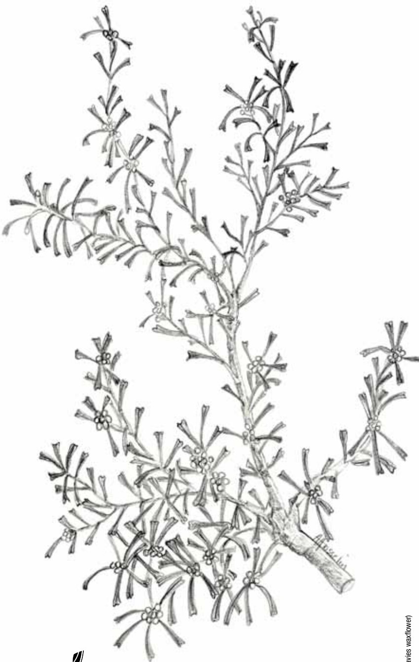
Phorbolium davisii (davis waxflower)

An extensive listing of suitable species can be found on the NRM North and Understorey Network websites.