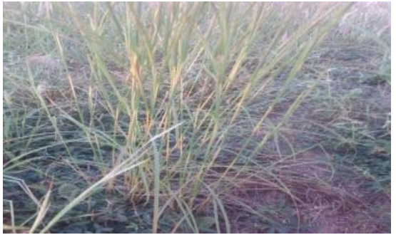
Andropogon gayanus (Kunth)