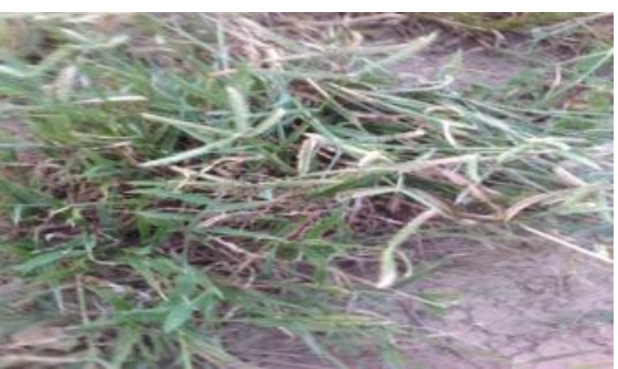
Dactyloctenium aegyptium (L.)