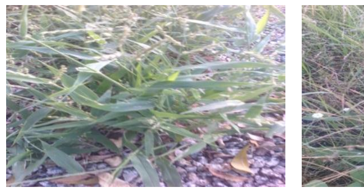
Leersia hexandra (Sw). Panicum maximum (Jacq) Figure 3: The Pictures of some Poaceae Species in their Natural Environment.