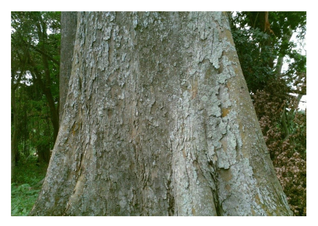
Figure 4. Sound T. scleroxylon of 1.86 m DBH