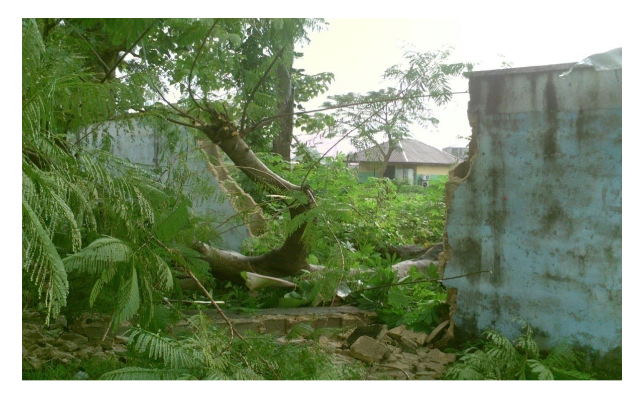
Figure 1. Pests infested Delonix regia damaging the University of Port Harcourt fence.

Obeche, Triplochiton scleroxylon (Family: Sterculiaceae) also known as Arere (Yoruba, Nigeria) is an environmentally and economically important African tropical tree and it was a successful plantation tree species in Nigeria. Obeche has moderately adequate broad leaf structure and specialty stem characters such as self pruned cylindrical bole of 30 m [1], good anchorage buttress of 6 m and trunk diameter of 1.5 m [2]. The timber is naturally widely distributed in its range with recognized three sections: from Sierra Leone to Togo, from the Benin Republic to Nigeria and from Cameroun to Zaire [1].