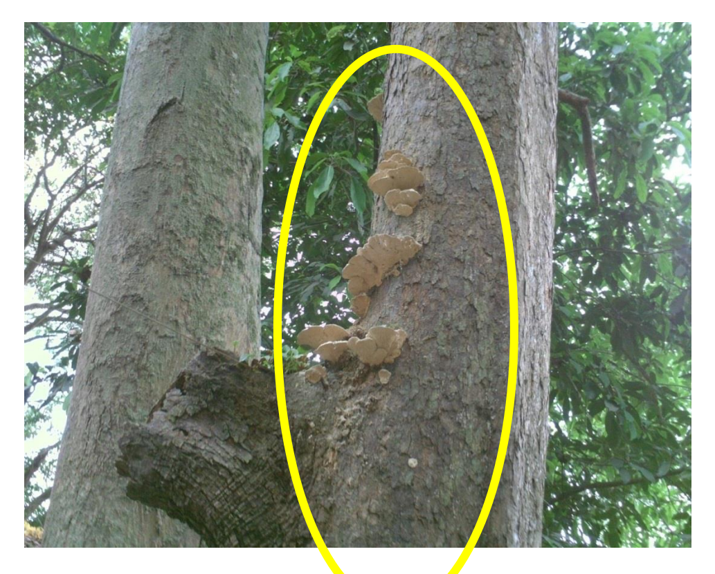
Figure 5. Sound Triplochiton scleroxylon and funct decayed Holarrhena floribunda closely standing