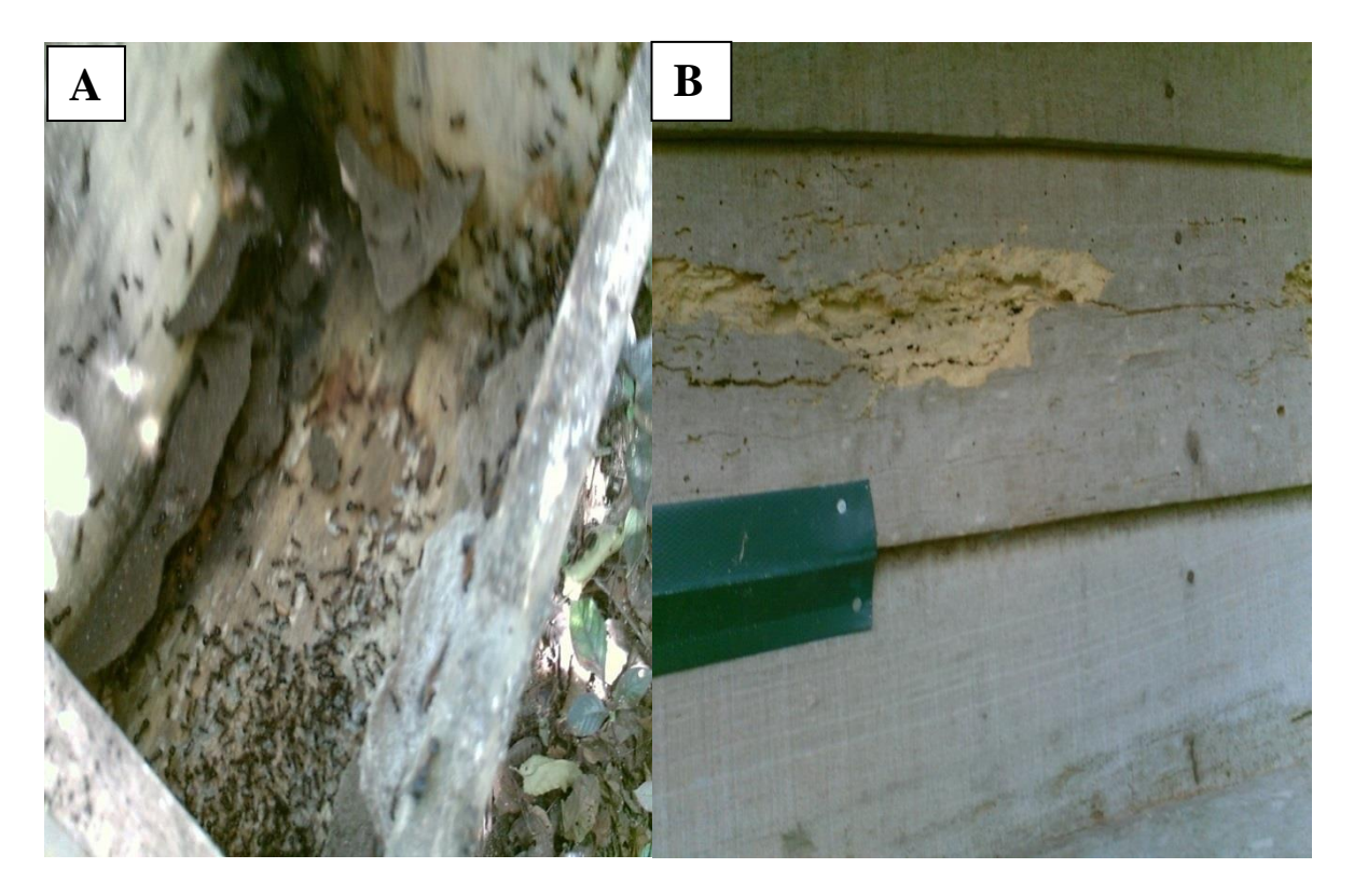
Figure 2. Honeybee's Hive (A) and food canteen stall (B) attacked by carpenter ants and powder post beetles, respectively.