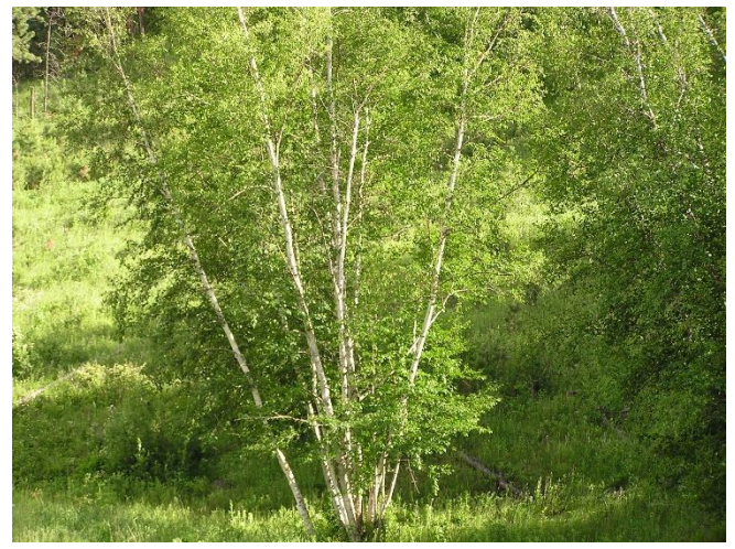
Betula papyrifera, Custer Co., SD