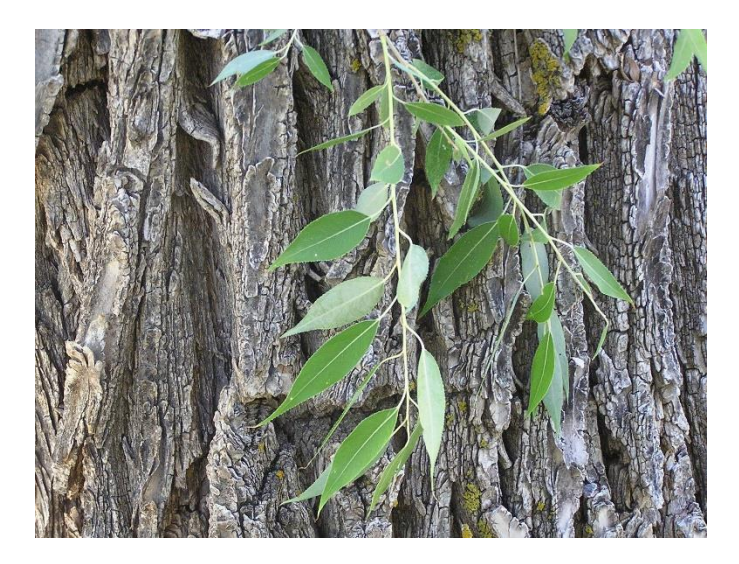
Salix amygdaloides, Goshen Co.