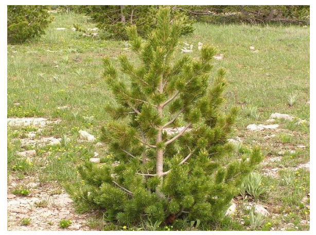
Pinus flexilis, Albany Co.

Pseudotsuga menziesii , Douglasfir, is a fast growing, evergreen tree, cone-shaped when young but becoming more irregular and open with age. They can reach 70 feet or more high and 30 feet wide but are