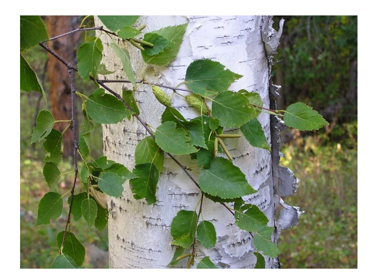
Betula papyrifera, Crook Co.

Pinus flexilis, Limber Pine, is a slow growing, longlived, evergreen tree that can reach 80 feet tall and 30 feet wide but is usually much smaller. The leaves are needle-like in clusters of 5 and to 2.5 inches long. The female cones are very resinous and to 8 inches long. The plants occur naturally on dryish, often wind swept and rocky ridges and slopes from rocky outcrops on the plains to subalpine areas in the mountains. They prefer moist to dry, open areas and are tolerant of drought, wind, cold, and heat. They are a good candidate for bonsai culture. It can be grown from seed which is best cold stratified for 21 to 90 days before planting. Barely cover with soil. Small trees can be transplanted. The foothills ecotype will do best at our lower elevations. There are many cultivars in the nursery trade.