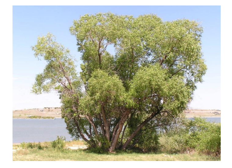
Salix amygdaloides, Platte Co.