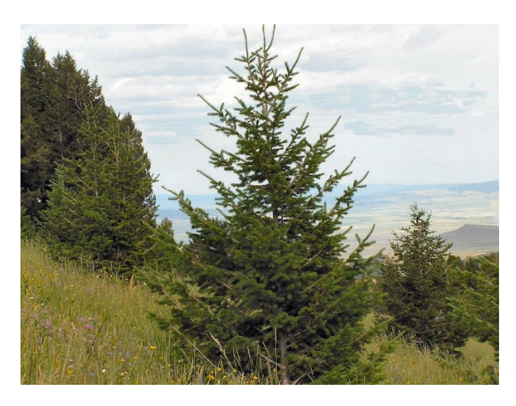
Pseudotsuga menziesii, Meagher Co., MT

usually much smaller. The leaves are linear, flattened, blunt at the tip, to 1.5 inches long, and borne singly along the branches similar to a fir tree. The female cones are to 3 inches long with 3-lobed bracts protruding from the cone scales. They occur naturally on dry, often rocky slopes and ridges in the mountains. They prefer a well-drained site in full sun or part shade. They are drought and wind tolerant but are best grown on a north-facing exposure. At lower elevations they may be subject to winter sun burn and pests like gall aphids, tussock moths, and needle scale. It is an alternate host for spruce gall aphid so spruce and Douglasfir should not be planted in close proximity. It can be grown from fresh seed barely covered with soil. For spring sowing, cold stratify the seed for at least 60 days. There are many cultivars in the nursery trade.