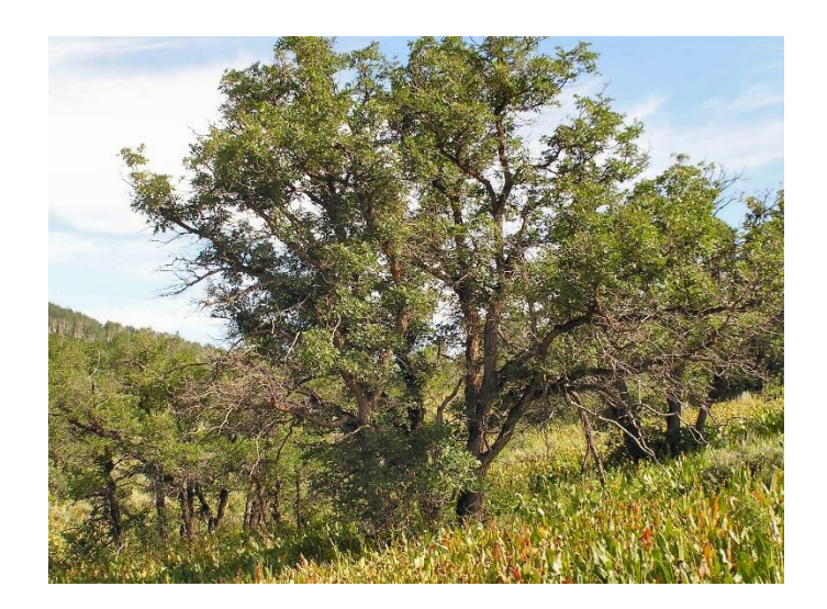
Quercus gambelii, Carbon Co.

Quercus gambelii , Gambel Oak, is a slow growing deciduous tree (may be shrub-like) to 20 feet tall and as wide. It tends to sucker and form thickets. The leaves are lobed like typical oak leaves and to 6 inches long. They turn yellow, orange, or red in the fall. The flowers are inconspicuous appearing in March and April. The fruit is an acorn about 0.5 inch across. The plants occur naturally in Wyoming mostly on the west slope of the Sierra Madre Mountains in Carbon County. They prefer moist to dry, open or partly shaded areas. They are tolerant of wind and some drought. It can be grown from the acorn planted half an inch deep outside in the fall. It is difficult to transplant. It is also in the nursery trade.