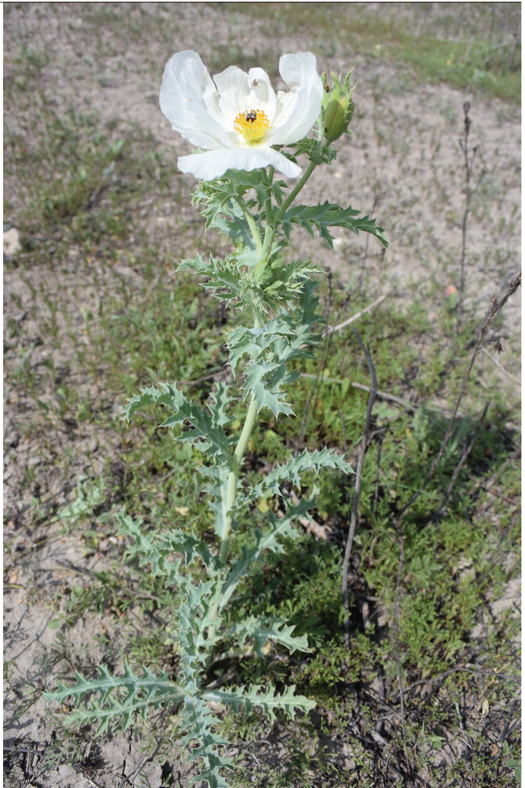
Figure 1. Photo of Argemone platyceras taken in Oaxaca, Mexico in May 2015. Glaucous leaves and prickles are clearly visible. Latex exudes from any damaged shoot tissue, including both vegetative and reproductive structures.

to pupation, pupal and adult mass, and time to emergence), we have a comprehensive measure of herbivore fitness (Kariyat & Portman 2016). Because chemical metabolite concentrations tend to vary within plants consistent with the fitness value and likelihood of attack of tissues, as predicted by the Optimal Defense Theory (McCall & Fordyce 2010), we also tested whether chemical extracts from leaves, roots, and seeds differed in their effects on caterpillar fitness. Damage to seeds are likely to have the greatest fitness consequences, and are likely to be tar-