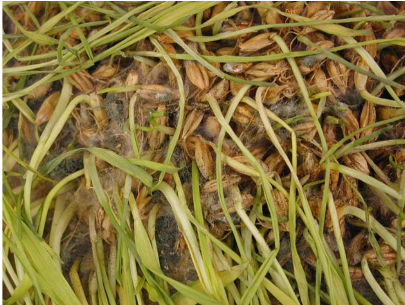
Aspergillus clavatus infecting sprouted barley