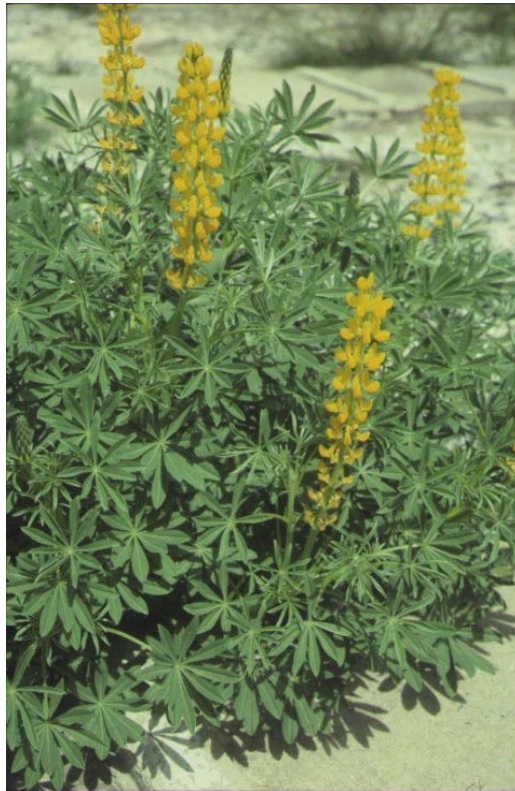
Lupinus spp. : L. cosentinii (Western Australian blue or sandplain lupin) (top left); L. angustifolius (New Zealand blue lupin) (top right); L. luteus (yellow lupin) (below)