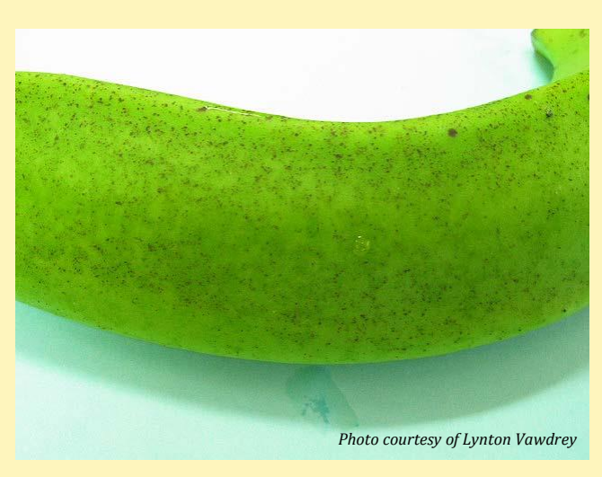
Figure 4. Damage on banana fruit caused by spraying Folicur® + oil