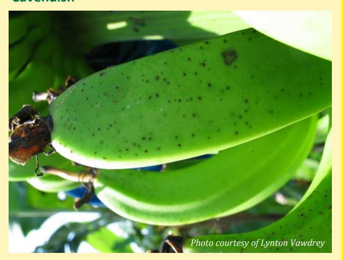
Figure 3. Damage on banana fruit caused by spraying Tilt* + oil