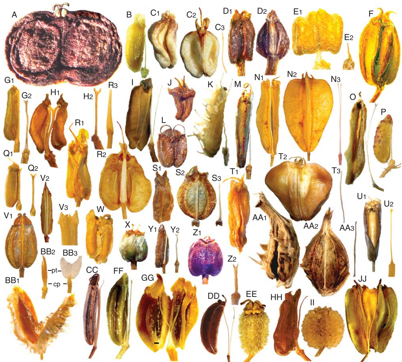
FIG. 1. Fruits of representatives of Apiaceae showing the shape and type of carpophore: in lateral view in A, B, C1 D1, E1, F1, G1, G2, H1, H2, I, M, N1, O, P, Q1, Q2, R, T1, U1, V, W1, X, Y, Z1, AA1, AA2, BB1, CC1–CC3 and DD–JJ, and in commissural view in C2, C3, R2, R3, S2, S3, W2, W3, BB2 and BB3. (A) Mackinlaya confusa . (B) Asteriscium aemocarpon . (C1–C3) Azorella compacta . (D) Bolax gummifera . (E1, E2) Bowlesia incana . (F) Dichosciadium ranunculaceum . (G1, G2) Dickinsia hydrocotylodes . (H1, H2) Diplaspis hydrocotyle . (I) Diposis saniculaefolia . (J) Domeykoa amplexicaulis . (K) Drusa oppositifolia . (L) Eremocharis triradiata . (M) Gymnophyton polycephalum . (N1–N3) G. isatidicarpum . (O) G. robustum . (P) Homalocarpus dichotomus . (Q1, Q2) Huanaca acaulis . (R1–R3) Hermas villosa . (S1–S3) Klotzschia glaviozii . (T1–T3) Laretia acaulis . (U1, U2) Mulinum spinosum . (V1–V3) Oschatzia cuneifolia . (W) Pozoa volcanica . (X) Schizeilema ranunculus . (Y1, Y2) Spananthe paniculata . (Z1, Z2) Stilbocarpa lyallii . (AA1–AA3) Arctopus echinatus . (BB1–BB3) Choritaenia capensis . (CC) Annesorhiza altiscapa . (DD) Bupleurum mundii . (EE) Dipolophium buchananii . (FF) Foeniculum vulgare . (GG) Heteromorpha involucrata . (HH) Lichtenisteinia trifida . (II) Phlyctidocarpa flava . (JJ) Polemanniopsis marlothii . Abbreviations: cp, carpophore; pt, parenchyma tissue. Scale bars = 0.4 mm in V3, 3 mm in others.

Group A. Carpophore absent; ventral vascular bundles as long as mericarps, arranged on opposite sides of the commissural plane (Fig. 3A)