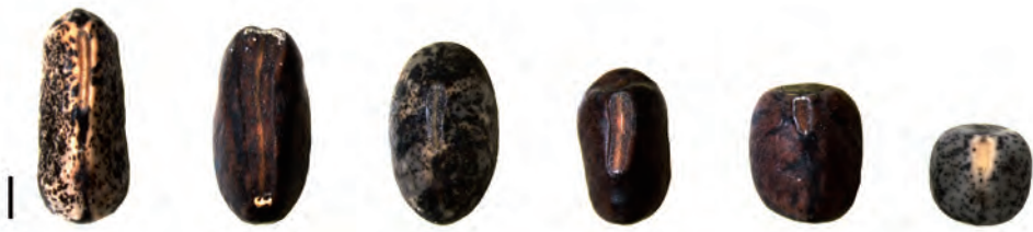
Fig. 2.- Ventral view of seeds from: a. Vicia voggenreiteriana [ULP/SRC-618]; b. Vicia scandens [ULP/SRC-611]; c. Vicia vulcanorum [ULP/SRC-614]; d. Vicia nataliae [ULP/SRC-617]; e. Vicia cirrhosa [ULP/SRC-609] & f. Vicia filicaulis [TFMC/PV-6471]. Scale bar: 1 mm.

In the last decades seed characters have been evaluated in Vicia for identification purposes and several keys for determination of the species have been proposed, mainly on a regional basis (Gunn, 1971; Perrino et al. , 1984; Chernoff et al. , 1992). Because of this, during the preparatory work for the description of V. vulcanorum external seed characteristics of all available accessions of the genus Vicia in the ULP/SRF were studied following Lersten & Gunn (1982).