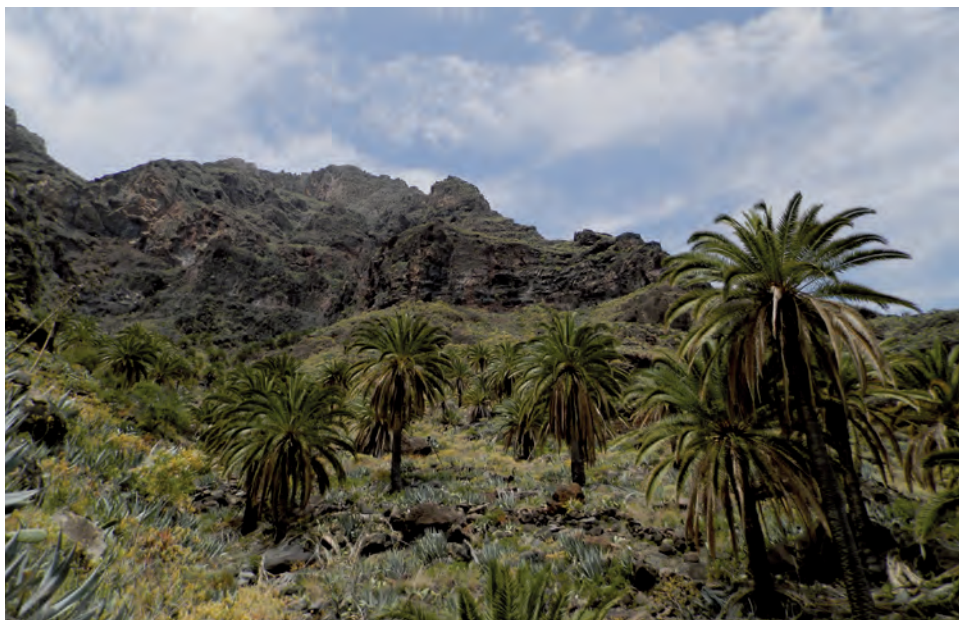
Fig. 1.- General view of type locality of Vicia voggenreiteriana . In the background, the cliffs of La Galga and Palochirme on whose foothills the new species has been discovered. Foreground, Phoenix canariensis .

During the field work in the island of La Gomera for the ‘Seguimiento de Poblaciones de Especies Amenazadas (SEGA)’ project, a sample of seeds of Vicia were collected in the spring of 2010 by R. Mesa in the cliffs of La Galga, Alajeró (Fig. 1), where is confined a relict population of the Canarian endemic species Dorycnium eriophthalmum Webb & Berthel. (Mesa, 2010). In order to preserve them for further studies, these seeds were stored in the Seed Reference Collection of the University of Las Palmas de Gran Canaria (ULP/SRC).