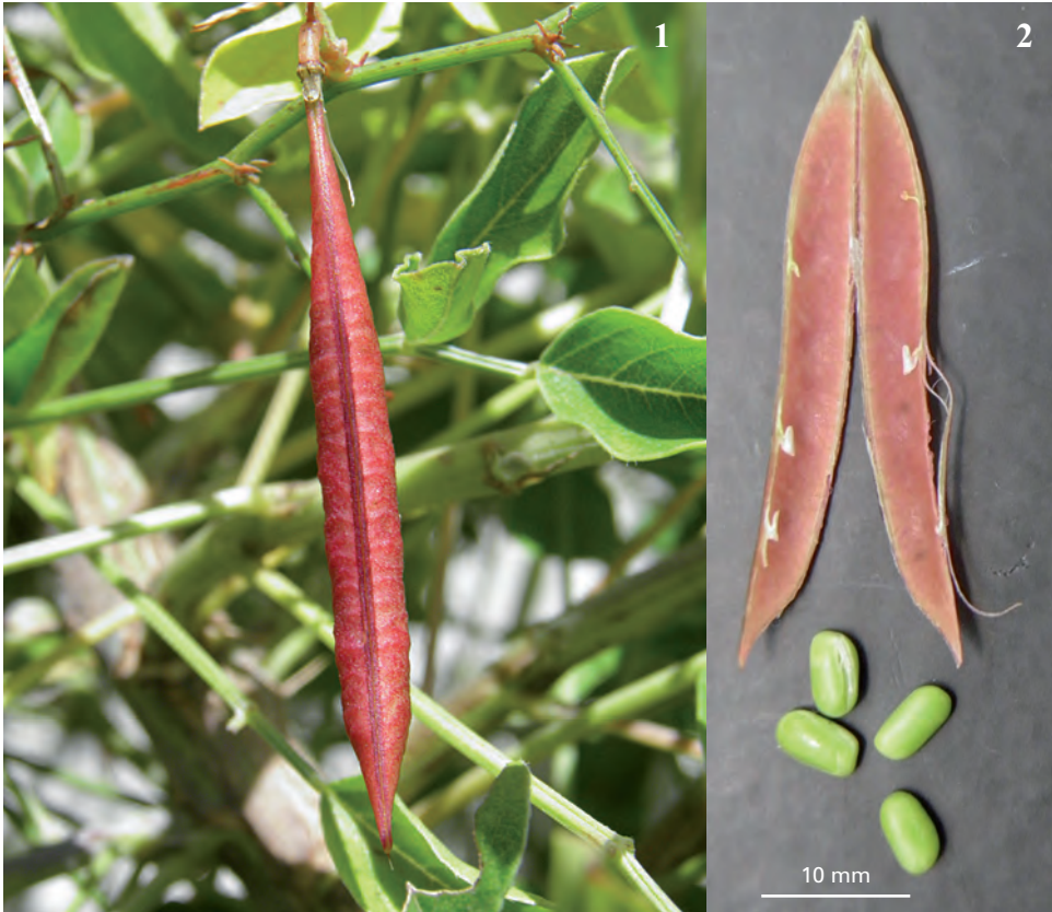
Fig. 5.- Legume characteristics in Vicia voggenreiteriana 1. Fresh legume in the field showing the red outer surface of the valves and the deeply pigmented suture. 2. Inner surface of the valves and immature seeds.

dehiscence, with (3-) 4-6 seeds, not compressed with each other. Seeds (sub)rhombohedral, smooth, grey and ivory marble and densely mottled with black dots and spots, 3.9-5.5 (-6) mm long, 2.7-3.4 mm wide, 2-2.7 mm thick; hilum linear (5 to 8 times longer than wide), slightly wedge shaped, 1.8-2.5 long, extending 1/5-1/7 of the seed circumference, with nearly parallel margins and a discolored area surrounding it; lens inconspicuous, with raised center about (1-) 1.1-1.8 mm from hilum.