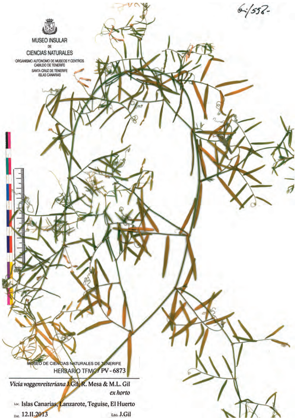
Fig. 3.- Habit of Vicia voggenreiteriana [ex horto El Huerto, Villa de Teguis, Lanzarote, Canary Islands, 12.II.2013, J. Gil 6873 and Dupl. (TFMC/PV)]. Scale bar: 10 cm.