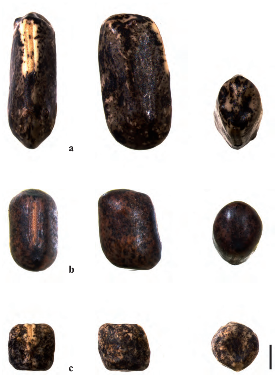
Fig. 7.- Ventral, lateral and zenithal views of seeds from: a. Vicia voggenreiteriana [TFMC/PV-6872]; b. Vicia nataliae [ULP/SRC-621]; c. Vicia cirrhosa [ULP/SRC-620]. Scale bar: 1 mm.