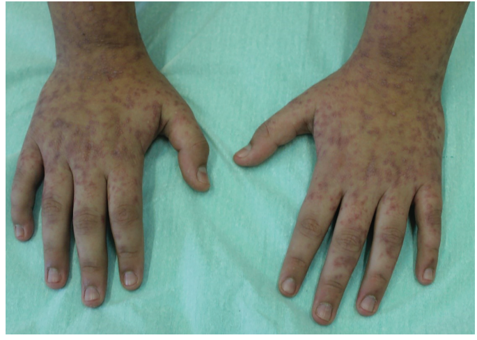
Figure 1 | Exanthematous lichen planus. Diffusely scattered violaceous papules with overlying silver scale coalescing into plaques on the upper extremities.