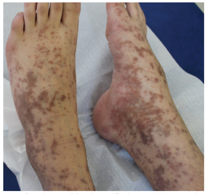
Figure 2 | Exanthematous lichen planus. Diffusely scattered violaceous to hyperpigmented papules coalescing into plaques on the lower extremities.