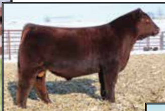
SULL Premium Reward 5087