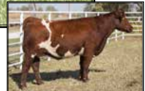
SS Revival 934