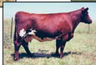
Elbee Bessie F120, Grandam of Lots 1-1d.

1c TRN PREMIUM FOXY 82 ET 4257290 4/10/2017 Heifer RWM Polled 82