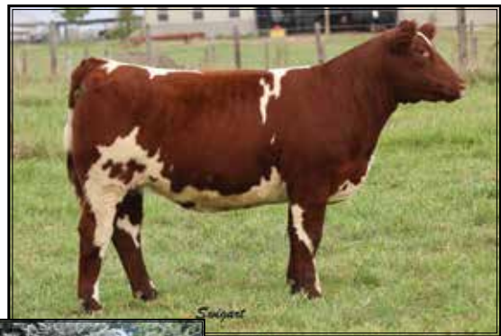
K-Kim Meg 270N ET, dam of Lots 36 & 37.