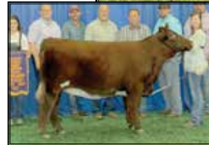
GCC MCC Simple Margie 61, Reserve Grand Champion Female, 2015 Kentucky State Fair Open Show and Grand in Junior Show. Dam of Lot 3a.