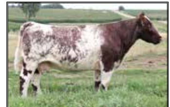
K-Kim Foxy 29S, Dam of Lots 1-1d.