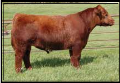
KL Primetime Paymaster