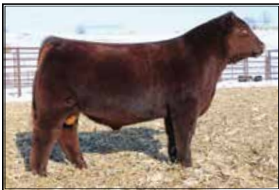
SULL Premium Reward

Consignor: Greenhorn Cattle Company & Bedwell Group