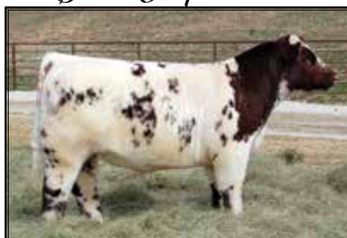
SULL Roan Blast