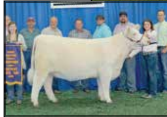
GCC HSC Margie Asset 60, Supreme Champion Female 2015 Southern Kentucky District Show. Daughter of Margie 610S. Grand Champion Female Kentucky State Fair, Open Show & Reserve in Junior Show. Dam of Lot 3.