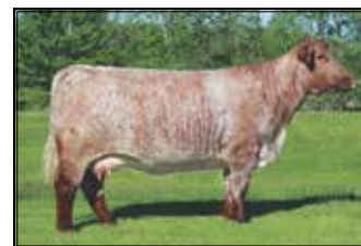
RL Sonny Charm 7102 - Reserve Grand Champion Female, 2007 NAILE. Dam of Lots 14-14a.