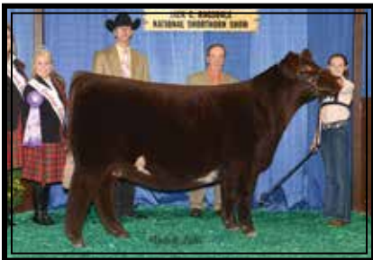
SULL Roses Are Red, Full sister to Lot 7.