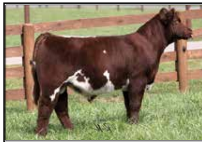
GCC TRN Chicago 746 ET, Reserve Grand Champion, 2017 Ohio State Fair Regional Show. Full brother to Lots 1. Keep an eye on Chicago this fall and winter.