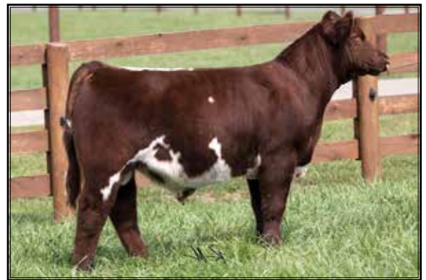
GCC TRN Chicago 746 ET Reserve Grand Champion, 2017 Ohio State Fair Regional Show. Full brother to Lots 1. Keep an eye on Chicago this fall and winter.