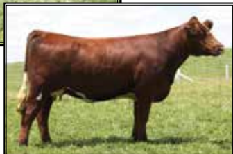
CF Cumberland 186 Dam of Lot 16.