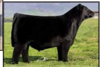
GCC Margie's Best 610 ET, 2015 Ohio State Fair Regional PACE Show Reserve Grand Champion. Dam of Lot 4-4a.