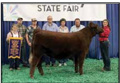
MFF Cumberland 91, Reserve Champion Kentucky owned. Congrats to Willams Family.