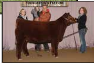
SB GCC CH Charming, 2014 Reserve Champion Shorthorn.

Consignor: Greenhorn Cattle Company, Hamilton Farms & Venture Show Cattle