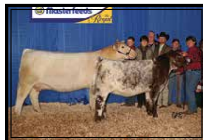
Hill Haven Breathtaker 35Y/Breathtaken 19B