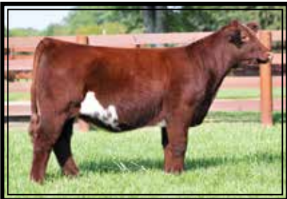
GCC Augusta Pride RW 44 - Top selling heifer $40,000, 2015 sale. Donor female for Moore Cattle Company.