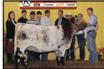
CF Boy Caroline 210 - Supreme Champion Female KILE; Reserve Supreme Female, Ohio State Fair; Champion Female, Heart of it All, Both Rings. Full sister in blood to Lot 10c.