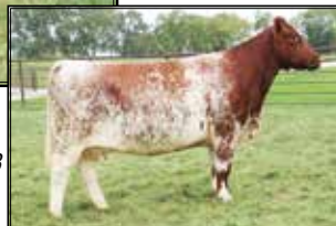
WHR Cumberland JR X918 ET, Dam of Lot 41.

Consignor: Turner Family Shorthorns, SharBen Shorthorns & Greenhorn Cattle Company