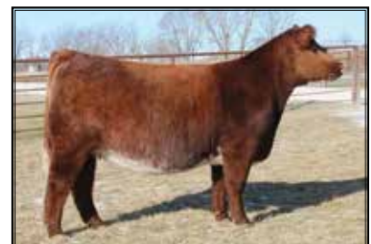
SULL Red Blooded Pride, dam of Lot 35.