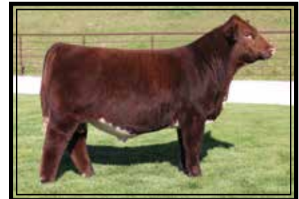
SULL Red Power