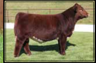
SULL Red Power