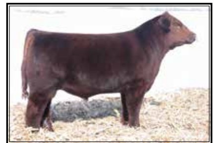
CF Margie 9105 SOL X ET