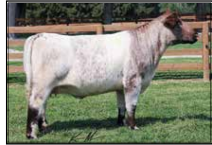
D&D Margie's Beauty 610S This breed leading donor is dam of Lots 2-2b.