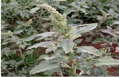
22. Ragweed Mix