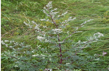
24. Lambs Quarters