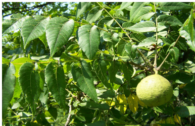
5. Black Walnut