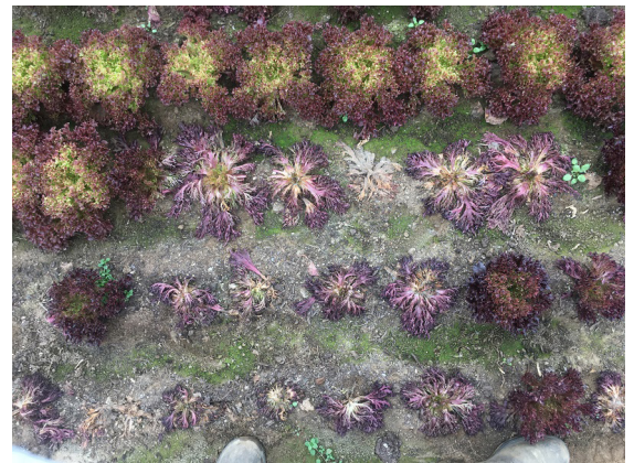
Bottom rot in lettuce.

Gray mold , caused by the fungus Botrytis cinerea , is a common pathogen in high tunnels year-round – it loves the high humidity in a tunnel. Botrytis produces lots of gray-brown asexual spores on the surfaces of infected tissue, giving them a fuzzy appearance. It is a weak pathogen; the spores cannot infect healthy, robust plant tissues initially but can infect weak or damaged tissues. In high tunnel tomatoes, Botrytis spores will infect senescent flowers or stems wounded from pruning, where the fungus is able to grow and gain strength before moving on to infect healthy fruit or stems. In winter lettuce crops, spores can infect senescent or damaged leaves (e.g. leaves that have been frosted or those cut during harvesting) and then move into the healthy stem and crown of the lettuce plants, causing the whole plant to melt. The leaves need to be wet for the fungus to infect. The fungus survives between plantings on crop residues and as sclerotia (small, hard, black masses of mycelia that serve as overwintering structures) in the soil. Botrytis often occurs along with other diseases, including bottom rot, moving in as a secondary pathogen.