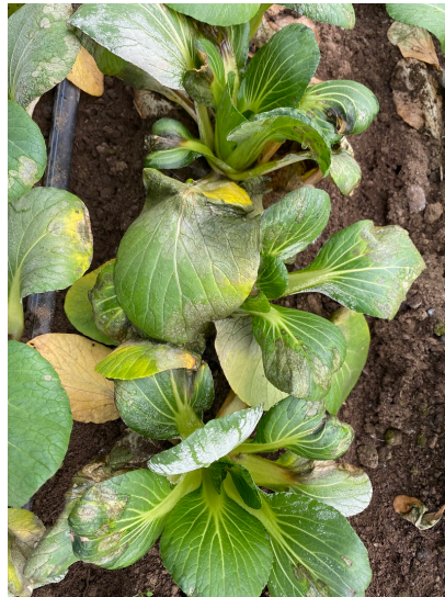
Rhizoctonia web blight in bok choy.

Rhizoctonia web blight was diagnosed on high tunnel Bok choy and Napa cabbage last month. Rhizoctonia solani is a fungus that is present in all soils and more commonly causes damping off in seedlings. In certain conditions, it can infect above-ground parts of plants, and causes water-soaked or necrotic spots and a characteristic white fungal mat on the surface of leaves and stems. [A fun plant pathology aside: Rhizoctonia is a basidiomycete – the same type of fungus as classic stem-and-cap mushrooms. All basidiomycetes produce spores on microscopic structures called ‘basidia’.