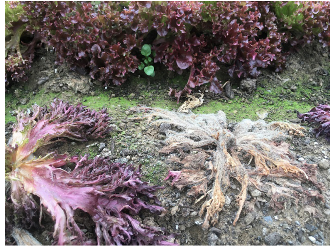
Gray mold in lettuce.

Lettuce drop or white mold also looks similar to gray mold and bottom rot. The fungus that causes lettuce drop, Sclerotinia sclerotiorum , is a more aggressive pathogen than Botrytis or Rhizoctonia , and can infect healthy crops. Its host range includes many vegetables such as tomato and beans. It produces sclerotia that can survive in the soil for many years. Sclerotinia produces notable fluffy white mycelium on infected tissues, and pea-sized (or larger) sclerotia within the plant tissue. For management recommendations for lettuce drop, see our white mold fact sheet .