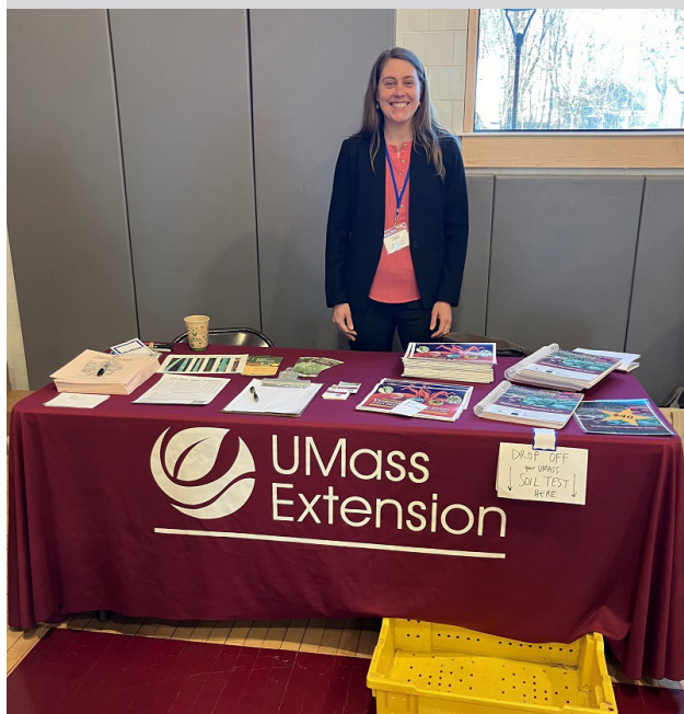
It was great to see a lot of you at the SEMAP conference last week! We have a bunch of upcoming in-person and online events, so we hope to see you there!