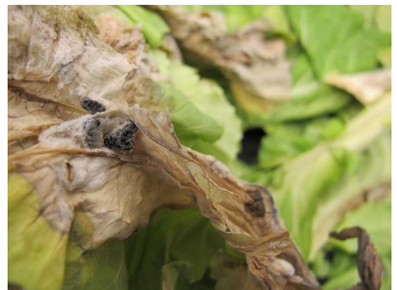
White mold mycelia and sclerotia in lettuce.

Bottom rot is a similar disease to gray mold, but caused by a different fungus, Rhizoctonia solani . This is the same fungus that can cause damping off in seedlings, wirestem in brassicas, and other seedling diseases. Similarly to Botrytis , it is not a super strong pathogen but can take off when plants are somehow weakened, like in the cold, dark winter when lettuce crops are growing slowly. Rhizoctonia survives in the soil, as mycelium or sclerotia, and infects lettuce leaves that are in contact with the ground. Unlike Botrytis , it does not produce spores on the surface of the infected tissue. Bottom rot is most commonly seen affecting older lettuce plants.