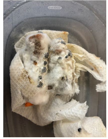
White mold mycelia and sclerotia on kale residue and carrot