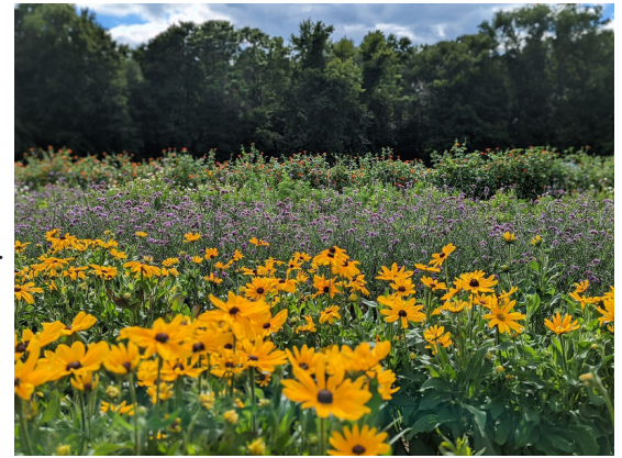
Cut flowers, Easthampton, MA.

However, there are very few resources for cut flower growers in Massachusetts and New England. Here at UMass, our Greenhouse, Floriculture and Vegetable Extension teams have been getting more cut flower questions. In response to this growing demand, we decided to survey cut flower growers to learn more about their needs. We distributed the survey in December 2021 and January 2022, and found that no single challenge stood out; instead, cut flower growers wanted help on a range of topics, including pests, diseases, soil health, marketing, finances and crop planning ( you can read the results here ).