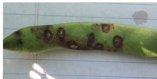
Sunken lesions of anthracnose on bean.