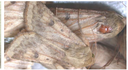
CEW adult, eggs, and caterpillars, showing variation in color.

Adults are yellow-brown moths, with a dark spot in the middle of each wing and a dark band across the bottom of each wing. Live or newly dead moths have light green eyes.