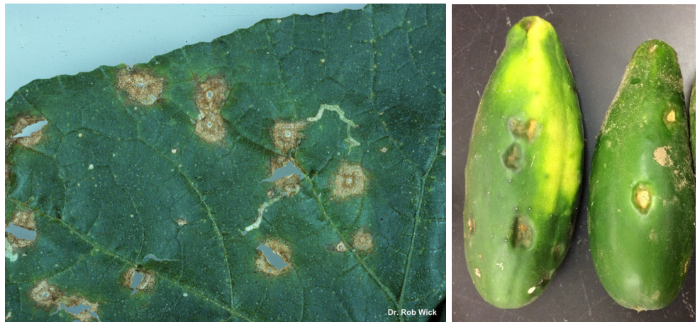
Shot-hole appearance of anthracnose on cucurbit leaves and sunken anthracnose lesions on cucumber fruit

Anthracnose affects mostly melons, watermelons, and cucumbers. Squash and pumpkins are less susceptible. The disease is caused by the fungus Colletotrichum orbiculare , which, like other anthracnose fungi, causes characteristic black, sunken lesions on affected fruit. Leaf spots are light-brown or reddish and appear near veins so may cause leaf distortion. These lesions dry out and the dead tissue may fall out, again leaving a “shot-hole” appearance. On stems and petioles, lesions are elongated and tan. Lesions on fruit are large, circular, sunken areas that turn black and may produce a pink ooze under humid or moist conditions. The fungus can be seed-borne and also survives on crop residue or volunteer plants (maybe in your compost or cull pile). Humid, rainy weather is necessary for disease to occur. There are three races of the fungus that affect different crops.