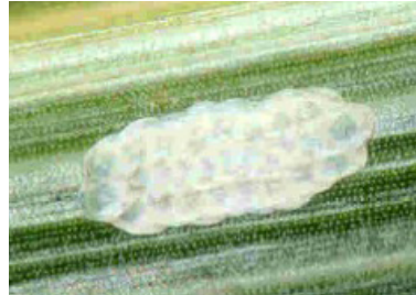
ECB eggs, adult, and caterpillar.

Adults are \frac{3}{4} inch long moths, white to tan, with 2 dark, serrated lines running across the lower part of the forewings.