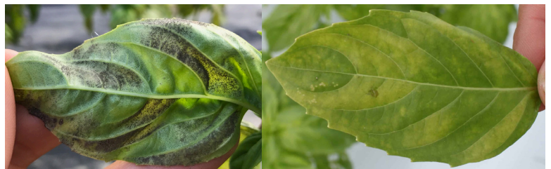
Basil downy mildew on the underside (left) and top side (right) of a basil leaf.

Do you have downy mildew in your basil crop? Let us know, if so! We report this disease on a county-wide basis to let other growers know when to be on the lookout and start treating basil crops. Email us at umassveg@umass.edu or call us at 413-577-3976 if you suspect basil downy mildew on your farm or in your garden.