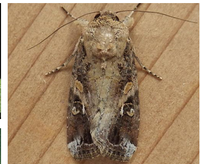
FAW adult, eggs, and caterpillar.