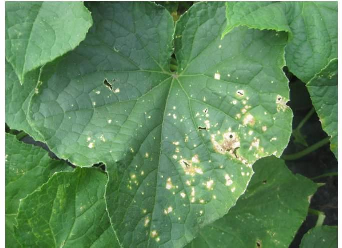
Angular leaf spot on zucchini. Spots will expand until they are trapped by leaf veins.

the lower leaf surface. The wet-looking spots will dry out and turn yellow-brown or the dead tissue may fall out leaving a “shot-hole” appearance. Yellowing of the leaf between lesions may occur where disease severity is high. Similarly, water-soaked spots may appear on stems and petioles, drying out to form a whitish crust. Spots can also appear on fruit, where they begin as tiny and water-soaked, but dry to form whitish, chalky, spots, rendering the fruit unmarketable. The spots on fruit can also develop into internal fruit decay. Fruit that is infected early may be deformed. Affected plants will grow poorly and produce less fruit. Resistant varieties are available. If you catch angular leaf spot early, copper may be effective in reducing its spread.