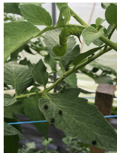
Hornworm in tomato. You'll often see their poop first, and then find the well-hidden caterpillar above.