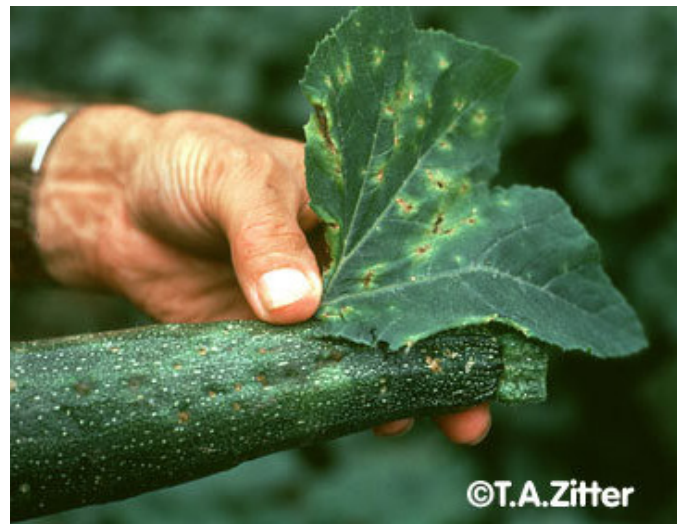
Scab on zucchini.

Scab is caused by the fungus Cladosporium cucumerinum and can be a significant problem for summer and winter squash, pumpkin, melon, and watermelon. Lesions may occur on leaves, stems, petioles, and fruit, with fruit spots being the most damaging. Leaf spots are small, pale-yellow to white, and similarly to angular leaf spot, the dead tissue in the center of the lesion may fall out leaving a “shot-hole” appearance. Stem or fruit lesions may occur despite the absence of leaf lesions. Lesions on stems are elongate and light-colored, and if numerous may cause the internodes to shorten, giving the plant a deformed appearance. Scab lesions on fruit are sunken, irregular cavities with corky margins, and may produce a golden brown ooze, which dries into brown beads. Sporulation on lesions may occur, giving them an olive-green, felt-like appearance. This disease usually occurs in mid-summer and is favored by cool, dry days and rainy or dewy nights.