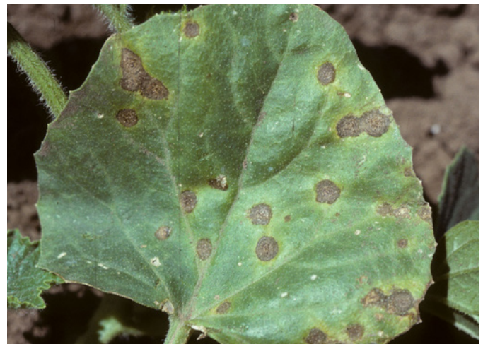
Septoria leaf spot of cucumber.

Septoria leaf spot is less common, occurring in cool summers or late fall. This disease is caused by the fungus Septoria cucurbitacearum , which causes small, almost white, round spots on leaves and superficial, raised tan bumps on fruit. Spores are spread from plant to plant via splashing rain or overhead irrigation, as well as by insects, workers, and equipment moving through the field.