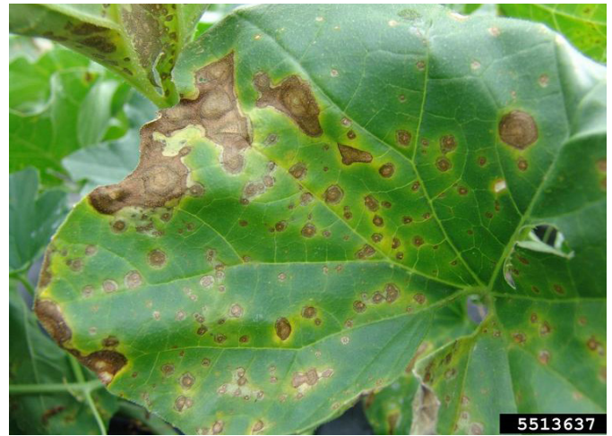
Alternaria on cantaloupe. Concentric rings make Alternaria leaf spots look like targets.

Alternaria leaf spot affects all cucurbit crops but is most common on cantaloupe. This disease is caused by the fungus Alternaria cucumerina . Like the Alternaria species that cause leaf spots in brassicas and early blight in nightshades, A. cucumerina causes a characteristic target-like spot. Usually, leaf spots are small and start out as tan flecks that enlarge and merge together. These larger spots (up to a half-inch) may exhibit the concentric rings common of all Alternaria fungi. This disease usually occurs in mid-season and can reduce late-season fruit production. Fruit lesions may also occur as sunken lesions with dark, olive-green, felt-like sporulation present in rings. Spores are spread from plant to plant via splashing rain or overhead irrigation, as well as by insects, workers, and equipment moving through the field.