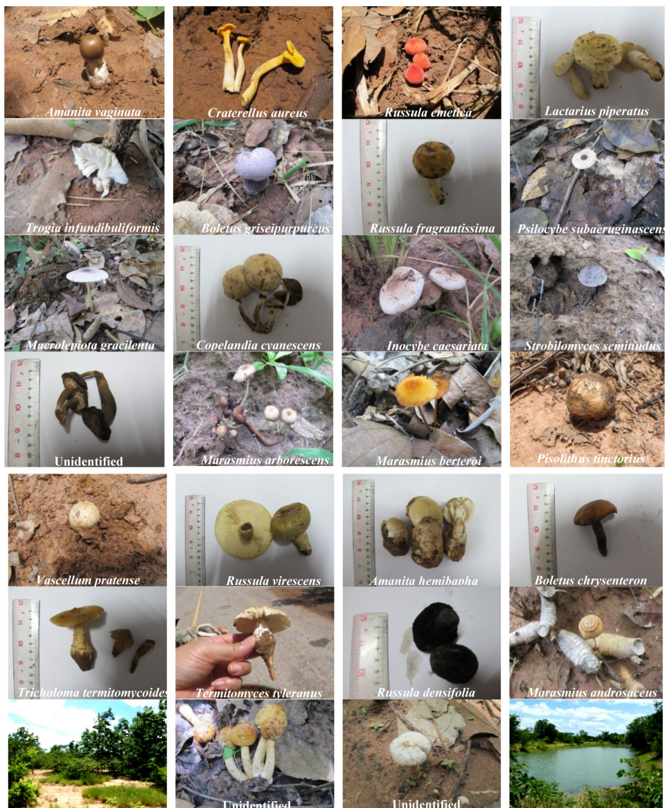
Figure 2 Represent all species of mushrooms in area of Pongsongkram community forestry, Non Sung district, Nakhon Ratchasima province during June 2013 to August 2013.

In addition, we studied biodiversity of wildlife animals at the same area between March 2013 to September 2013 by interviewing hunter people as well as cooperation surveyed with the villagers. The traps were placed onto the sampling area including the netting on the route expected that animals move through. Our results found the total