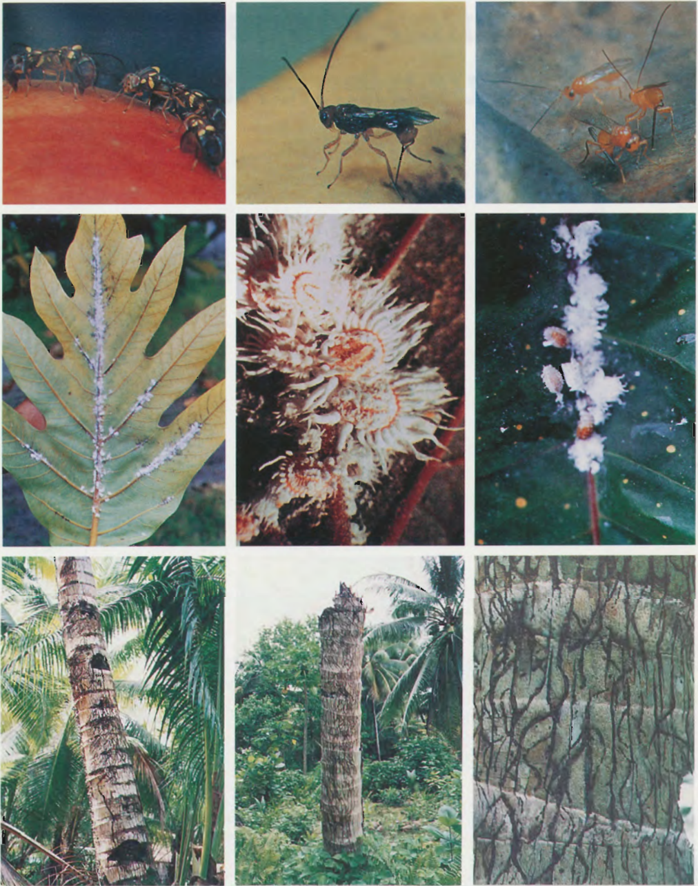
Plate 1 Top line: 1. Bactrocera tryoni ovipositing in an apple. 2. Fopius arisanus probing a banana for tephritid eggs. 3. Diachasmimorpha longicaudata probing for tephritid larvae. Middle line: 4. Icerya aegyptiaca on a breadfruit leaf (D.P.A. Sands). 5. Adult I. aegyptiaca with wax filaments displaced by blowing lightly (G.S. Sandhu). 6. Larvae of Rodolia attacking I. aegyptiaca (D.P.A. Sands). Bottom line: 7. Coconut palm with bark channels of Neotermes rainbowi (M. Lenz). 8. Coconut palm stump following loss of top (M. Lenz). 9. Bark channels characteristic of N. rainbowi (M. Lenz).