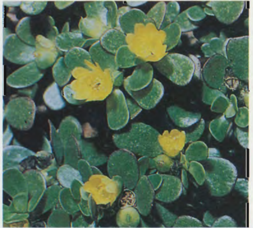
Plate 2 Top line: 1. Thicket of Clerodendrum chinense in Western Samoa. 2. Roadside thicket of C. chinense in Fiji (D.P.A. Sands). Middle line: 3. Flower head of C. chinense (D.P.A. Sands). 4. Phyllocharis undulata and damage to Clerodendrum leaf (B. Napompeth). Bottom line: 5. Young prostrate plant of Portulaca oleracea (J.T. Swarbrick). 6. P. oleracea in flower (W.A. Whistler).