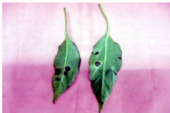
Photo 1. Typical Symptoms of Cercospora leaf spot of Chilli leaves

Symptoms: Dark brown spots with ashy centre were observed on the leaf surface (Photo 1). On fruits, the lesions were deep brown enlarged mainly on ripening fruits (Photo 2). The fungus formed brown mycelial growth on PDA (Photo 3). Under microscope, cells structures of Cercospora capsici were observed (Photo 4).