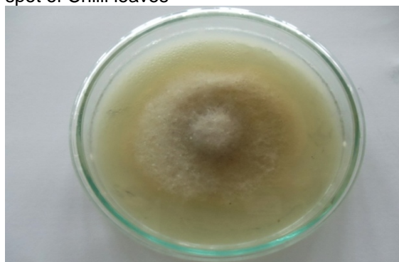
Photo 3. Five days old culture of Cercospora capsici grown on PDA media.