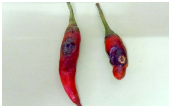
Photo 2. Typical Symptoms of Cercospora leaf spot of Chilli fruit