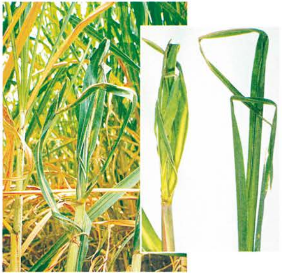
Figure 3. Myriogenospora leaf binding: adhering leaves (BSES).