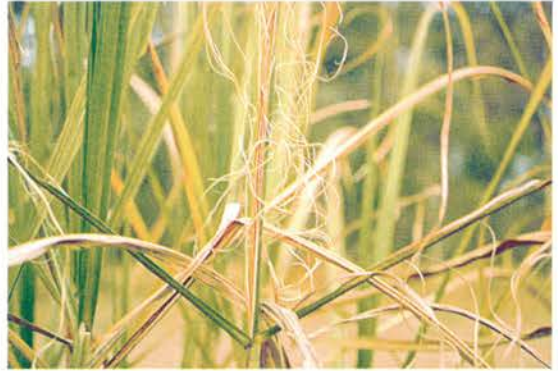
Figure 2. Leaf splitting: split leaves looking like long-tangled coarse hair (J.C. Comstock).