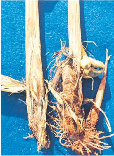
Figure 1. Iliau: binding of leaf sheaths and distortion of emerging stem (S. Matsuoka).